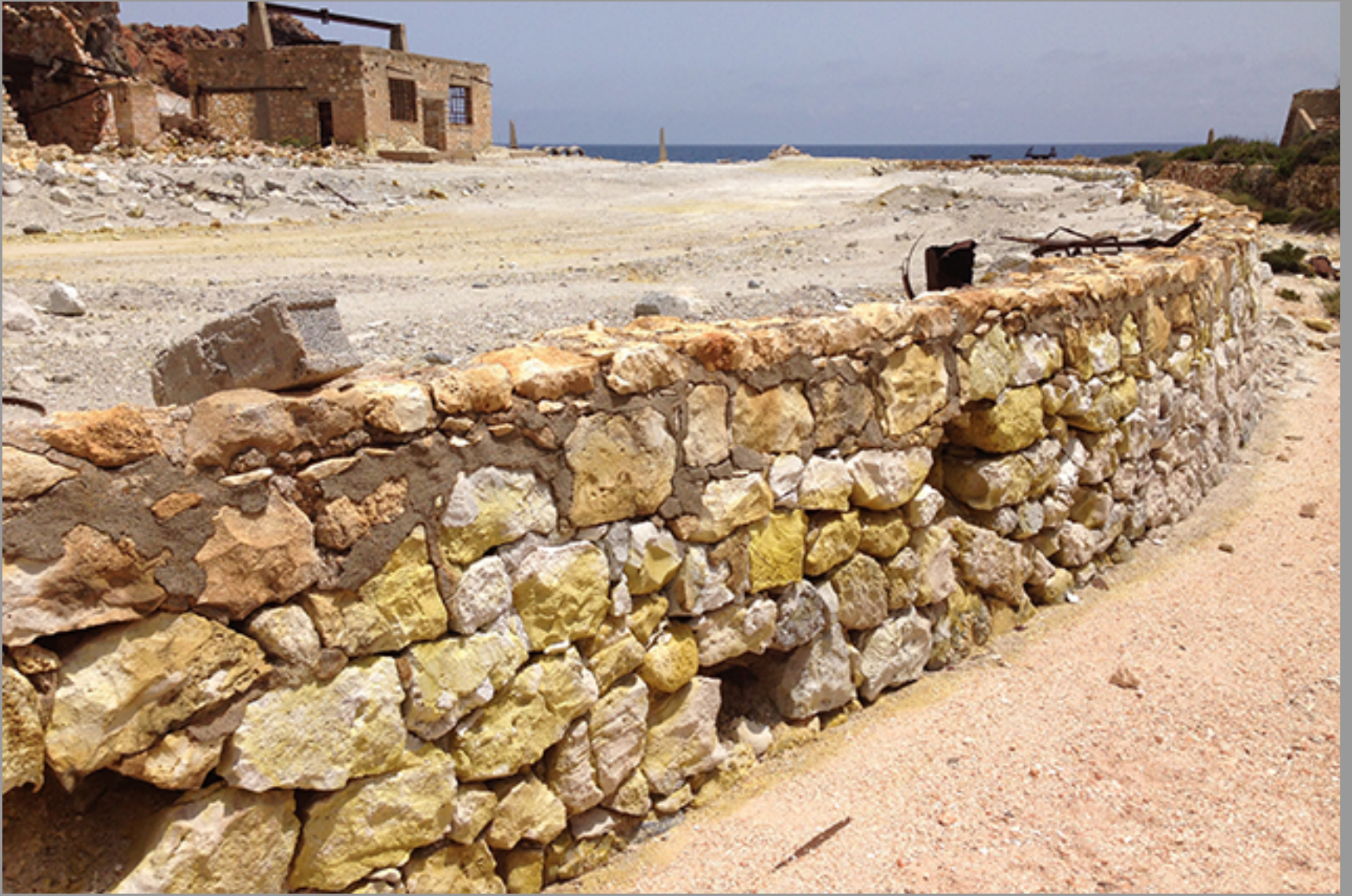
old one (Paliorema) with nothing much there