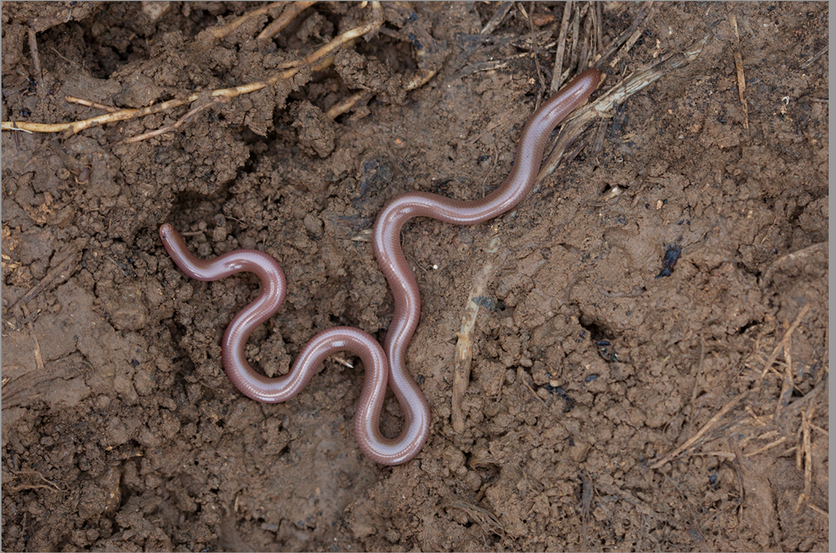
Xerotyphlops vermicularis vermicularis