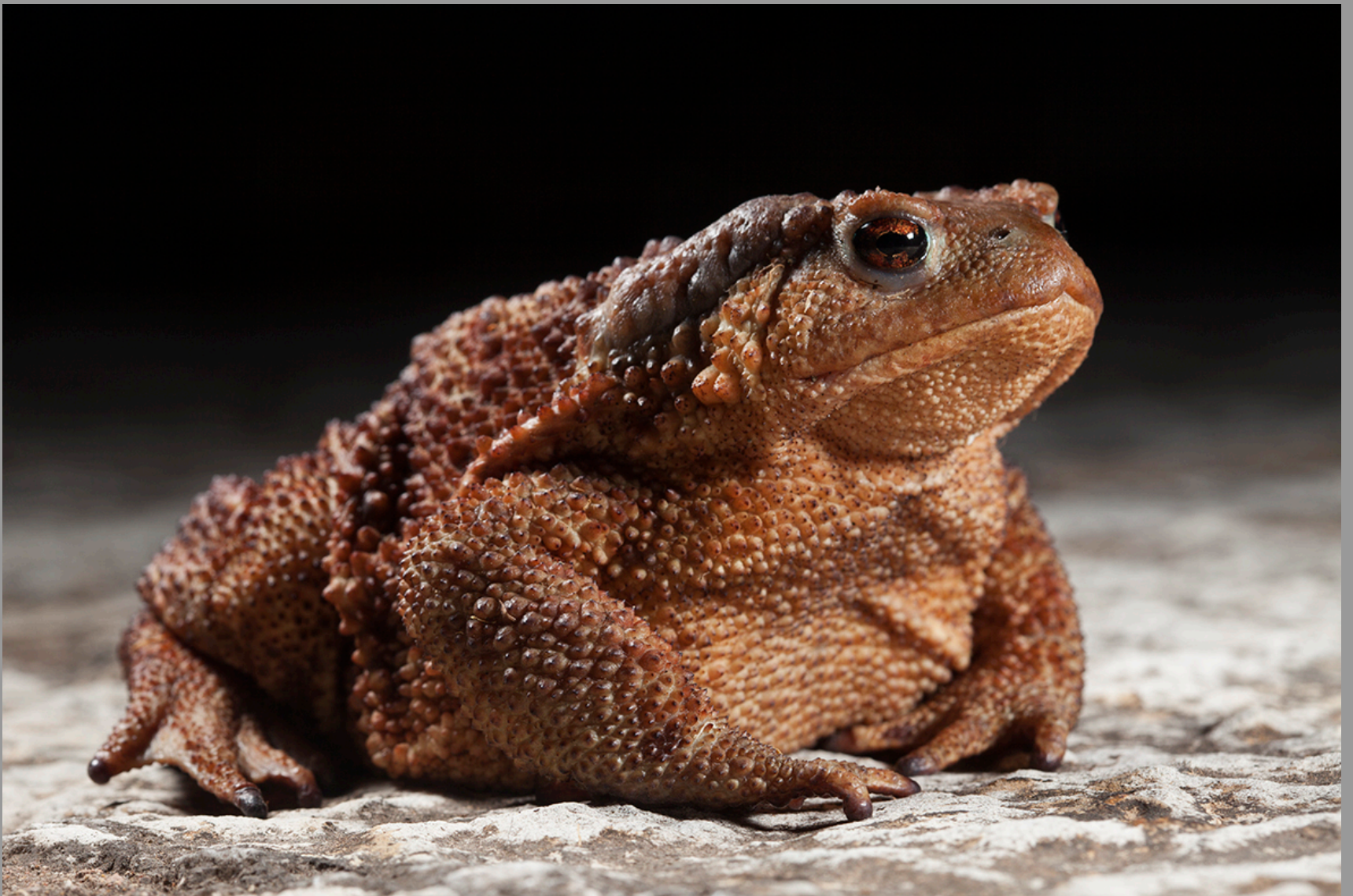
Bufo bufo bufo