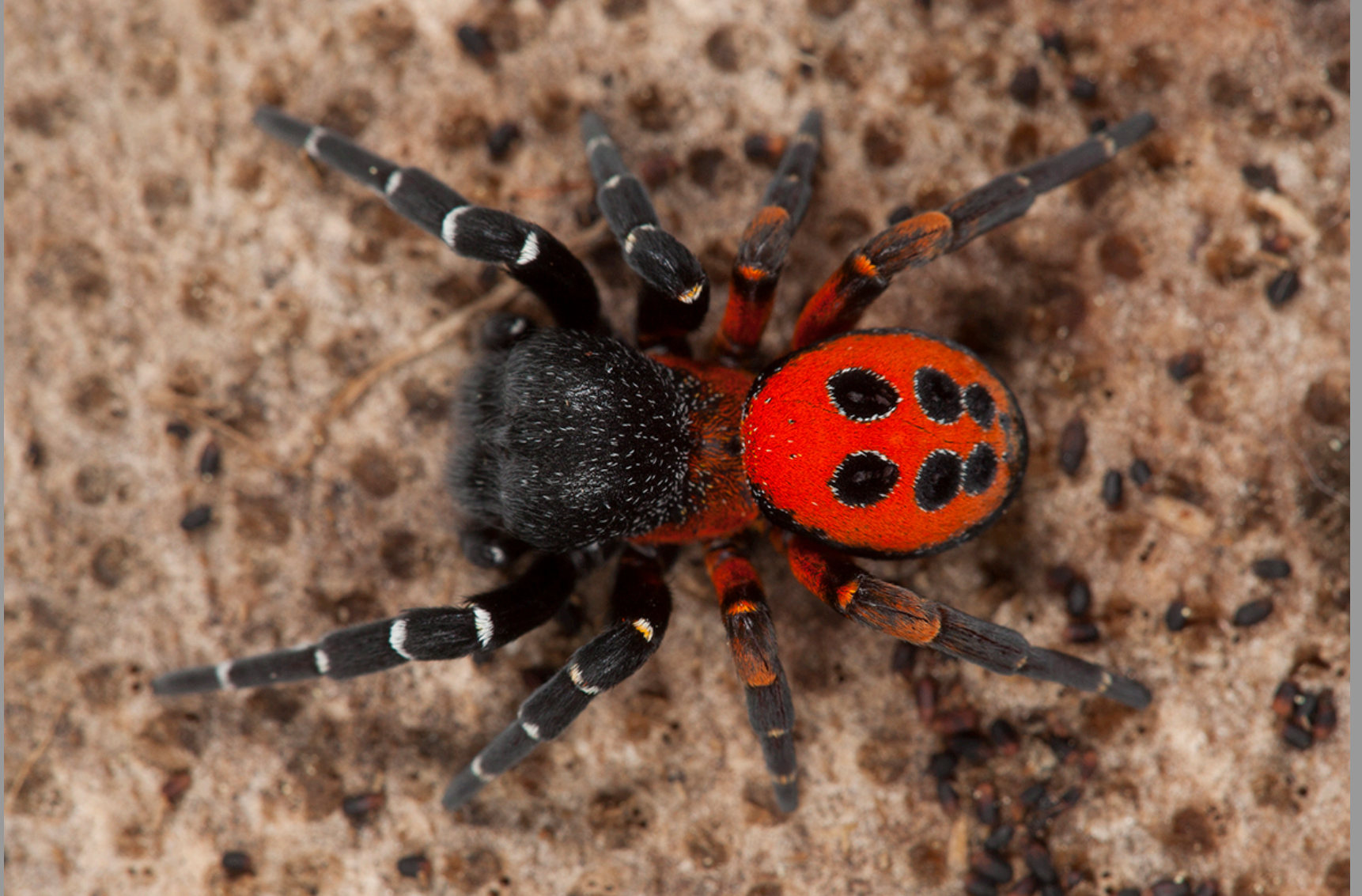
Eresus sp., male