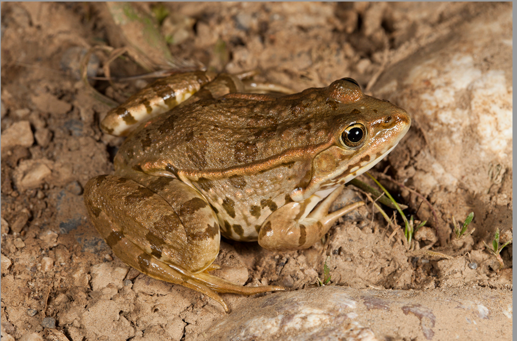
Pelophylax (ridibundus) kurtmuelleri