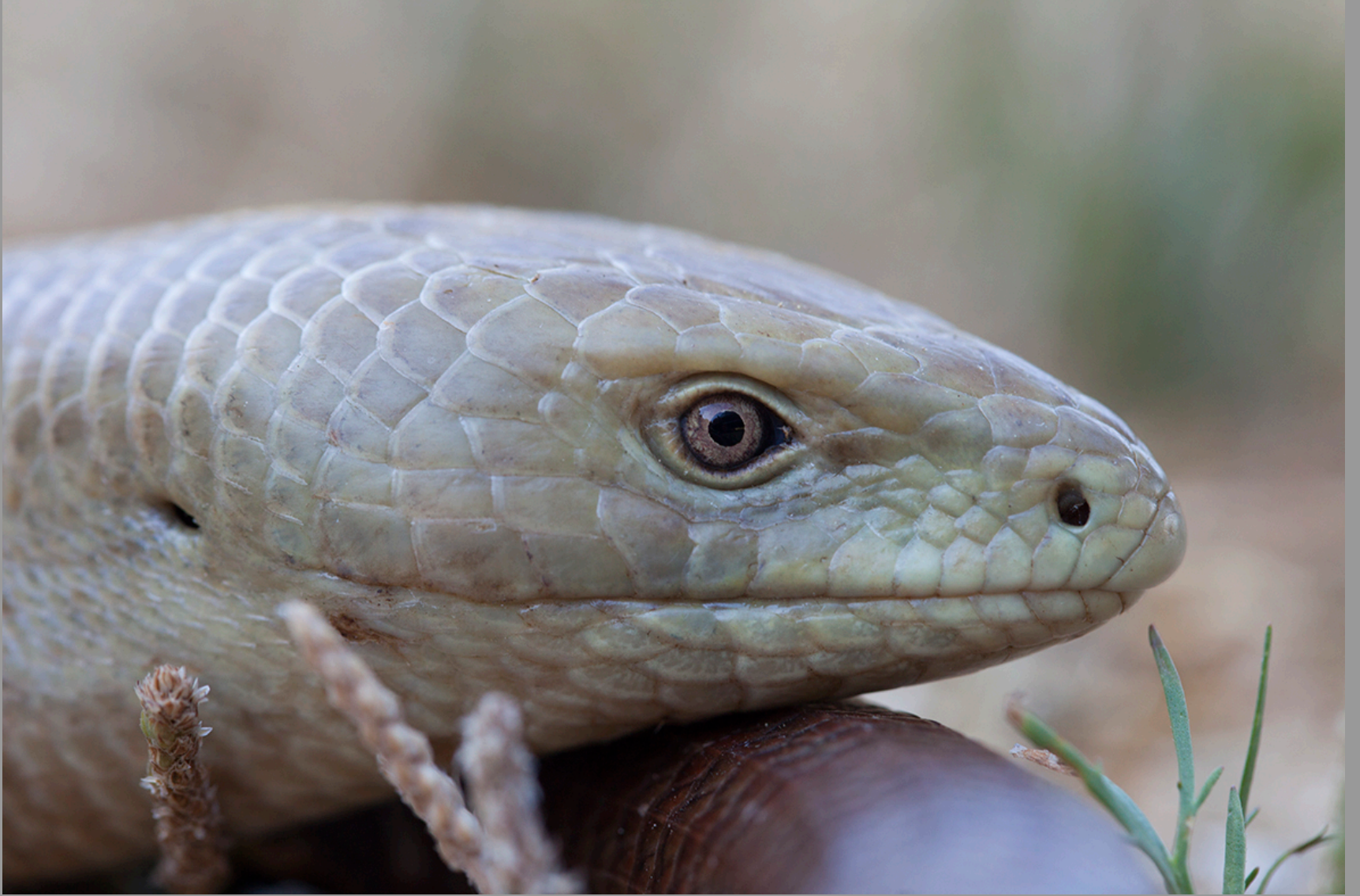
Pseudopus apodus thracius