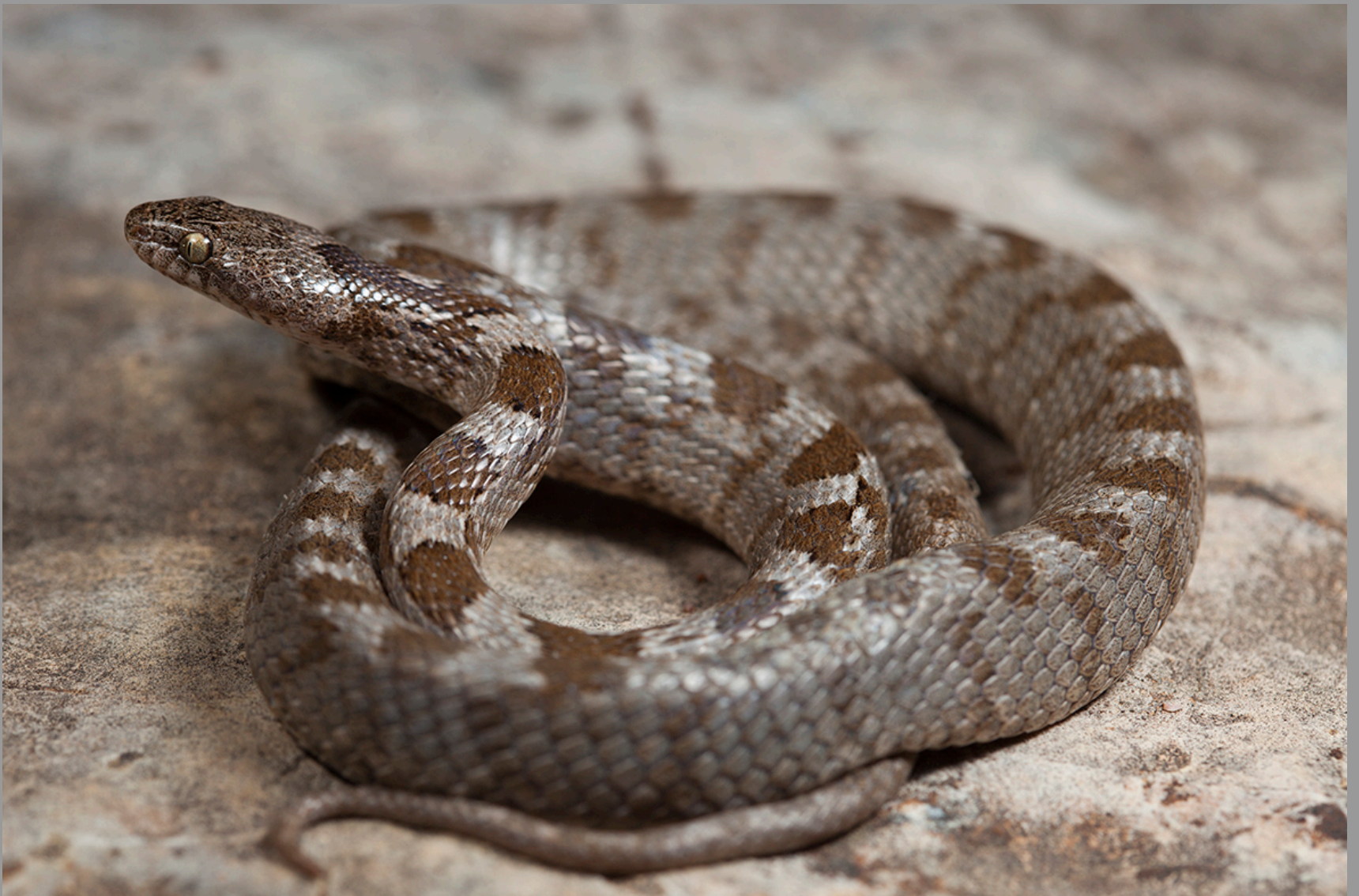
Telescopus fallax fallax