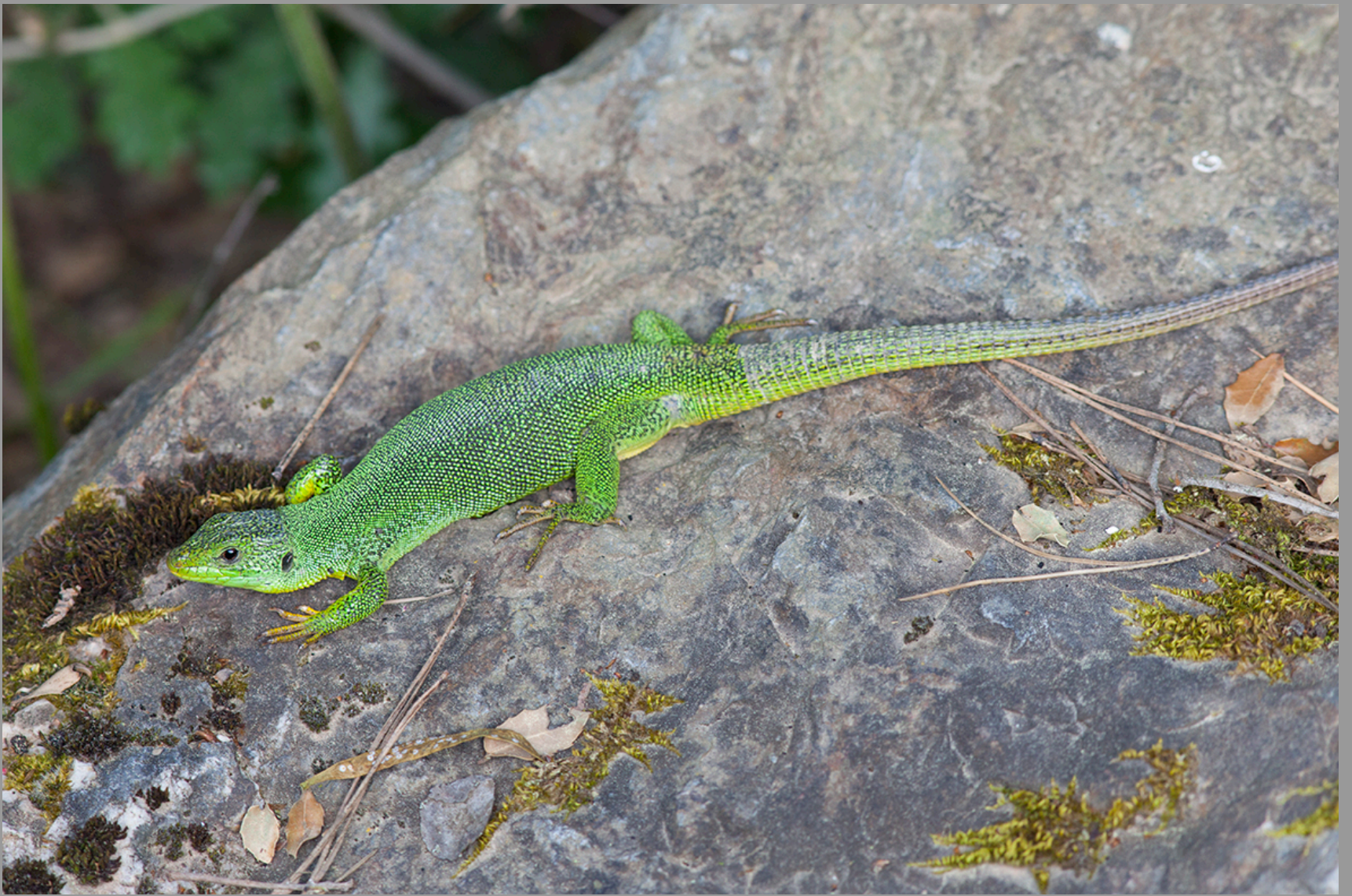
Lacerta trilineata trilineata