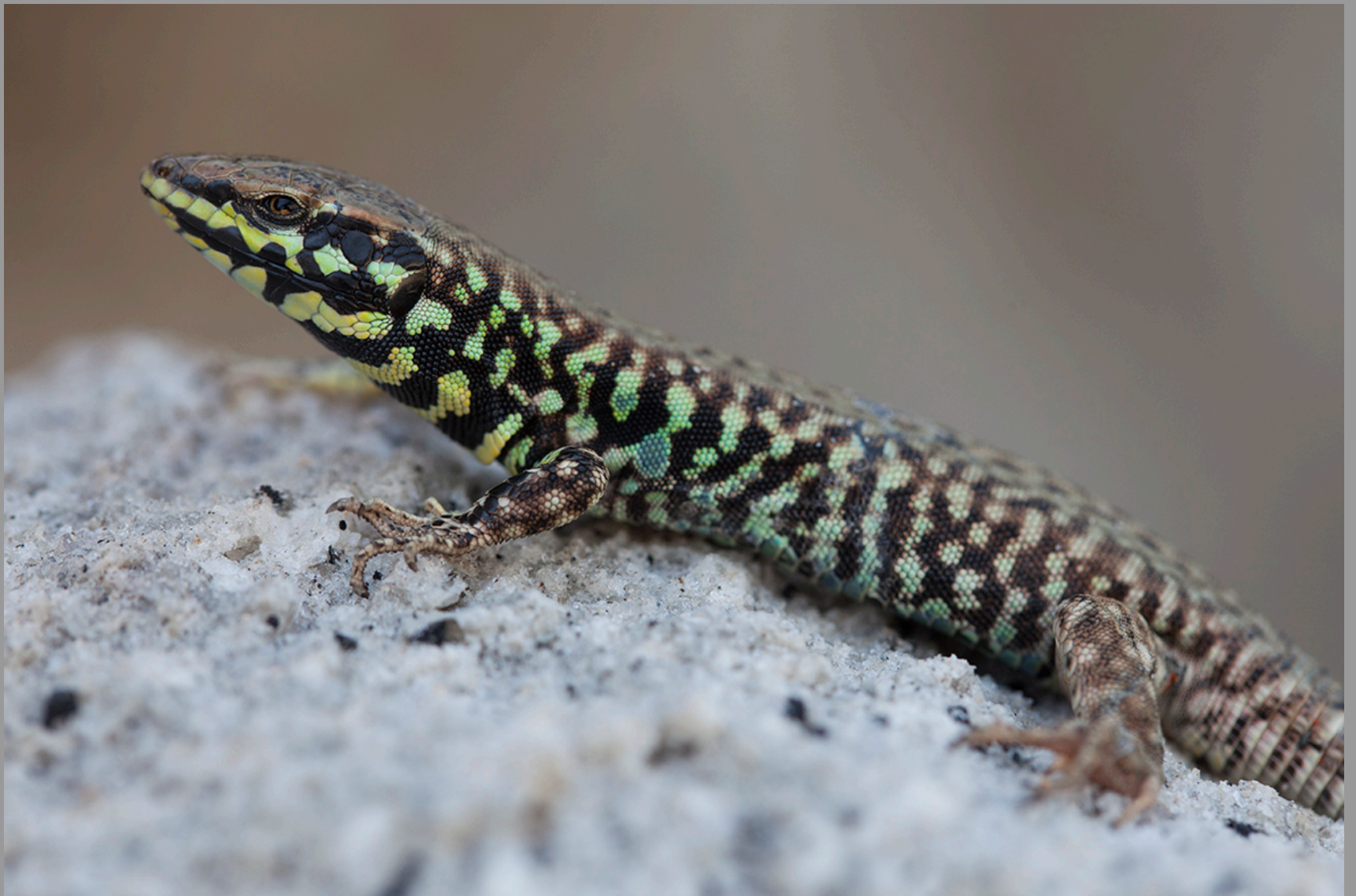
Podarcis milensis milensis , male