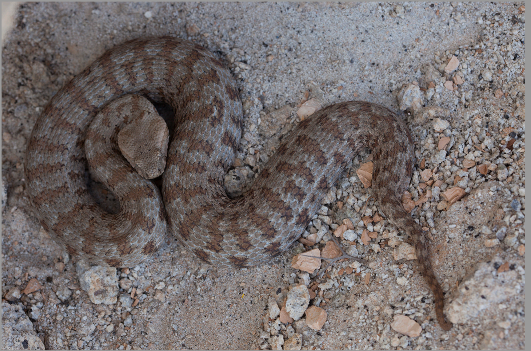
Macrovipera lebetina schweizeri