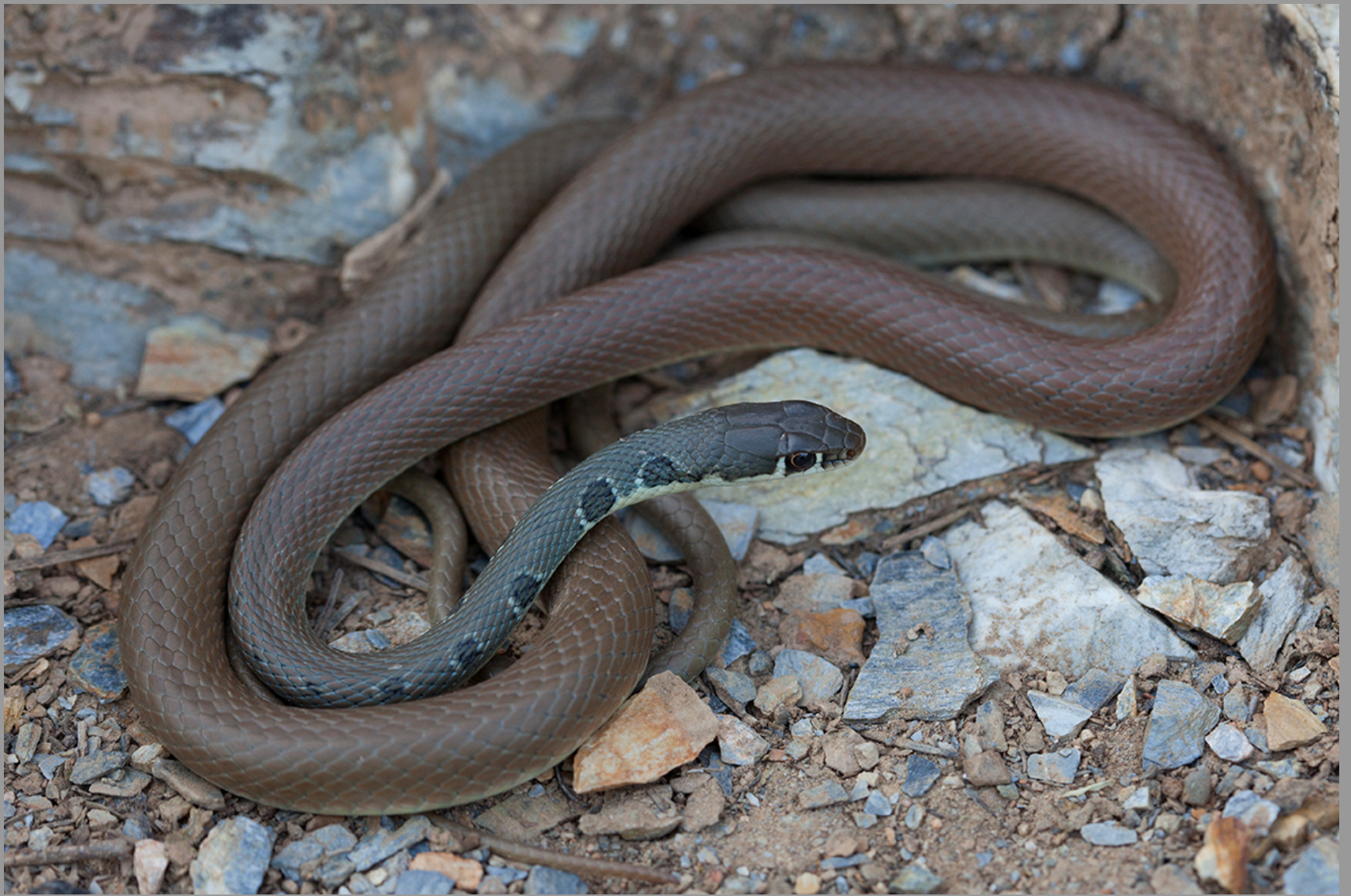
Platyceps najadum dahli