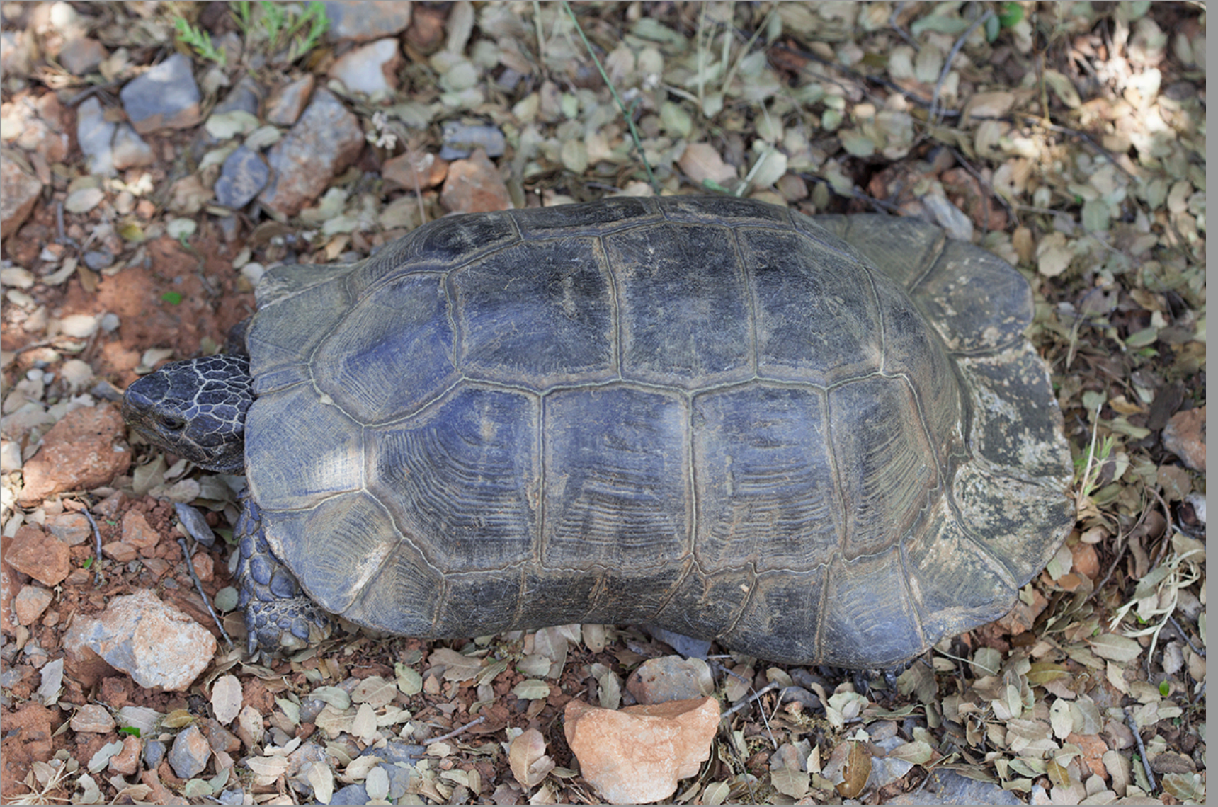
Testudo marginata marginata