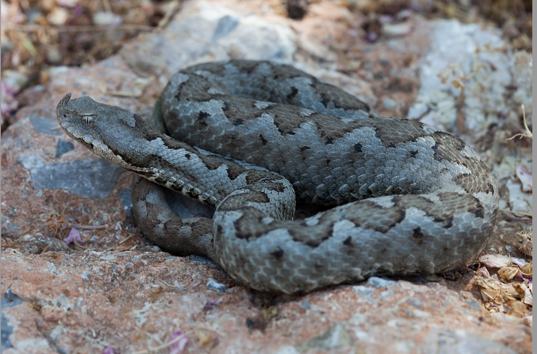
Vipera ammodytes meridionalis , male