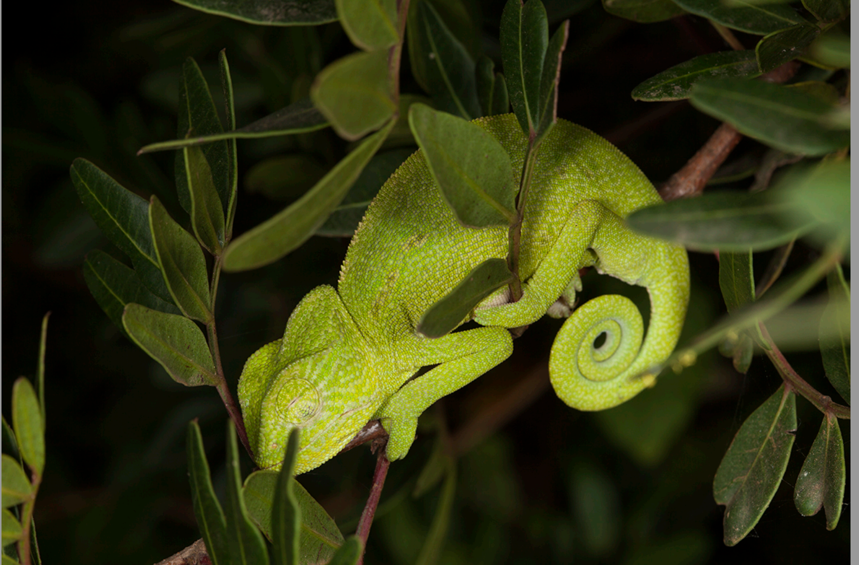
other, sleeping :)