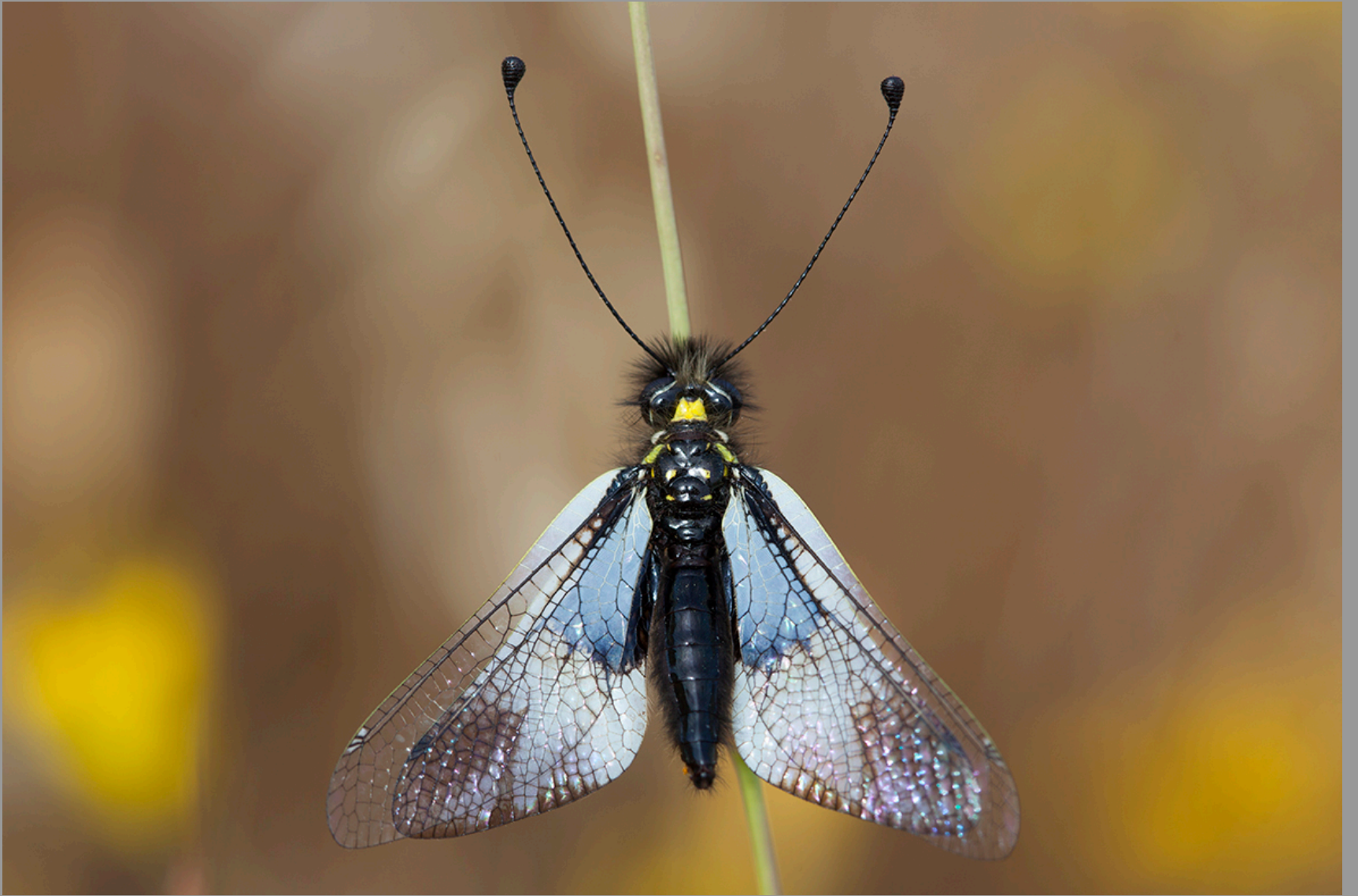
Libelloides ottomanus (lacteus)