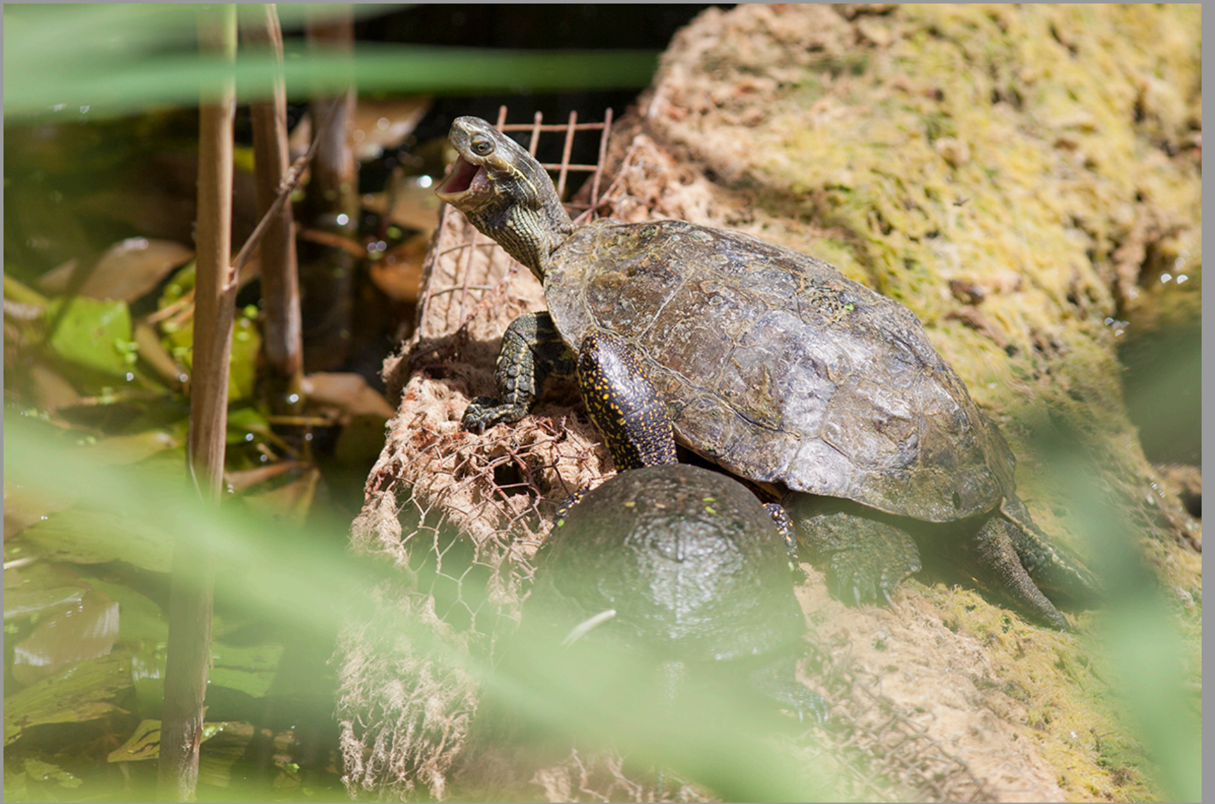
Mauremys rivulata & Emys orbicularis hellenica