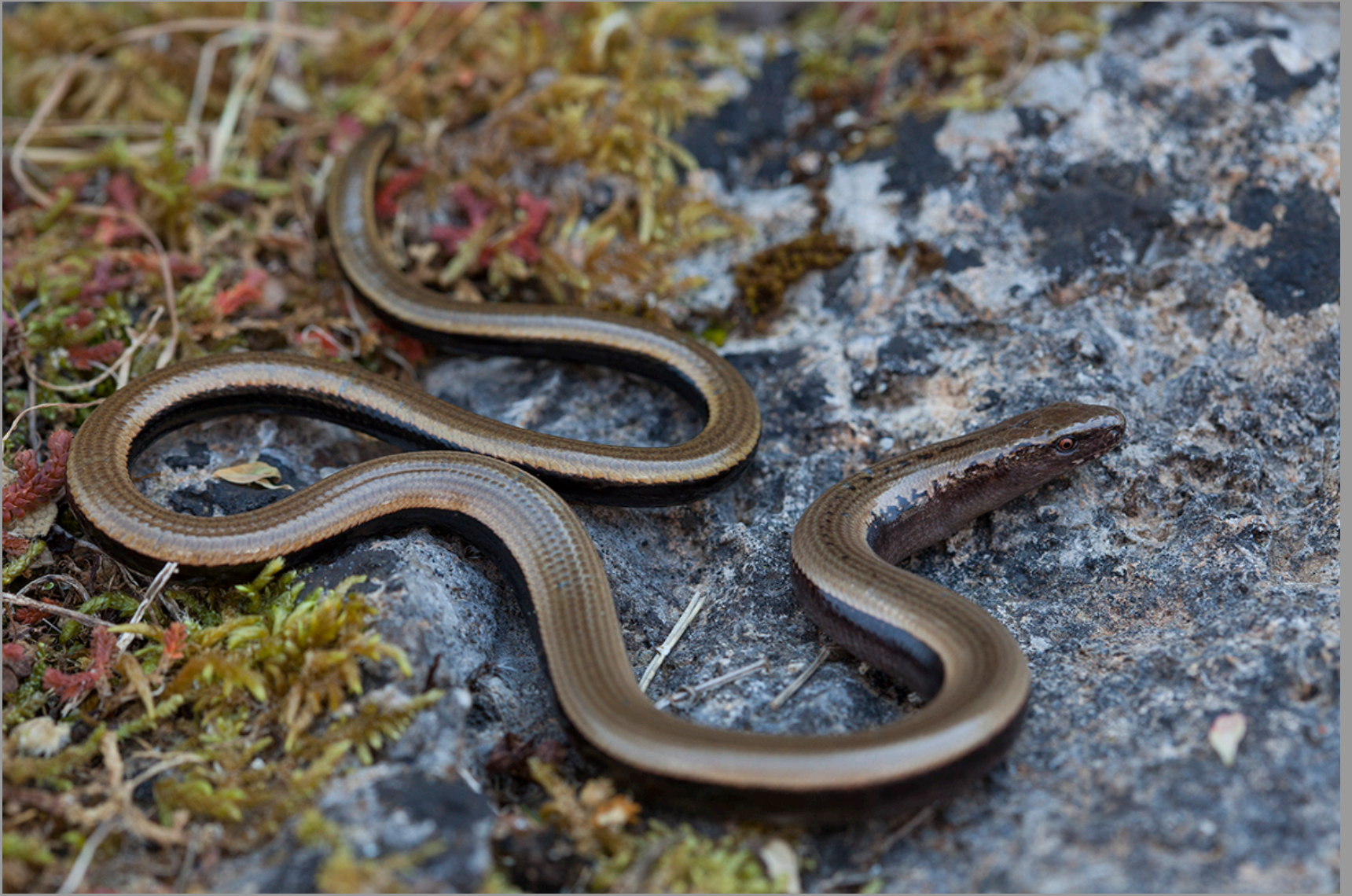
Anguis cephallonica , the single specimen of the trip (very dry everywhere)