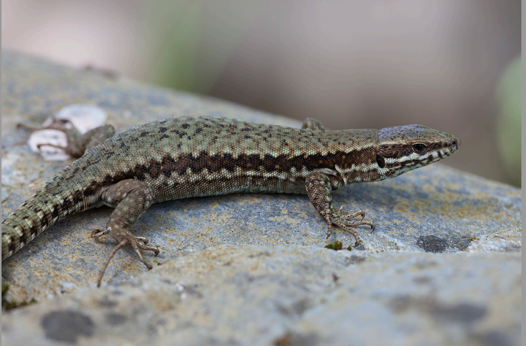
Podarcis muralis muralis