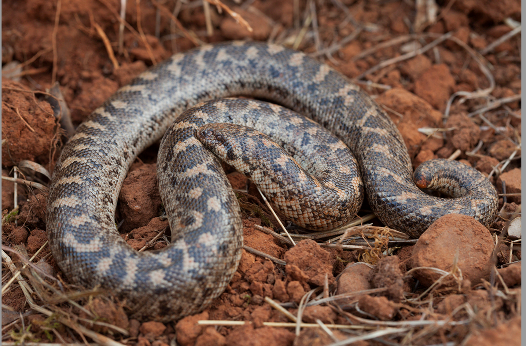
Eryx jaculus turcicus