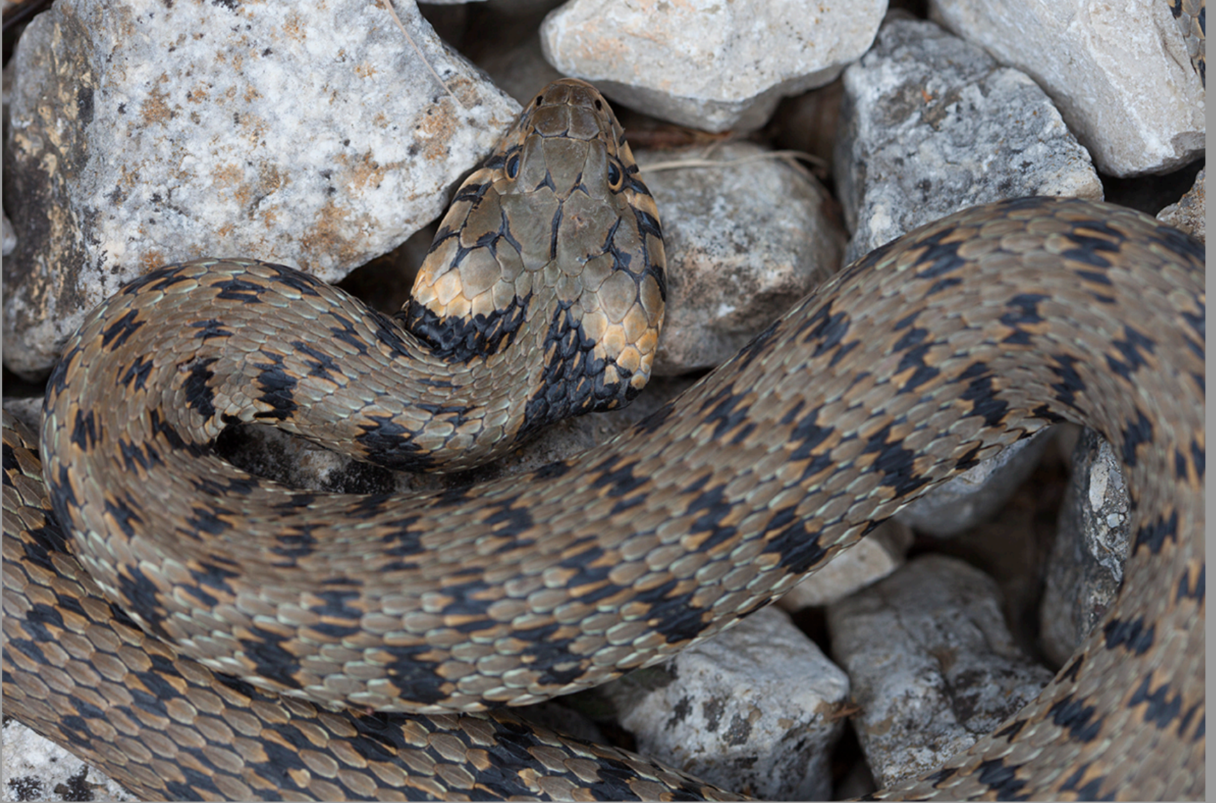
Natrix natrix persa