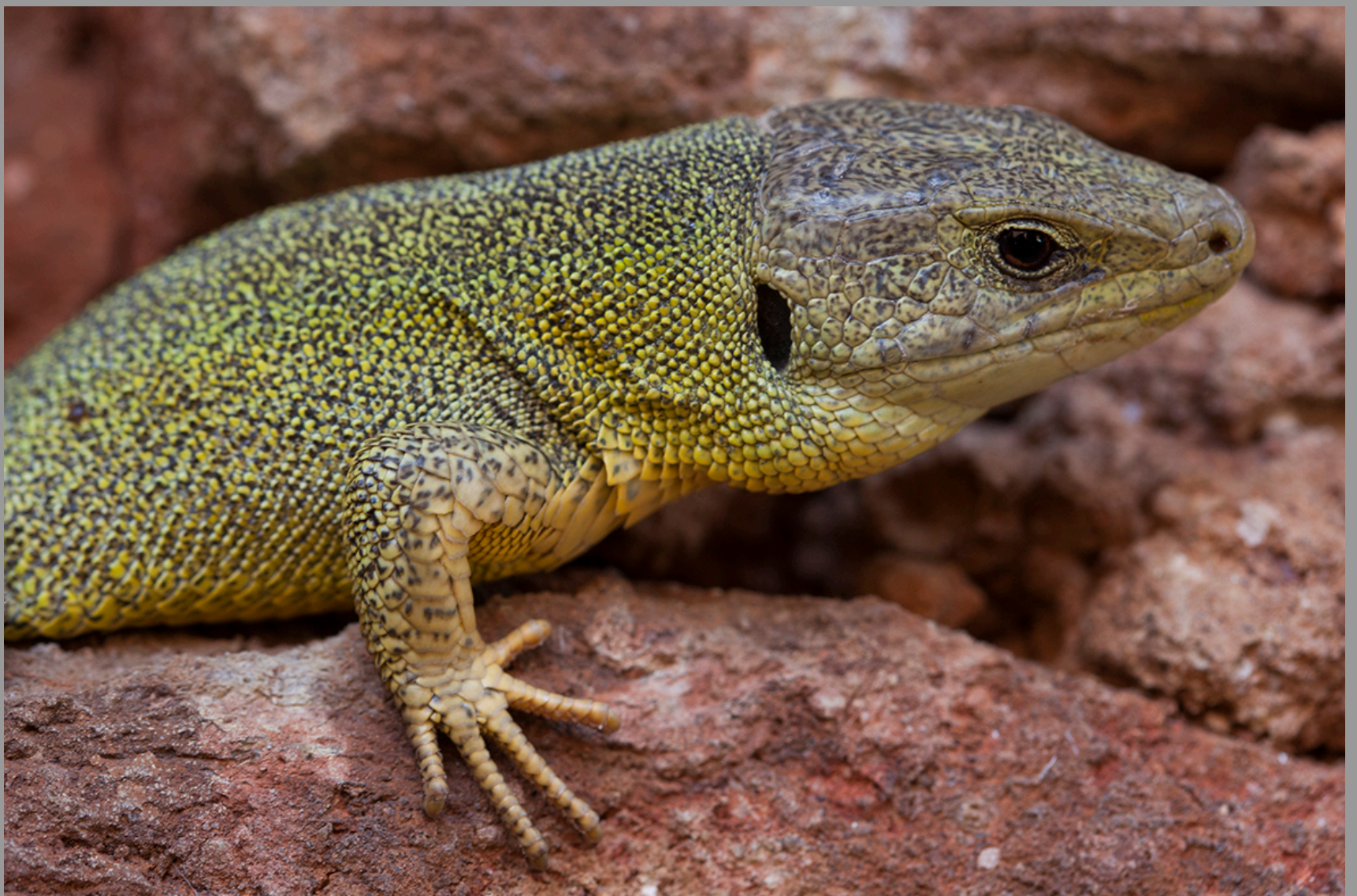
Lacerta trilineata hansschweizeri