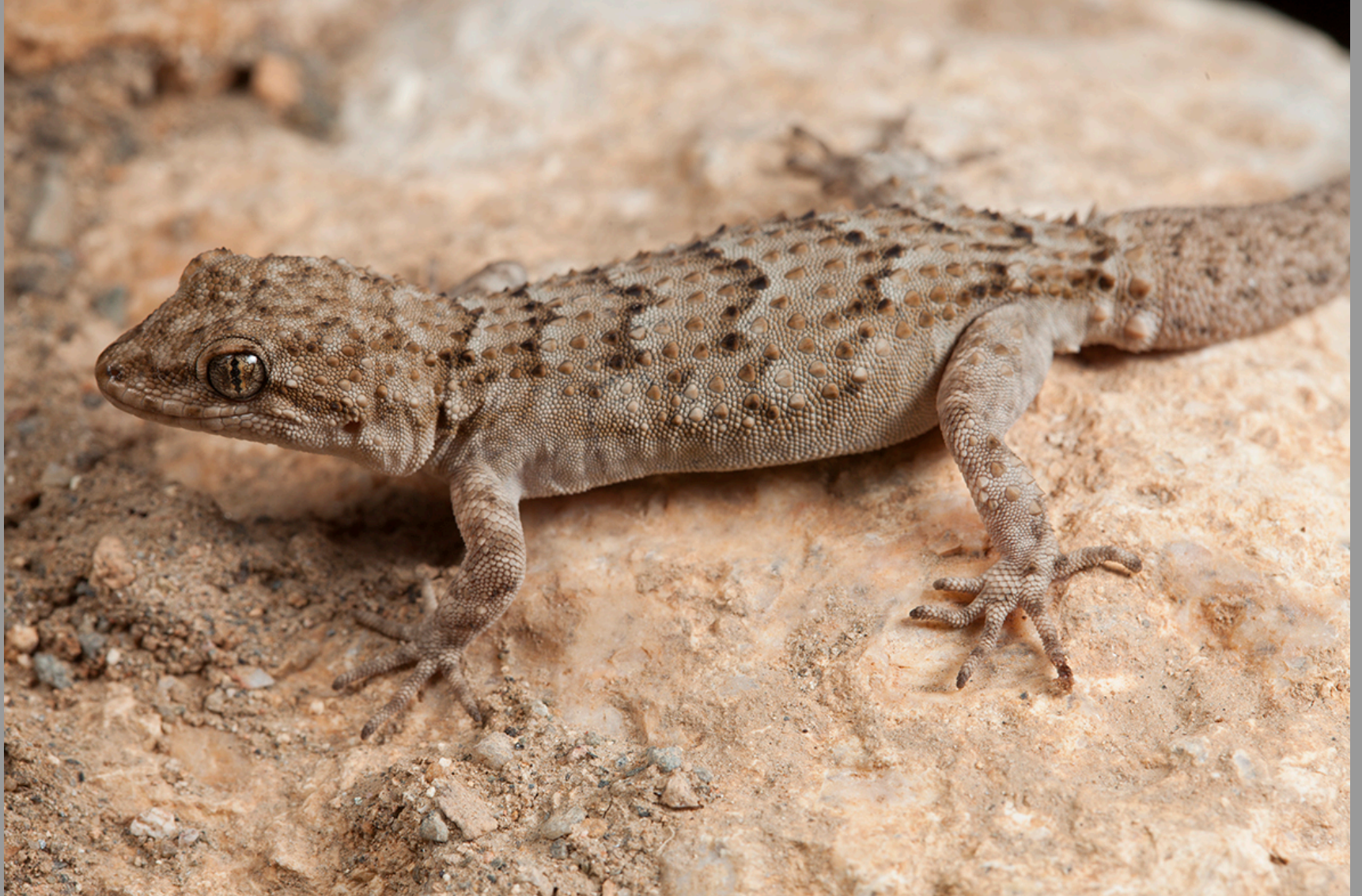
Mediodactylus kotschy saronicus