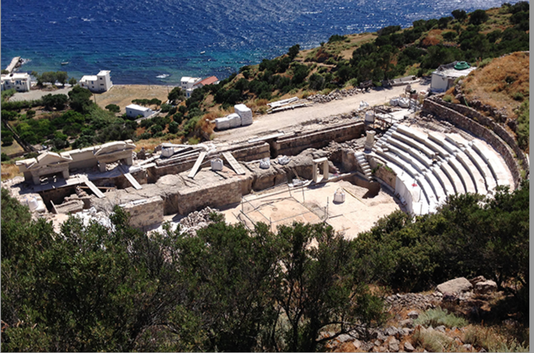
Amphitheatre where was found....