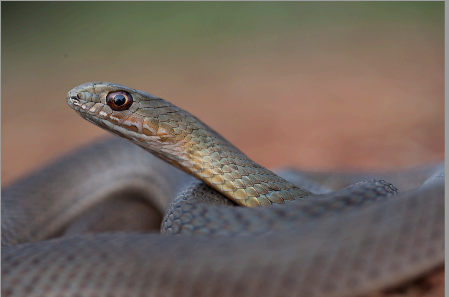
Malpolon insignitus fuscus