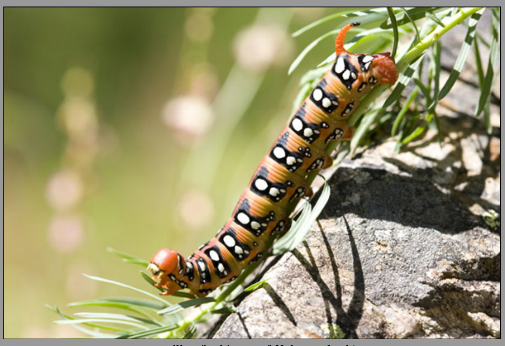
caterpillar, final instar of Hyles euphorbiae

Next stop to the Mont Viso, onto Italian side. After sundown, I climbed the mountain and inspected a small area near a path. Here, I found 6 Salamandra lanzai males and females; I stopped my nocturnal prospecting to reach the Switzerland early the next day.