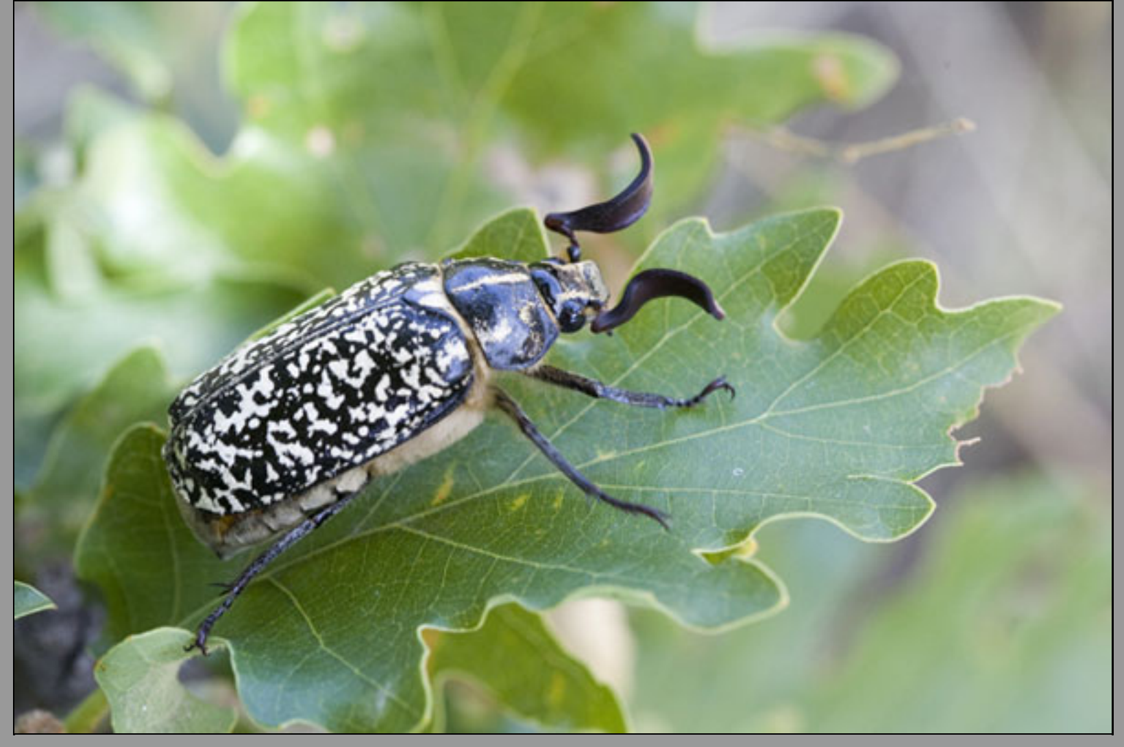
Polyphylla fullo, male