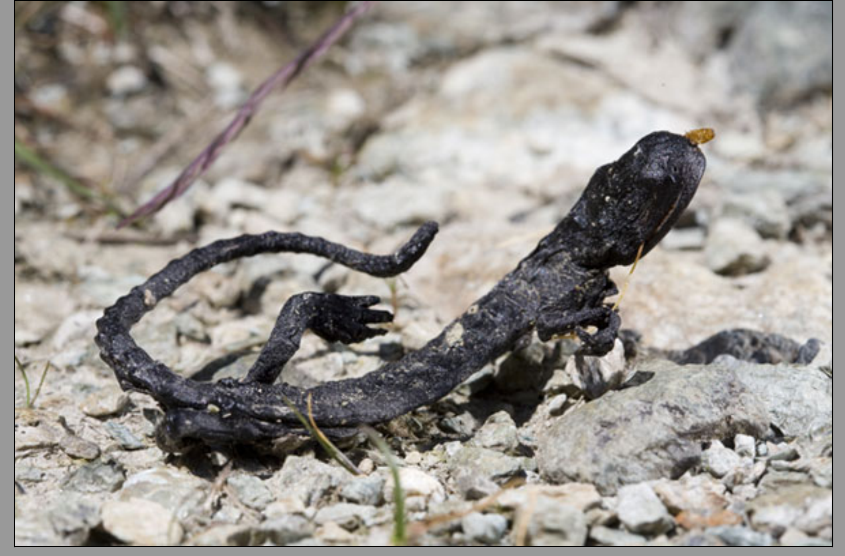
another one crushed on the path

Short hike in the mountains, in the Martigny region, always above all for insects but nevertheless with 3 black Vipera aspis atra and 2 Anguis fragilis .