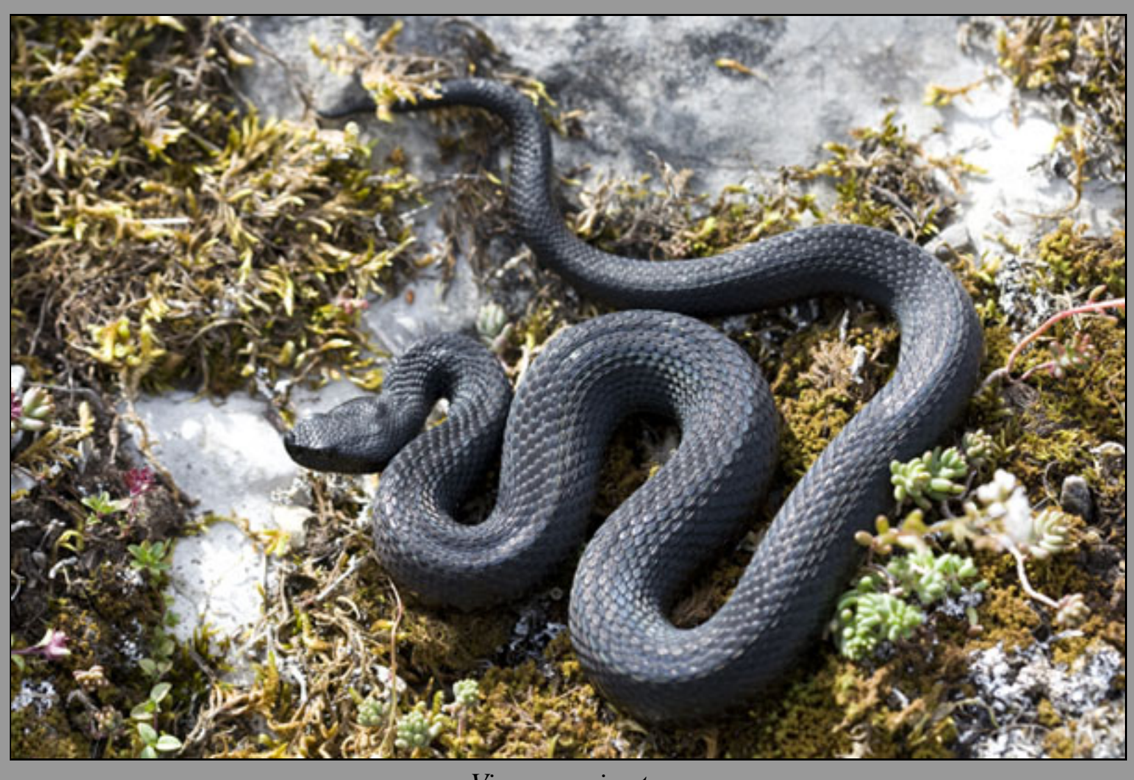
Vipera aspis atra

Short hike in the mountains, in the Martigny region, always above all for insects but nevertheless with 3 black Vipera aspis atra and 2 Anguis fragilis .