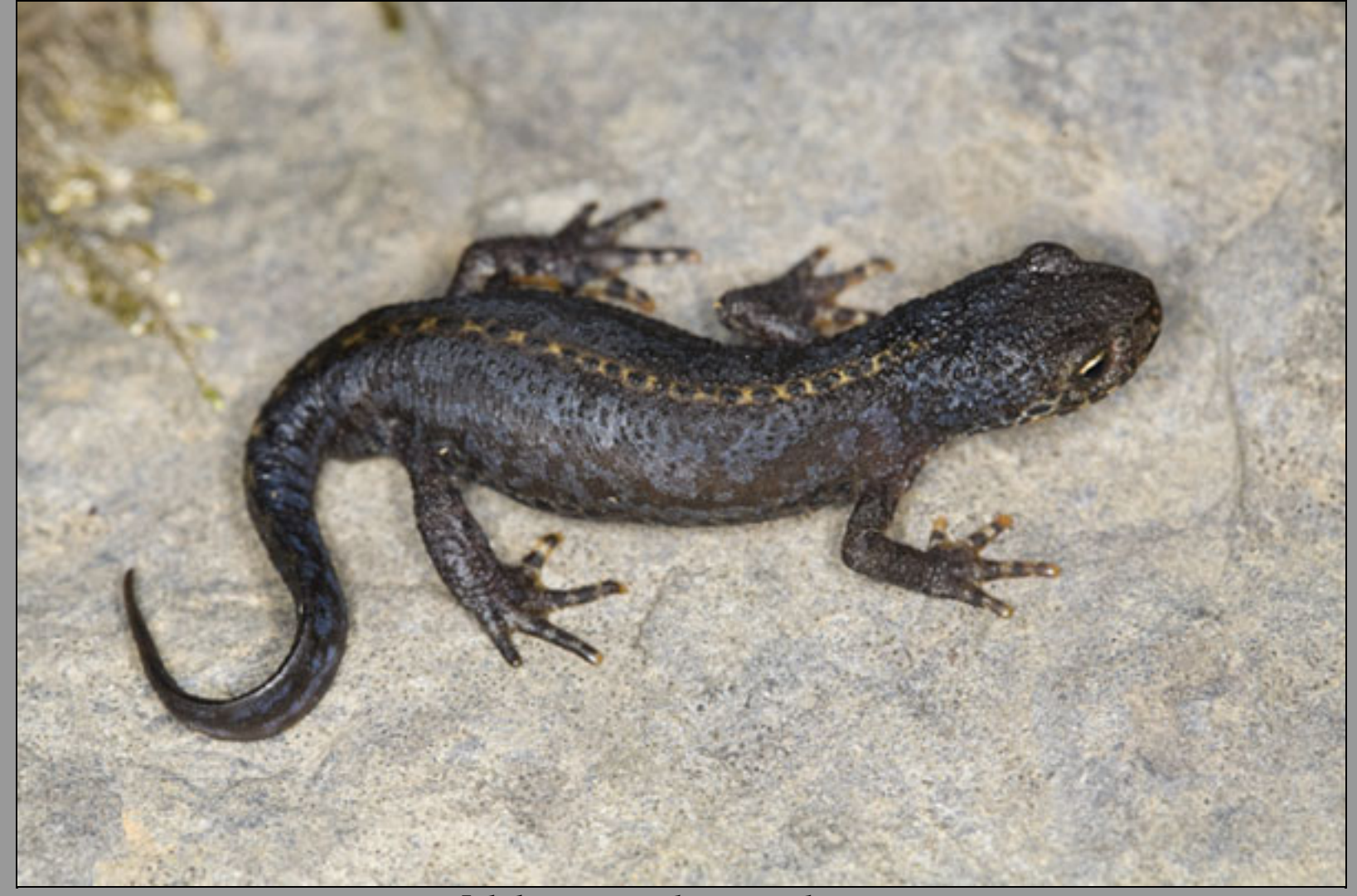
Ichthyosaura alpestris alpestris