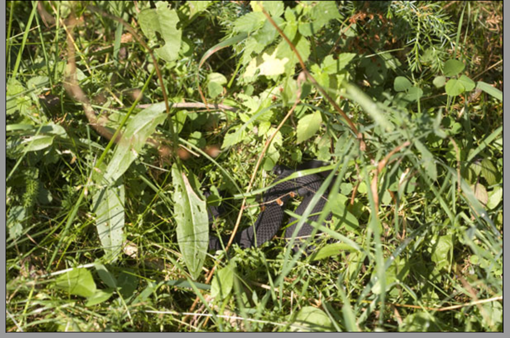
Vipera berus hidden among the vegetation