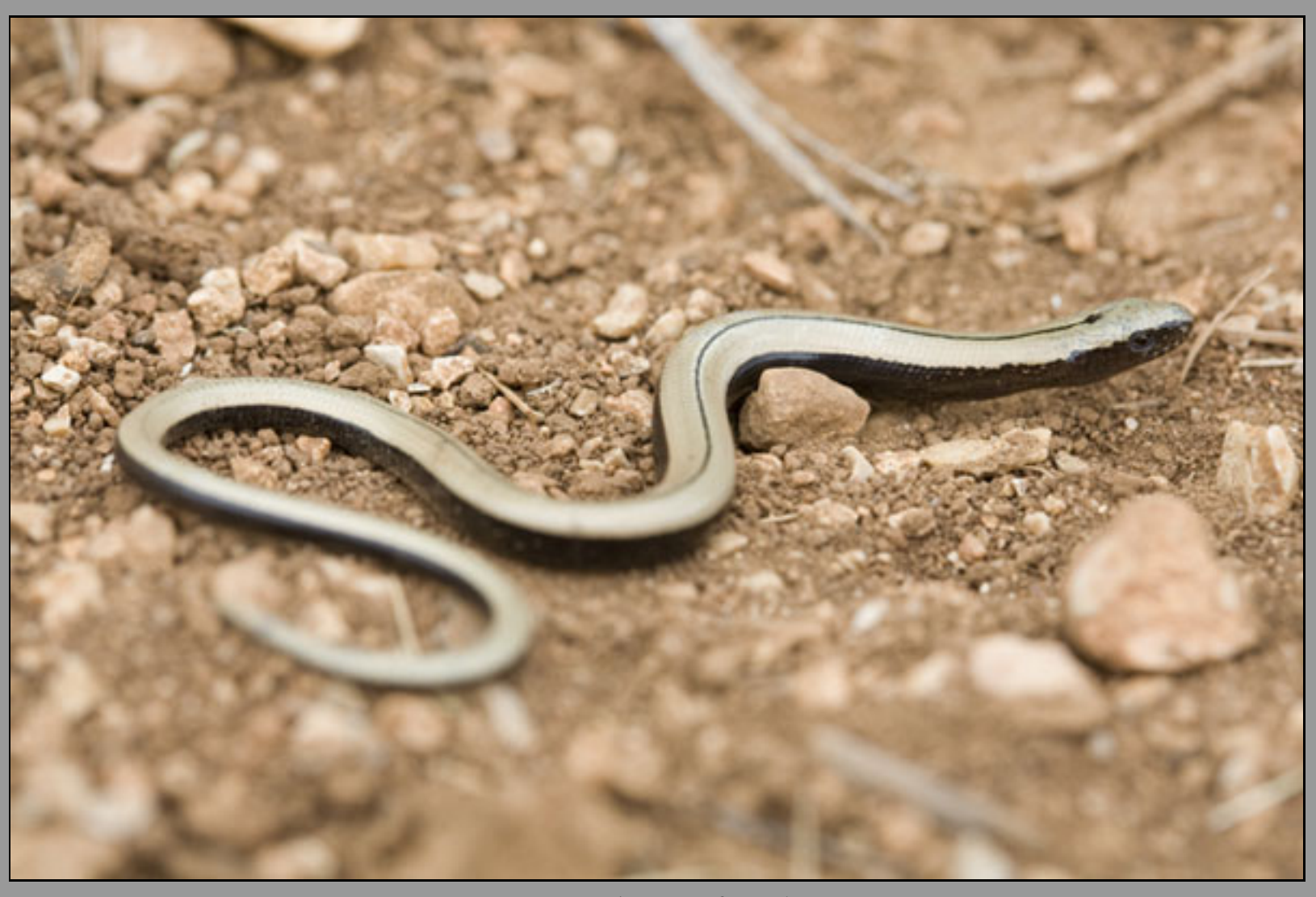
young Anguis fragilis

Then, I drove back towards South East of France. The first reptile was a very young Anguis fragilis near Manosque and one Podarcis muralis , but I was there for Hyles nicaea , a rare Sphingidae, so no more herp. (In the night with a mercury vapor lamp, I catched the latter with Deilephila porcellus , a very big female of Laothoe populi , Marumba quercus and Sphinx maurorum ).