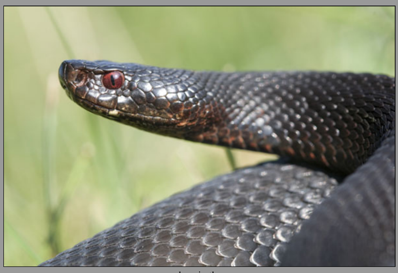
... and again the same

Go back home to Le Havre, end of the trip... but ready for the next!