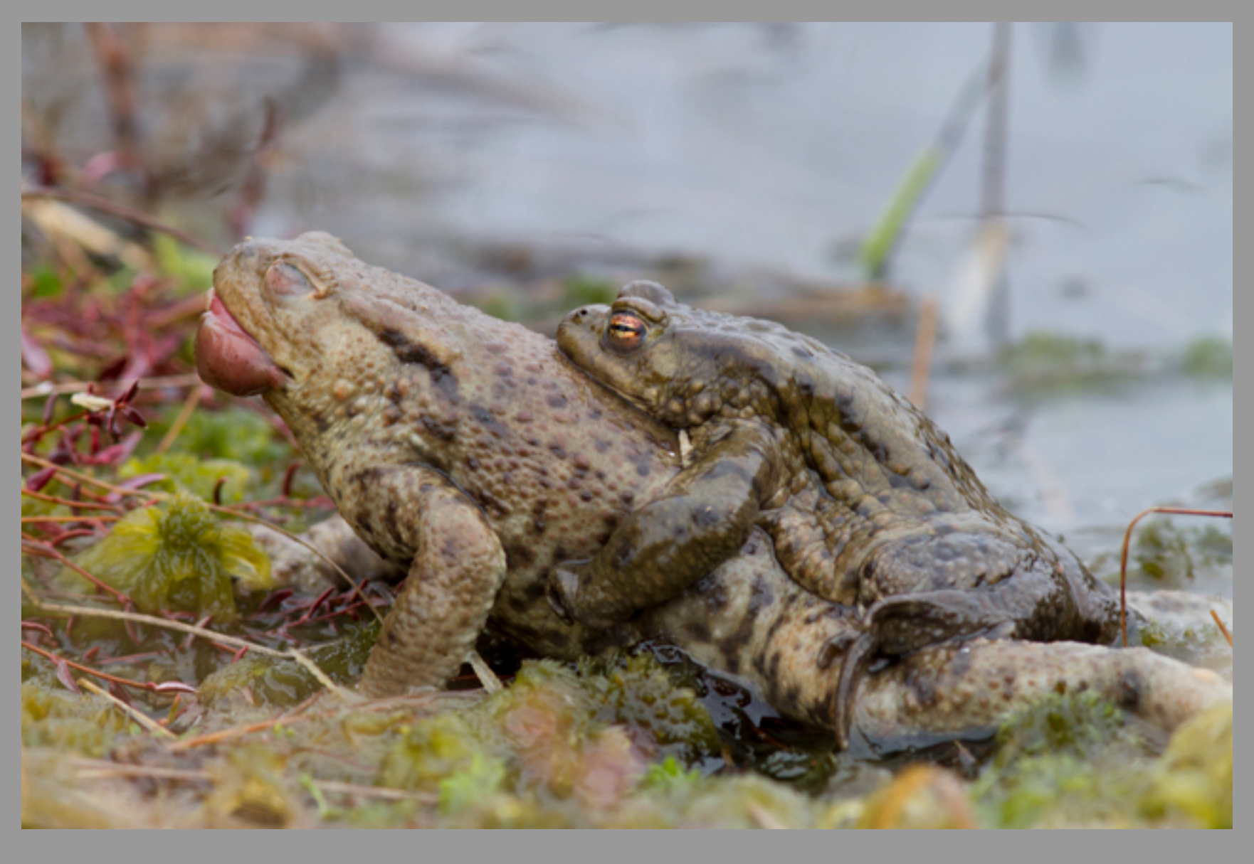
Bufo bufo, amplexus with a dead female...