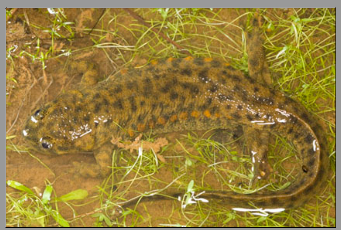
Sharp-ribbed newt (Pleurodeles waltl)