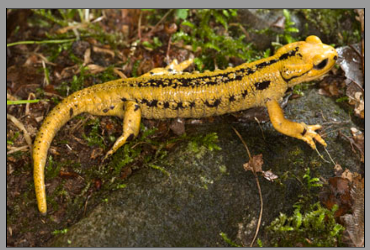
Fire Salamander (Salamandra salamandra fastuosa)