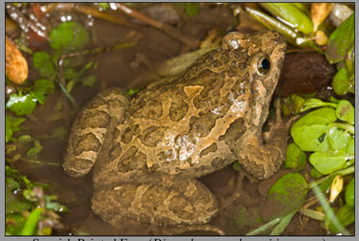
Spanish Painted Frog (Discoglossus galganoi jeanneae)