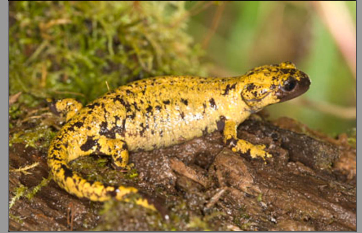
Fire Salamander (Salamandra salamandra bernardezi)