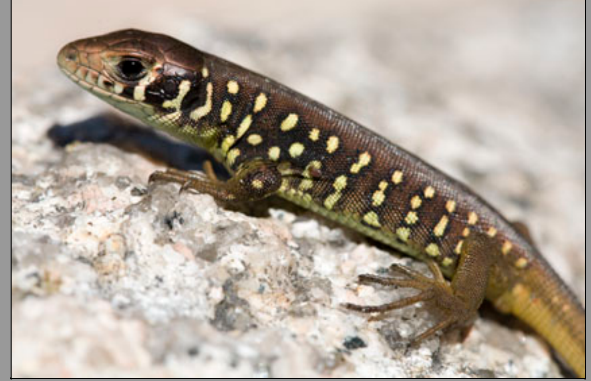
Young Schreiber's Green lizard (Lacerta schreiberi)