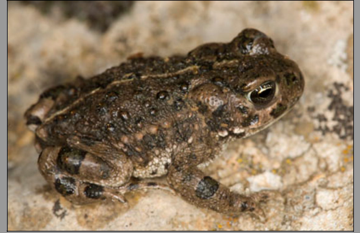
Juvenile Natterjack toad (Bufo calamita)

Whilst traveling back up from the south, I took the chance to return to the north back to the, Salamandra s. alfredschmidti sites. It turned out to be well worth it as I found tens of specimens in ideal conditions, rain. Here are some shots of the variability or the sub-species: