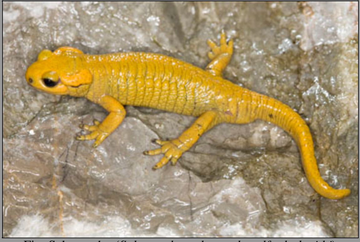
Fire Salamander (Salamandra salamandra alfredschmidti)