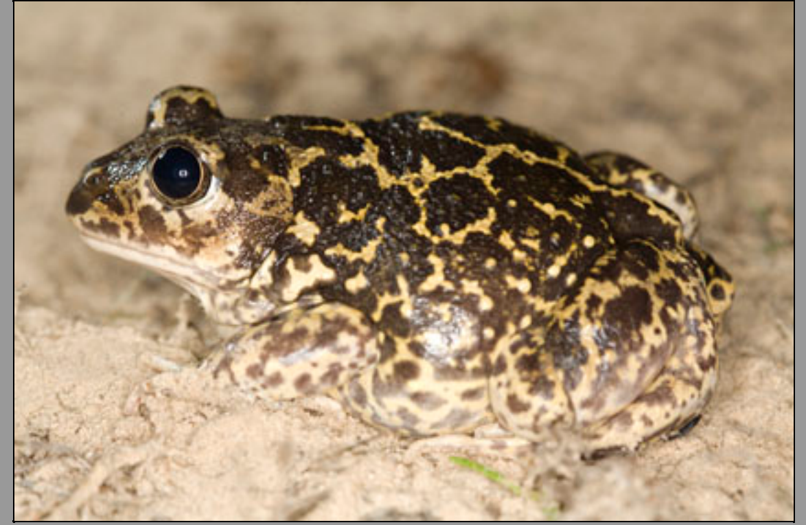
a large Western Spadefoot toad (Pelobates cultripes)