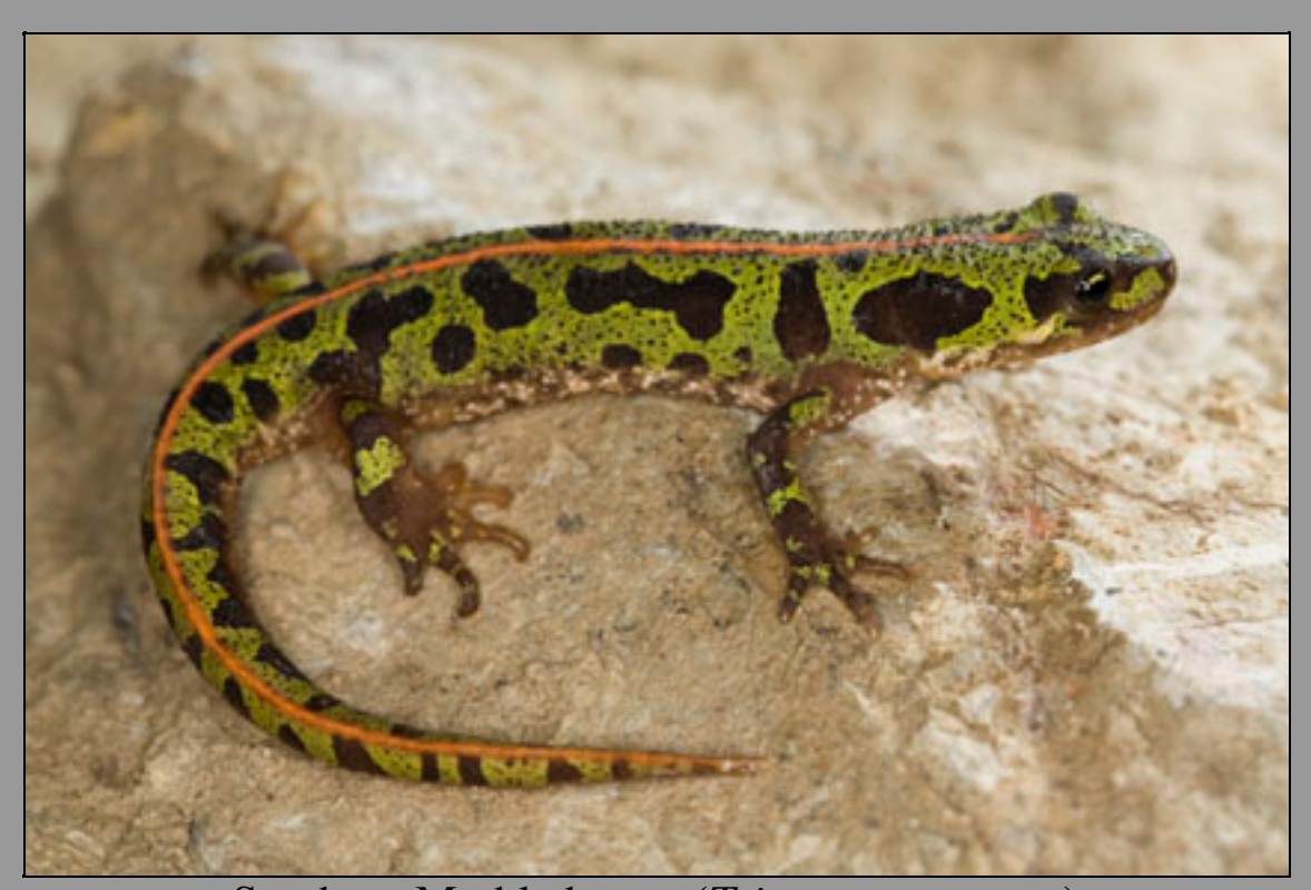
Southern Marbled newt (Triturus pygmaeus)