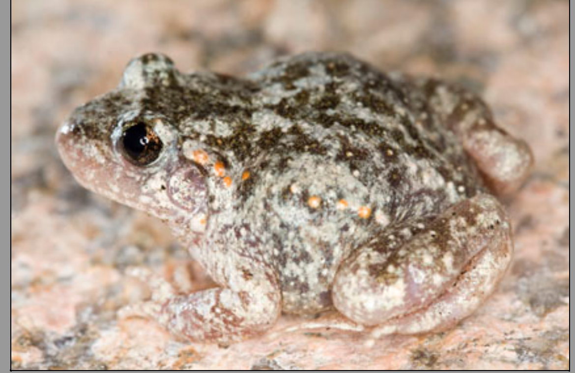
Common midwife toad (Alytes obstetricans boscai)