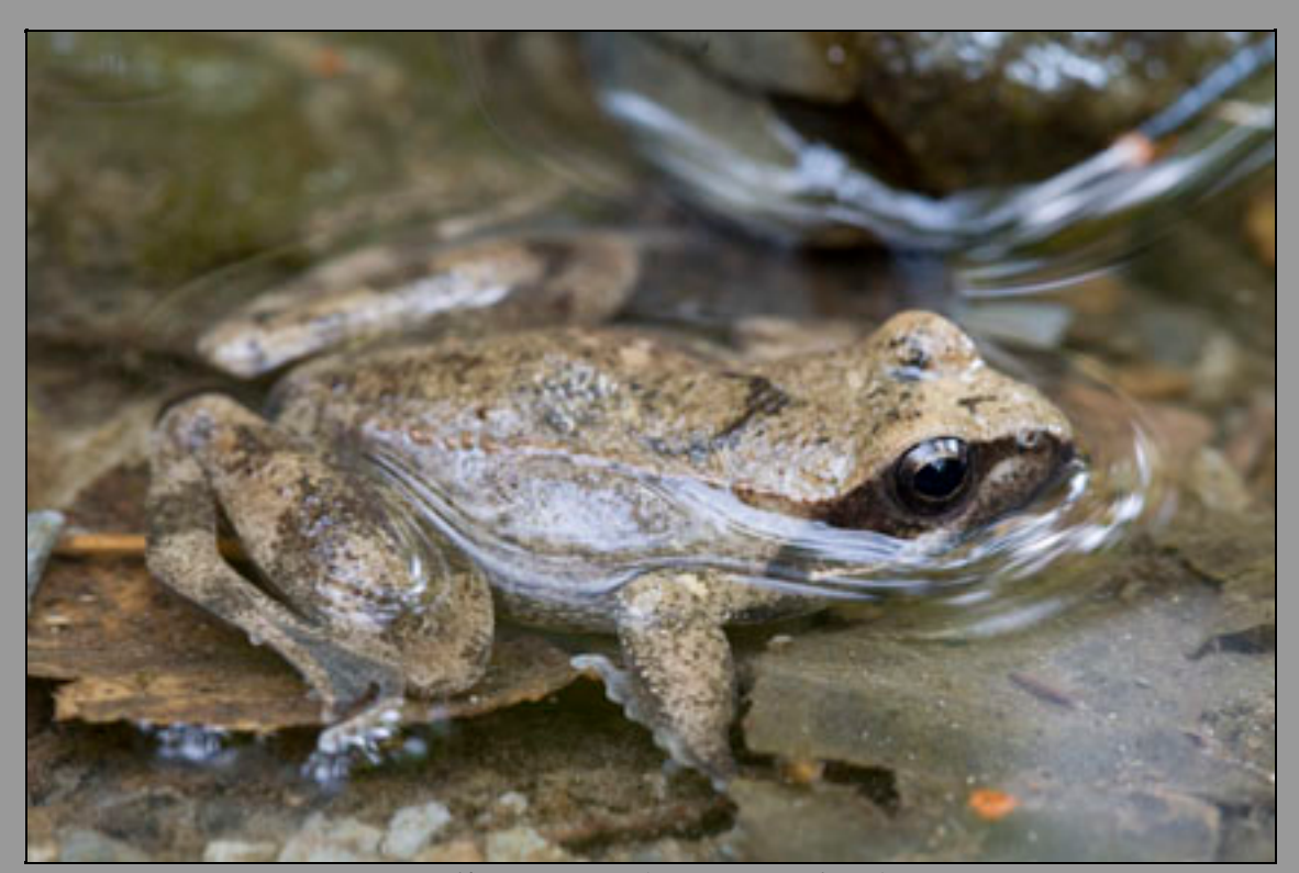
Italian Frog (Rana italica)