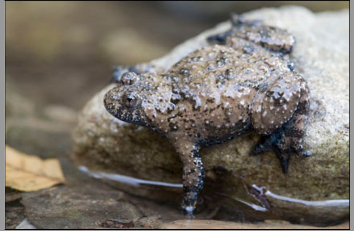
Appenine Yellow-bellied Toad (Bombina variegata pachypus)