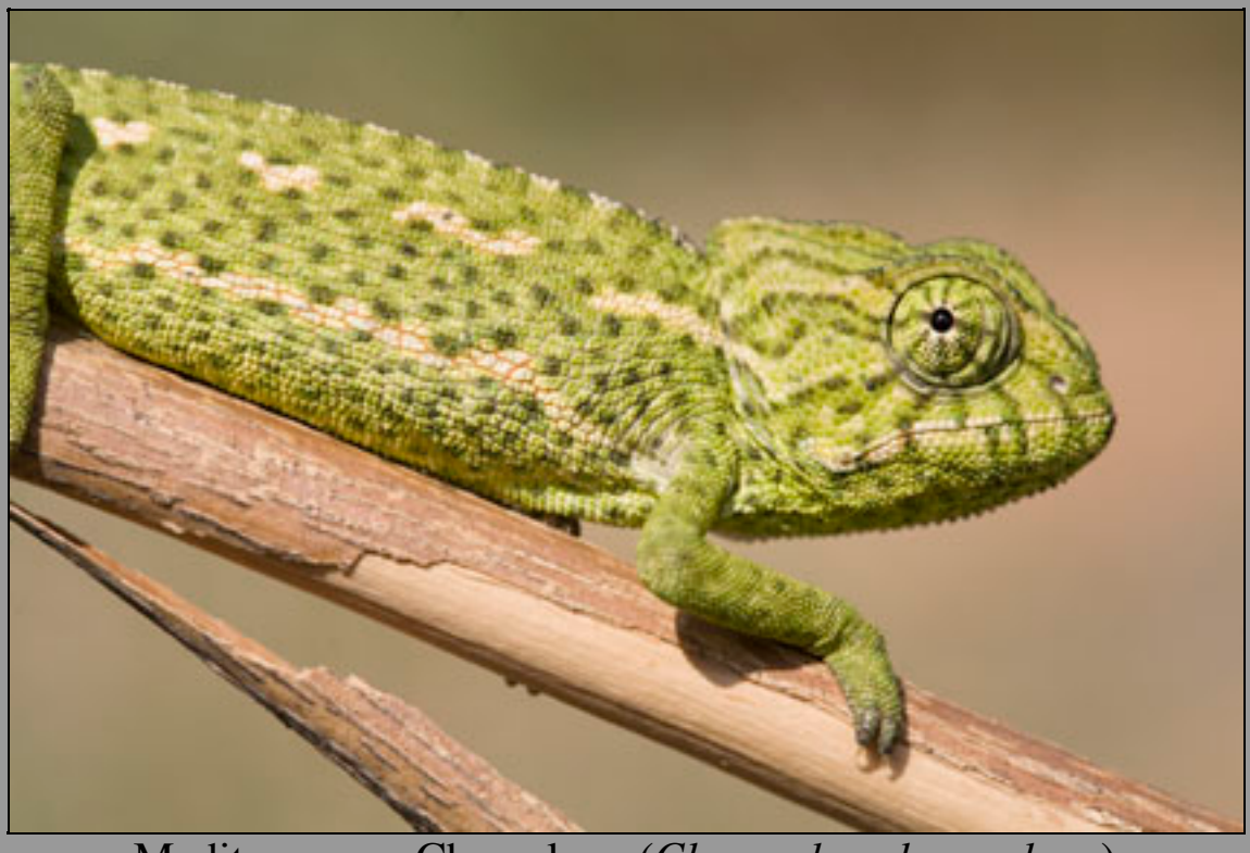
Mediterranean Chameleon (Chamaeleo chamaeleon)