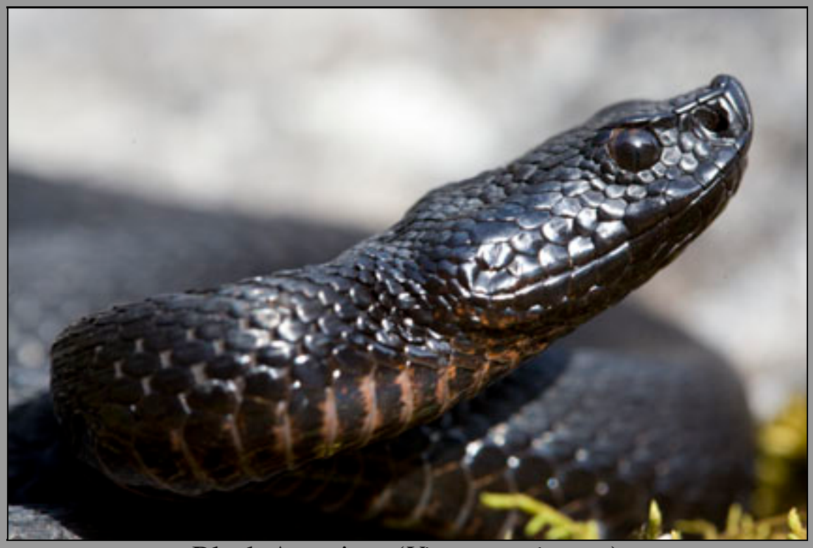
Black Asp viper (Vipera aspis atra)