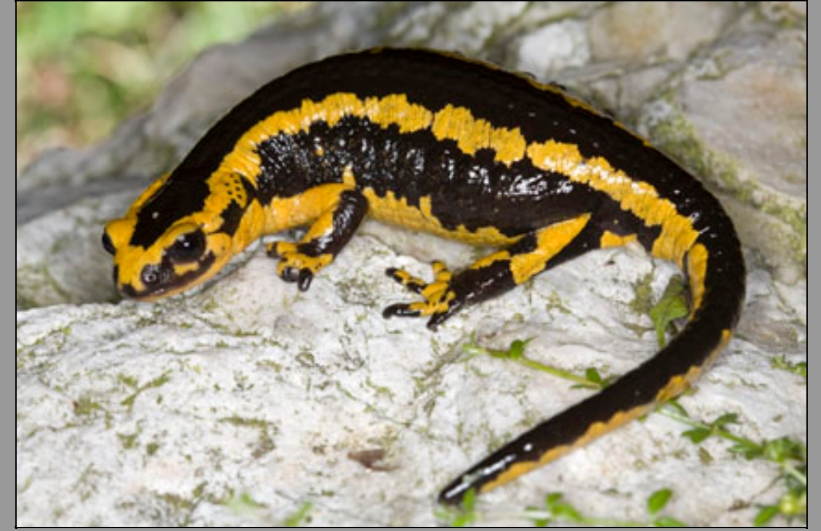
Fire Salamander (Salamandra salamandra bernardezi)