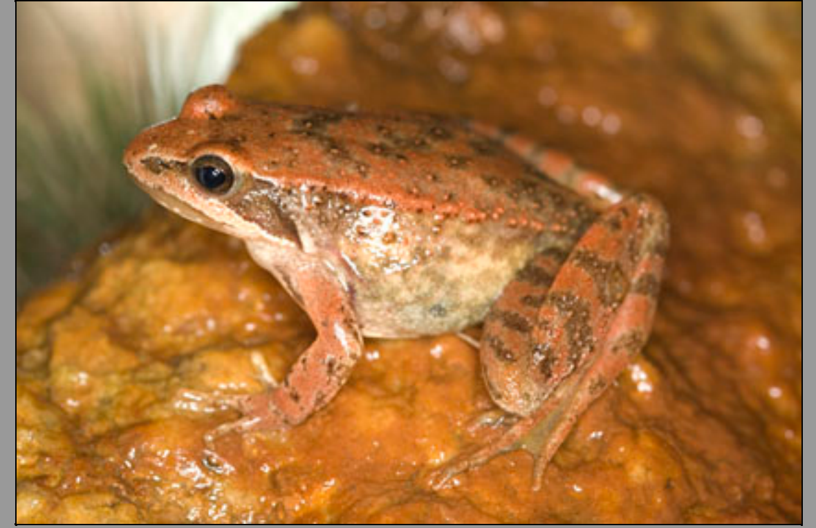
Iberian frog (Rana iberica)