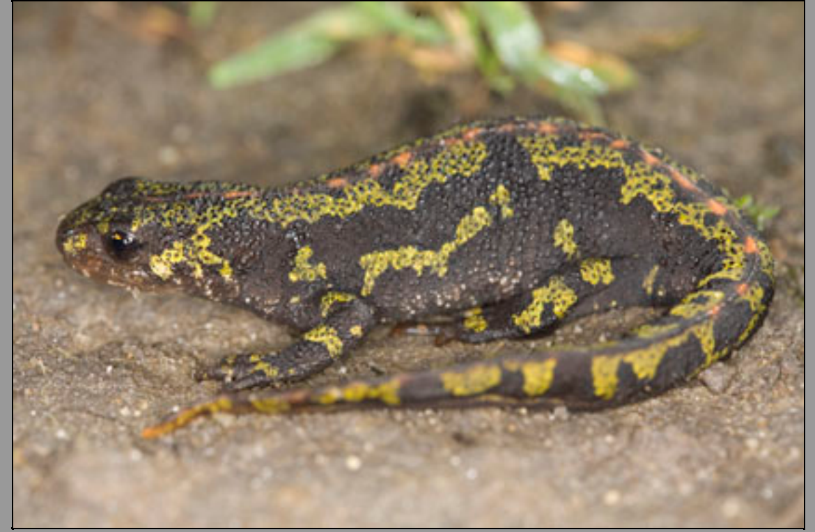
Marbled newt (Triturus marmoratus)