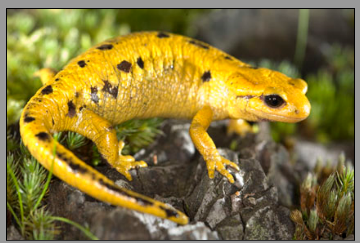
Fire Salamander (Salamandra salamandra bernardezi)