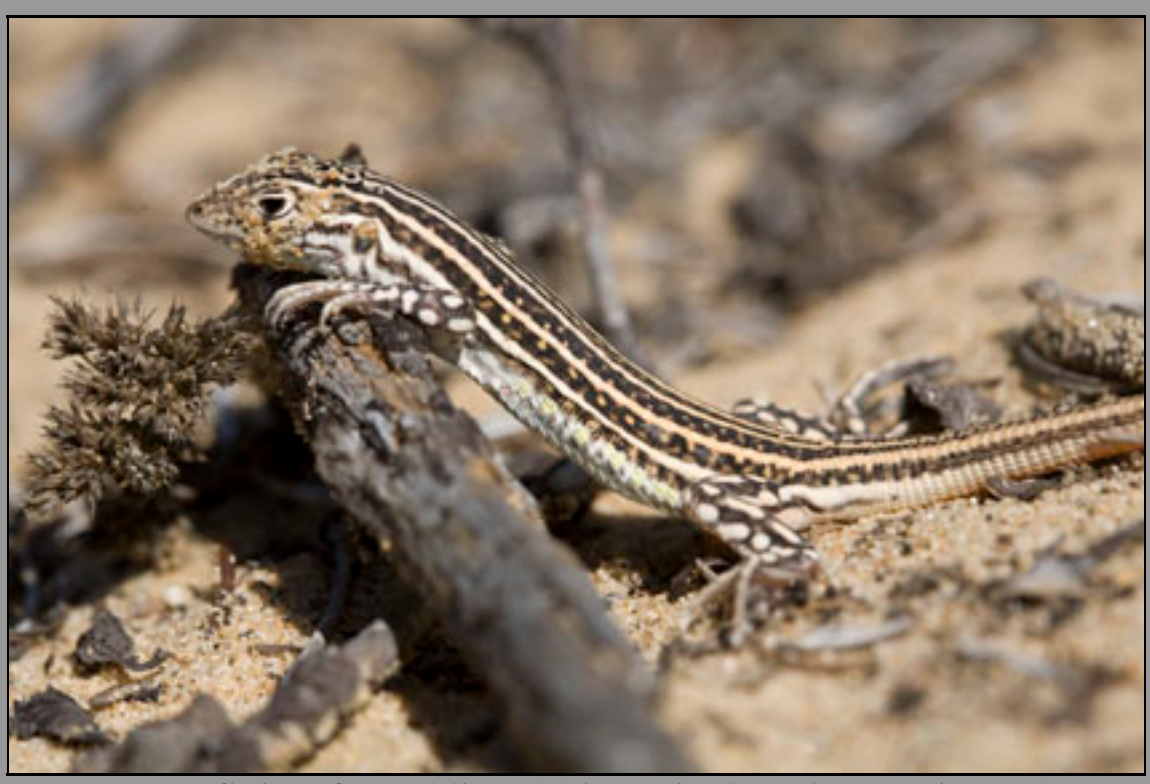
Young Spiny-footed lizard (Acanthodactylus erythrurus)

I returned to a site where three years ago I found Mediterranean Chameleon ( Chamaeleo chamaeleon ), and after half a day of searching, I found 2, quite small and similar in colour. I also looked for Lataste's viper ( Vipera latastei gaditana ) in the costal dunes for 2 days, with good weather conditions, but no luck.