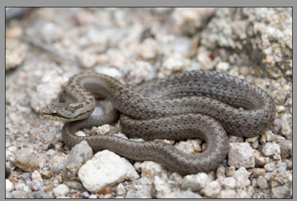
Smooth snake (Coronella austriaca acutirostris)