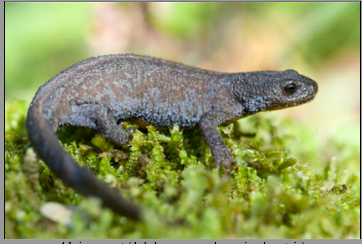
Alpine newt (Ichthyosaura alpestris alpestris)