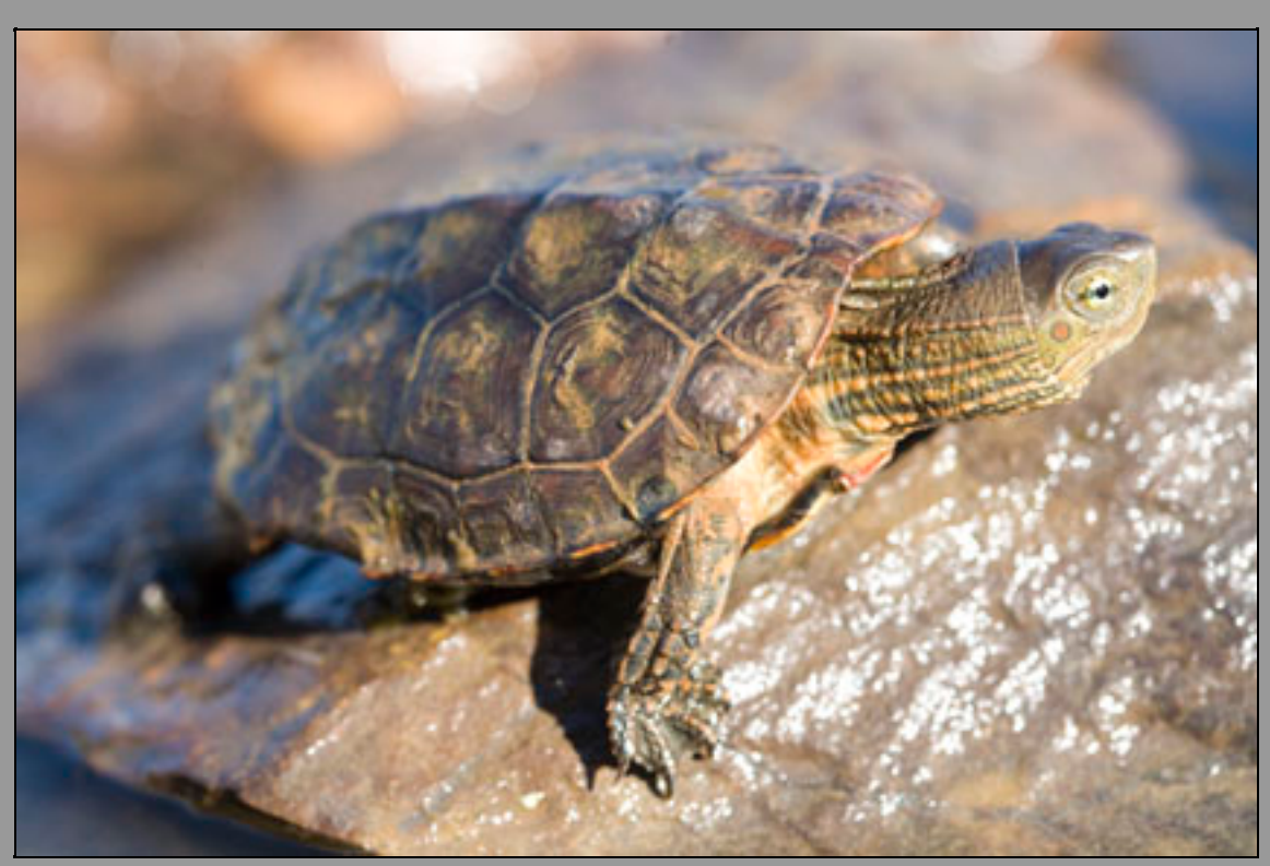
Spanish terrapin (Mauremys leprosa)