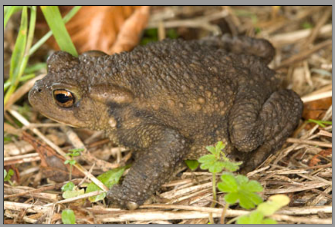
Common toad (Bufo spinosus)