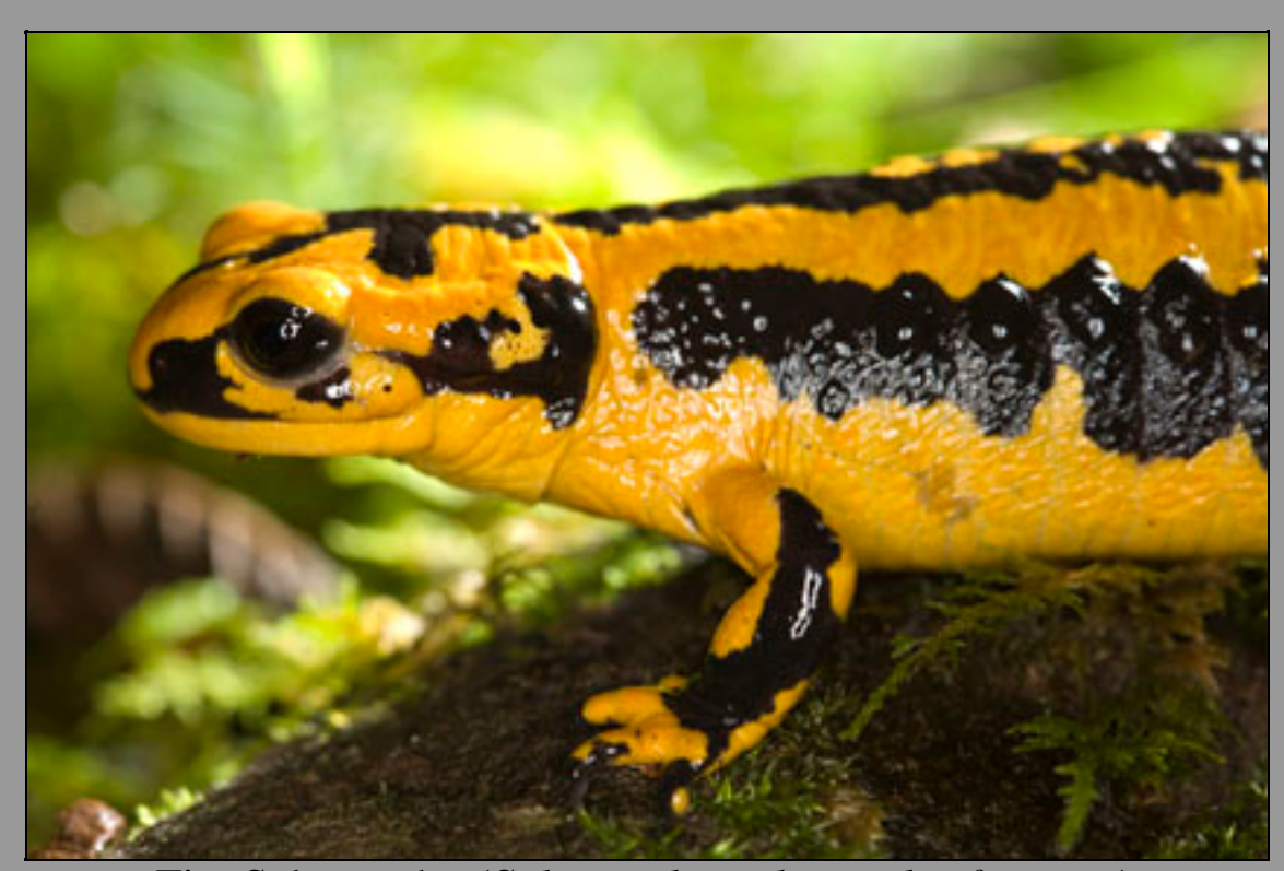
Fire Salamander (Salamandra salamandra fastuosa)