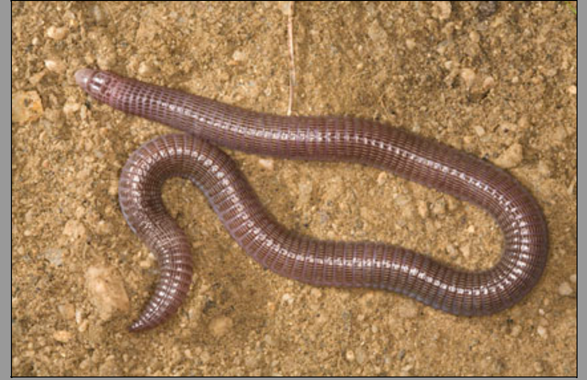
Iberian Worm lizard (Blanus cinereus)