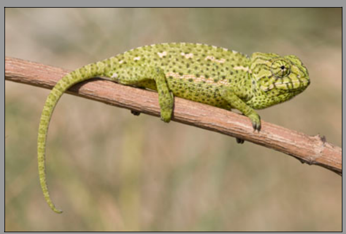
Mediterranean Chameleon (Chamaeleo chamaeleon)