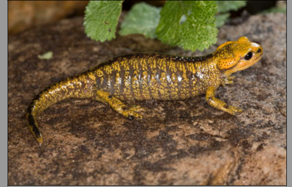
Fire Salamander (Salamandra salamandra alfredschmidti)