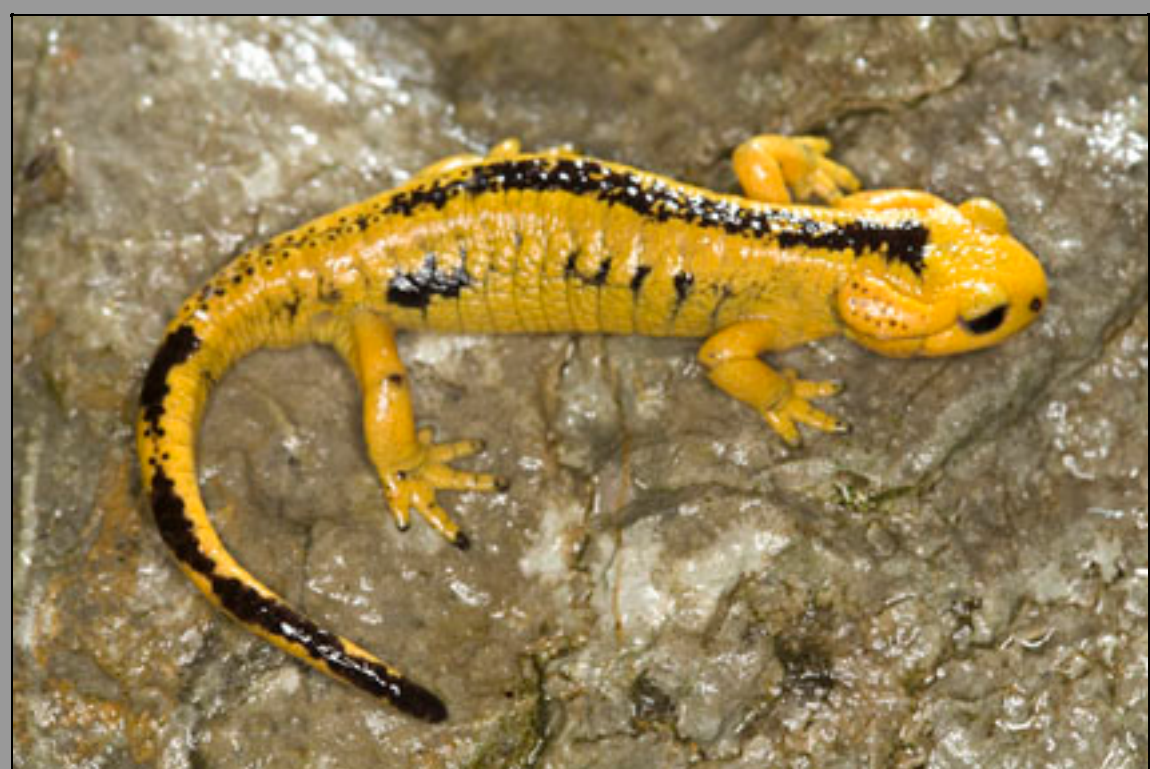
Fire Salamander (Salamandra salamandra alfredschmidti)