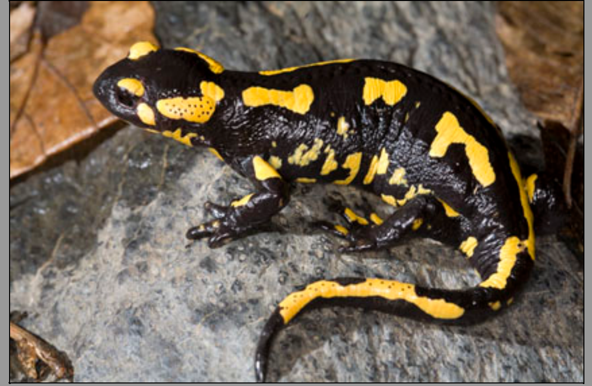
Fire Salamander (Salamandra salamandra terrestris)

Quite drive by the lagune de Gallocanta with a few specimens found mostly under stones (especially juveniles):