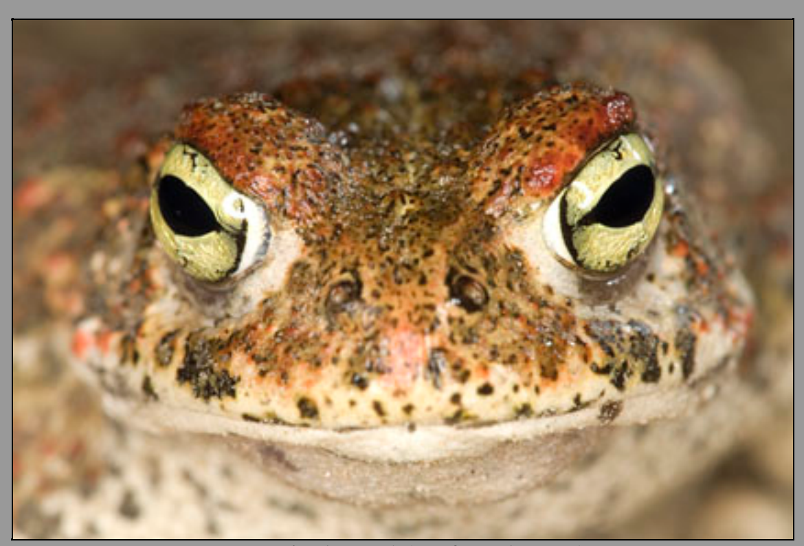
Natterjack toad (Bufo calamita)