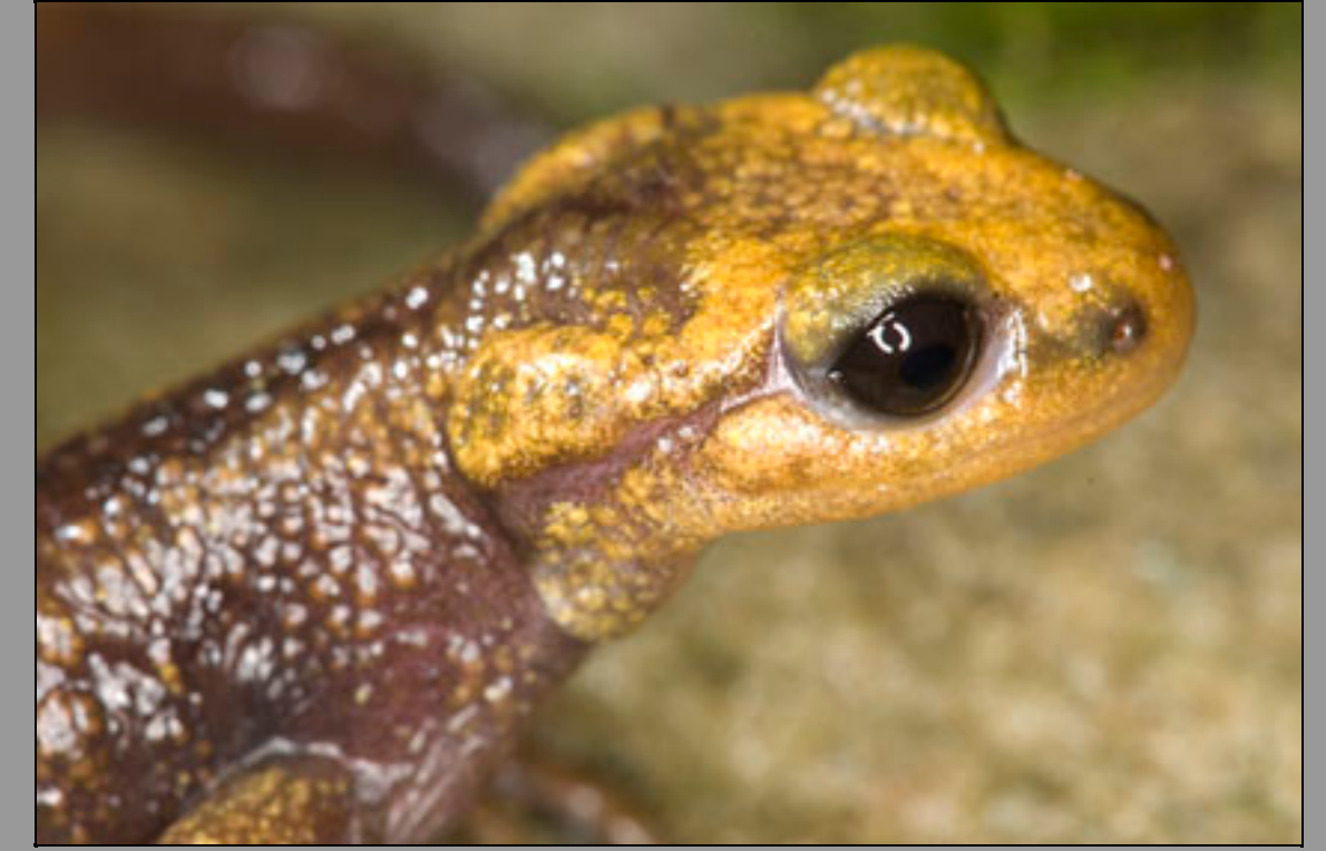
Fire Salamander (Salamandra salamandra alfredschmidti)