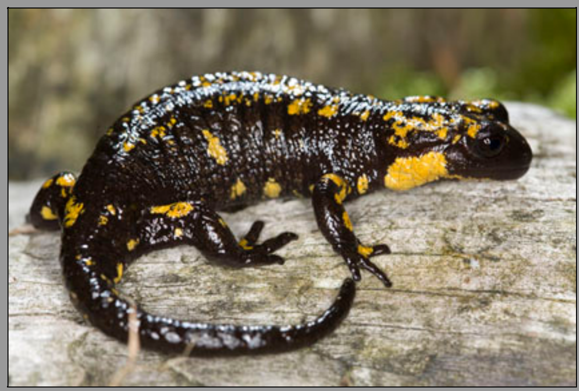
Fire Salamander (Salamandra salamandra bernardezi)