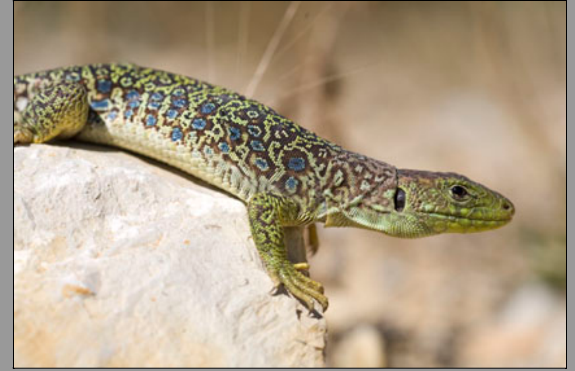
Ocellated lizard (Timon lepidus)

Northern Spain (Asturias, Cantabria...) is favourable for many sub-species of Fire Salamander, and even in some parts, the interaction of 2 different sub-species. It's possible to see atypical forms within a same population, like these ssp. fastuosa photos.