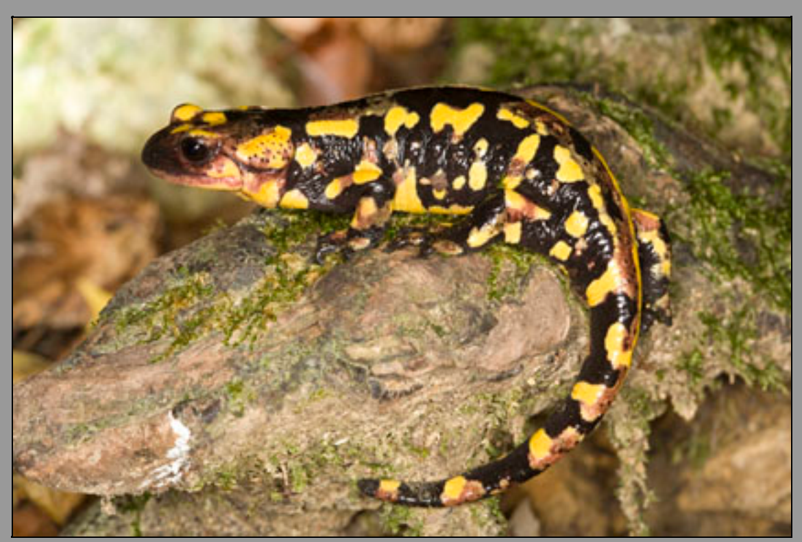
Fire Salamander (Salamandra salamandra fastuosa x bejarae)