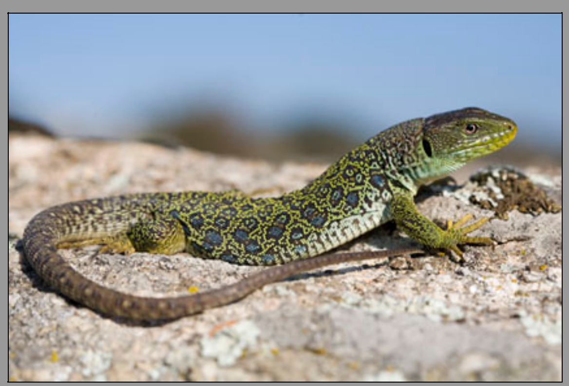
Ocellated lizard (Timon lepidus)