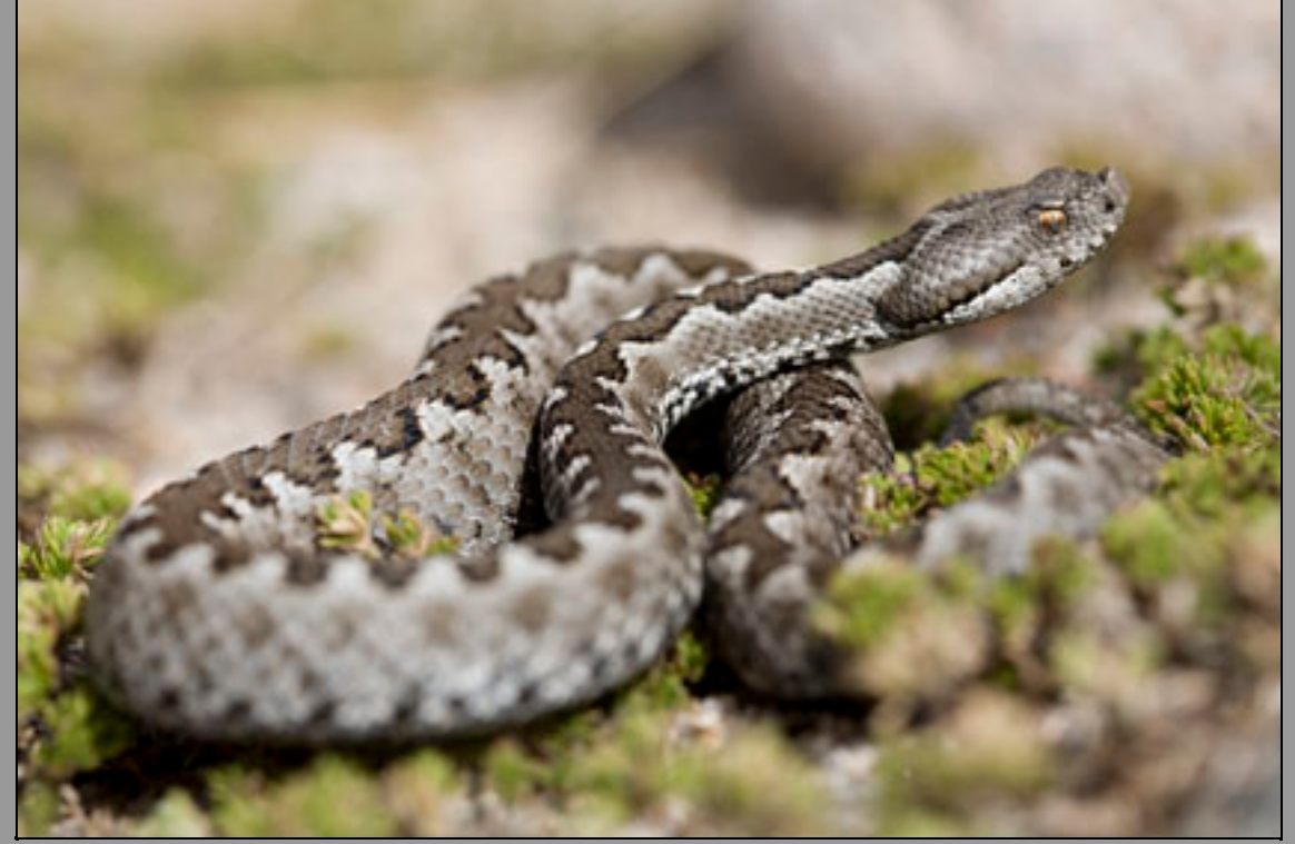
Lataste's viper (Vipera latastei latastei)