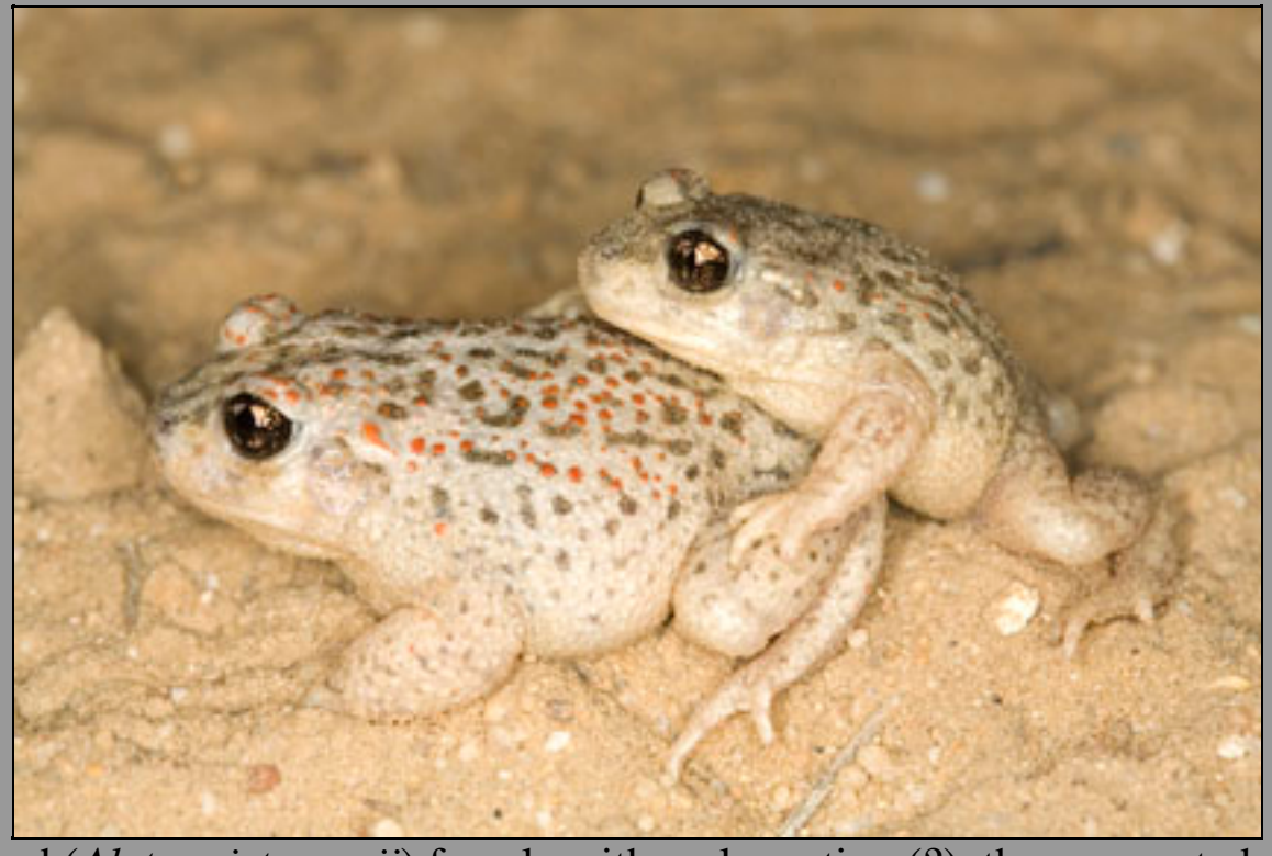
Iberian Midwife toad ( Alytes cisternasii ) female with male mating (?), they separated when I shinned the light on them...