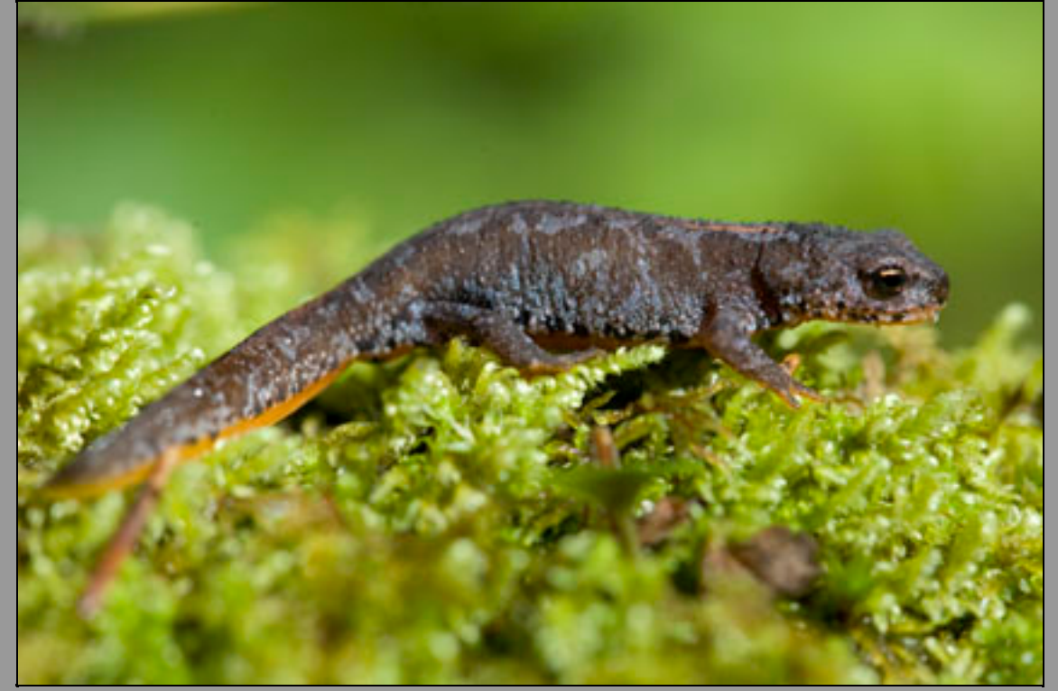
Alpine newt (Ichthyosaura alpestris alpestris)