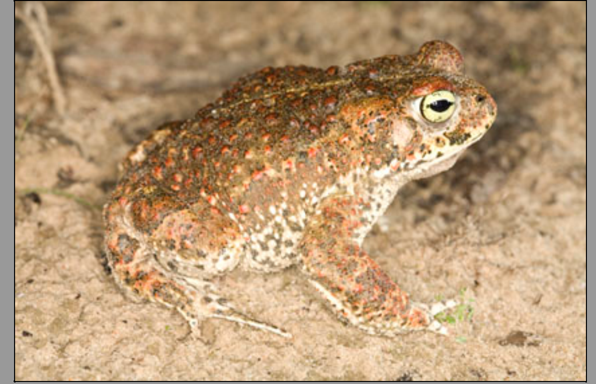
Natterjack toad (Bufo calamita)