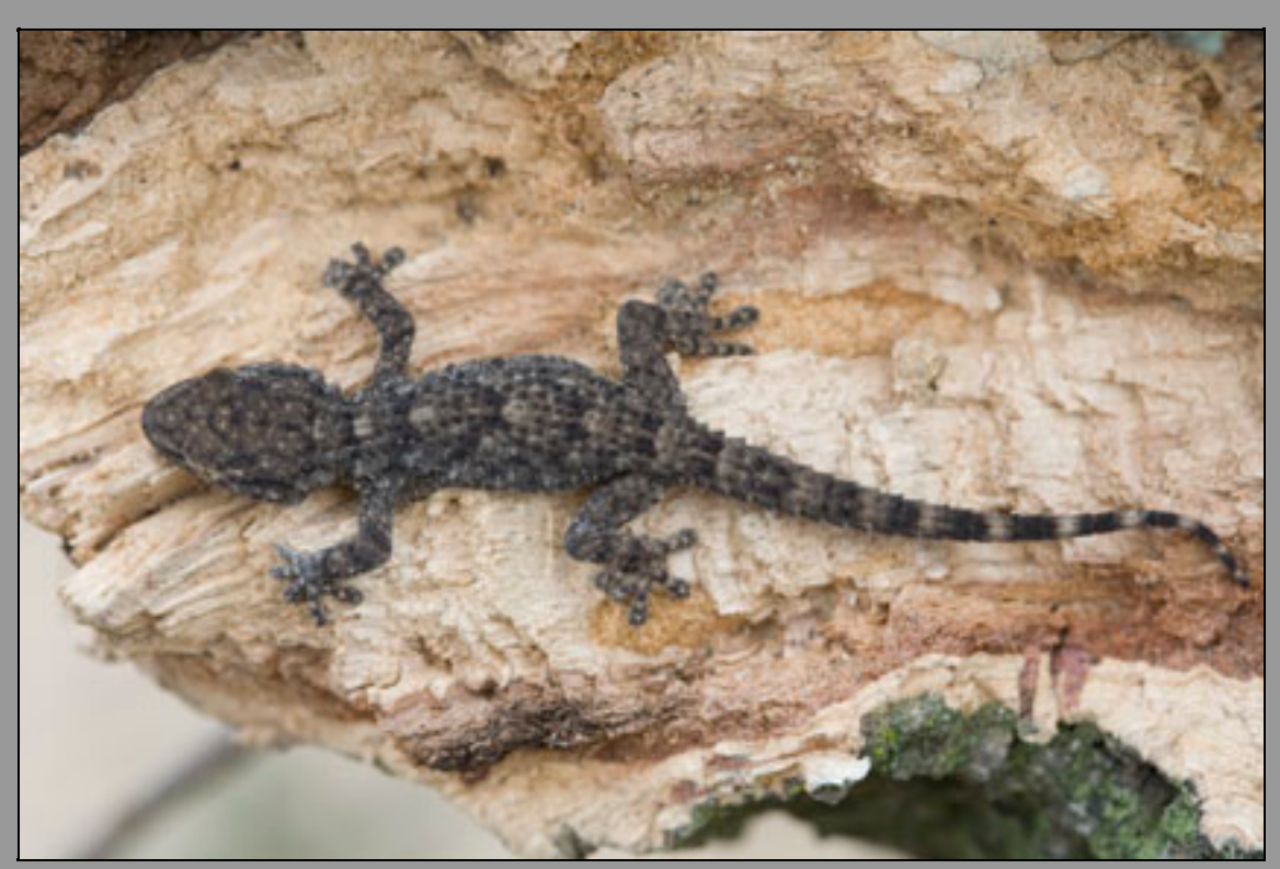
Moorish Gecko (Tarentola mauritanica)