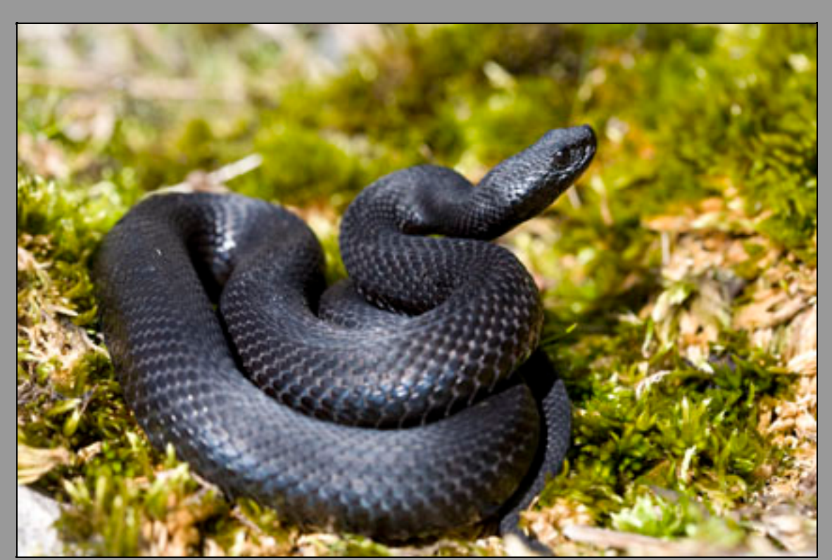
Black Asp viper (Vipera aspis atra)

(Anguis fragilis) in the same area. After I searched during day and night the Alpine Salamander (Salamandra atra) in a well know sector for them but it seems that the season was too late for them. However Alpine newts ( Ichthyosaura alpestris alpestris ) were very much present.