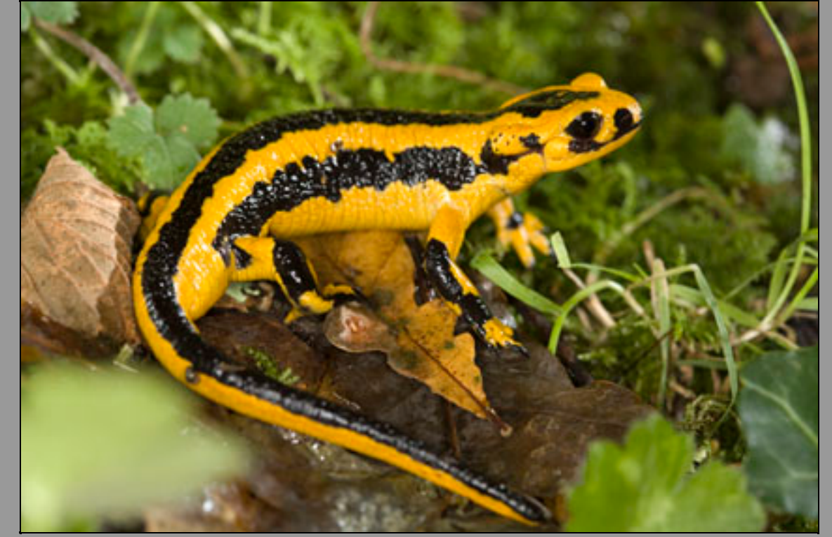
Fire Salamander (Salamandra salamandra fastuosa)