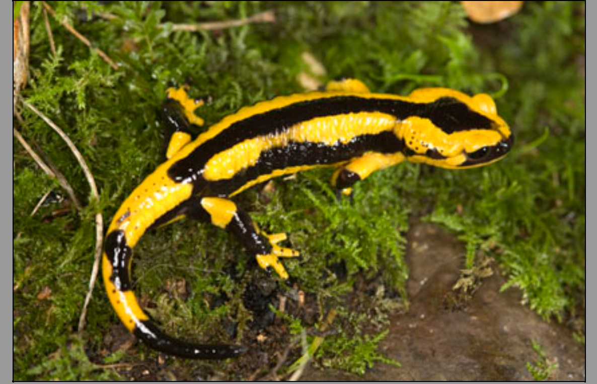
Fire Salamander (Salamandra salamandra fastuosa)