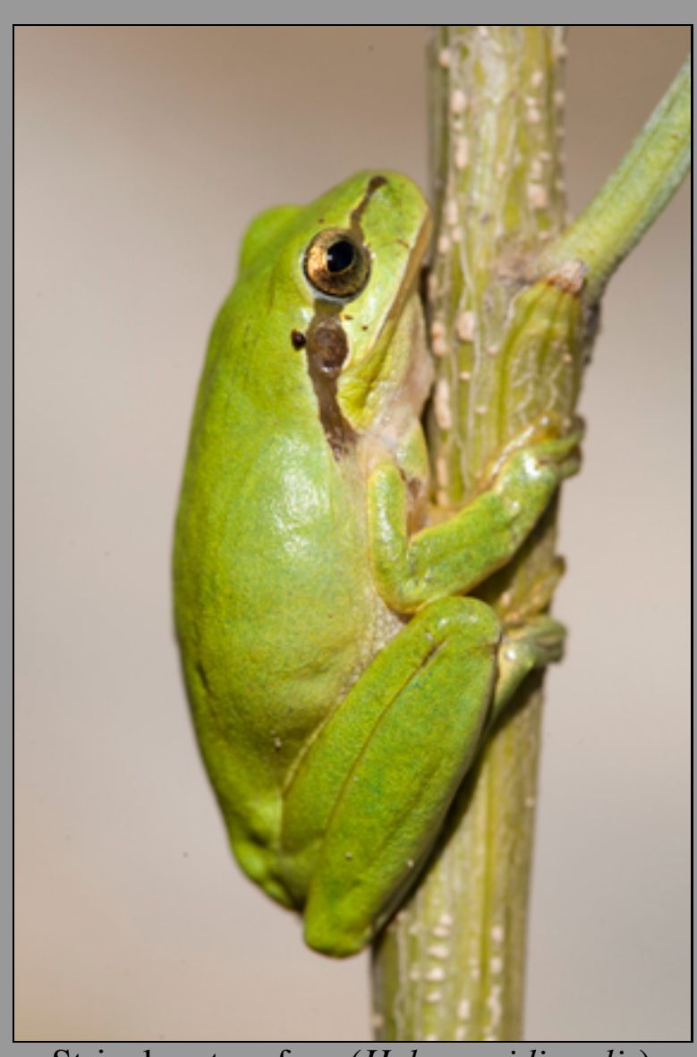
Stripeless tree frog ( Hyla meridionalis )