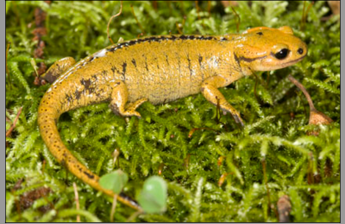
Fire Salamander (Salamandra salamandra alfredschmidti)