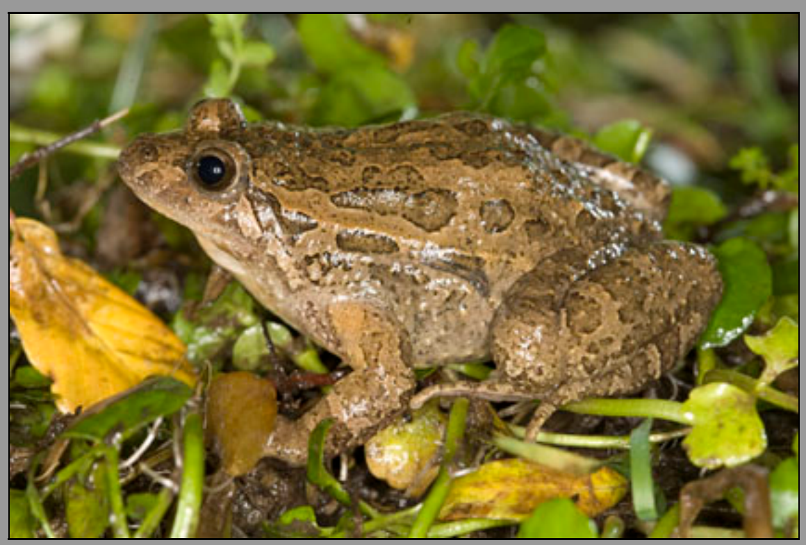
Spanish Painted Frog (Discoglossus galganoi jeanneae)

I was only to see one Ocellated lizard (Timon lepidus), here, a wonderful female.