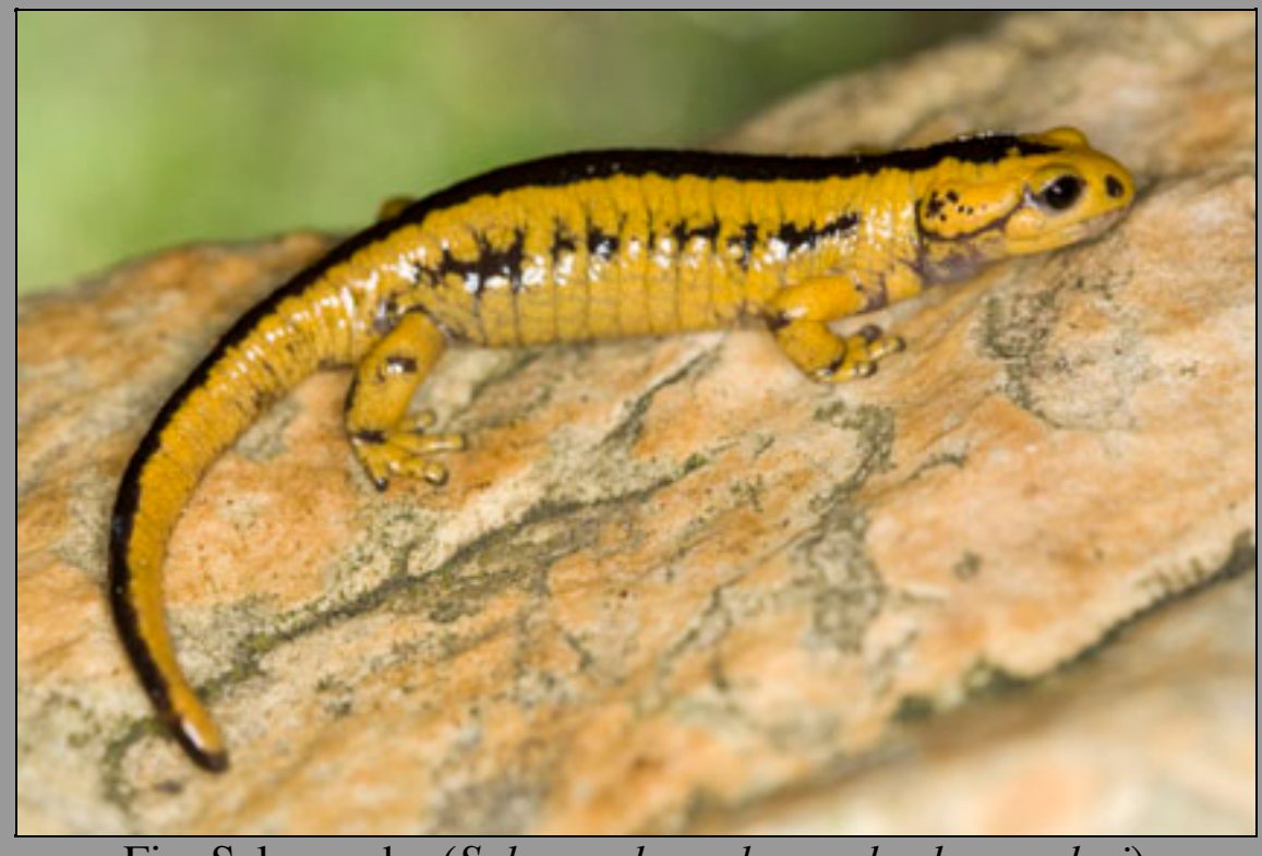
Fire Salamander (Salamandra salamandra bernardezi)