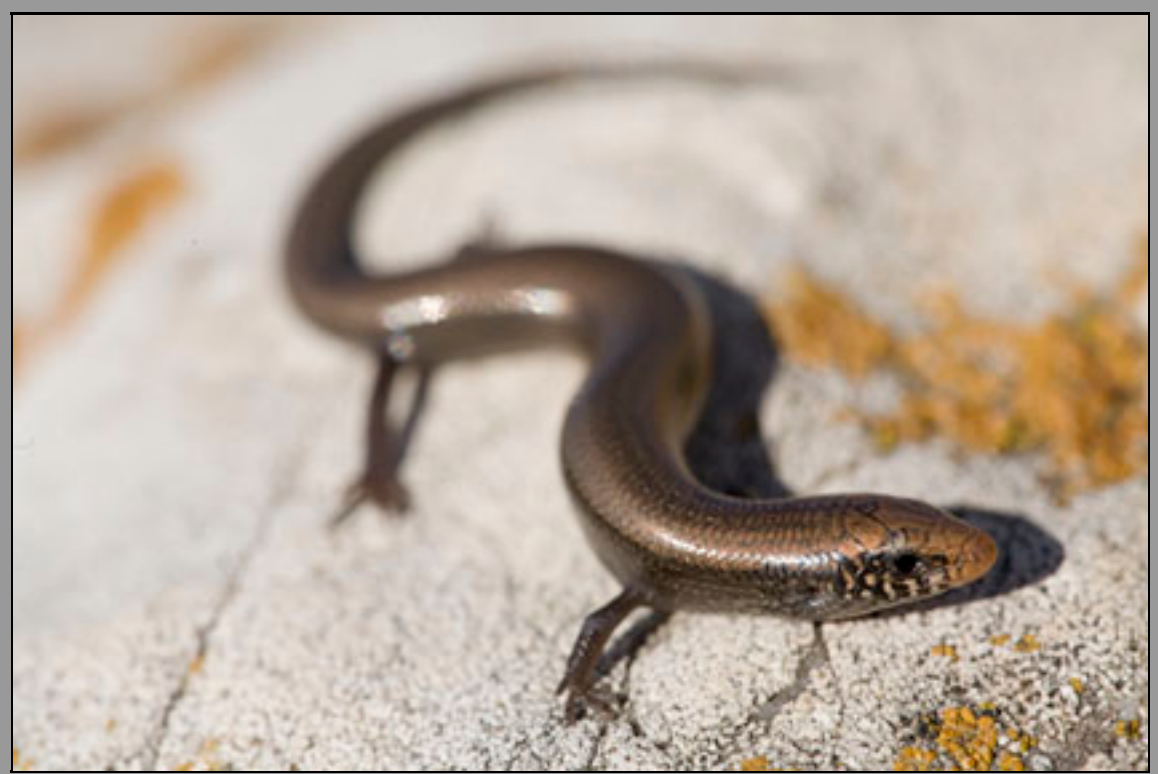
A young Bedriaga's Skink (Chalcides bedriagae bedriagae)

Quite drive by the lagune de Gallocanta with a few specimens found mostly under stones (especially juveniles):