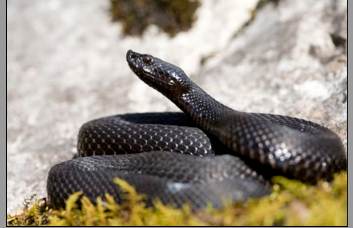
Black Asp viper (Vipera aspis atra)