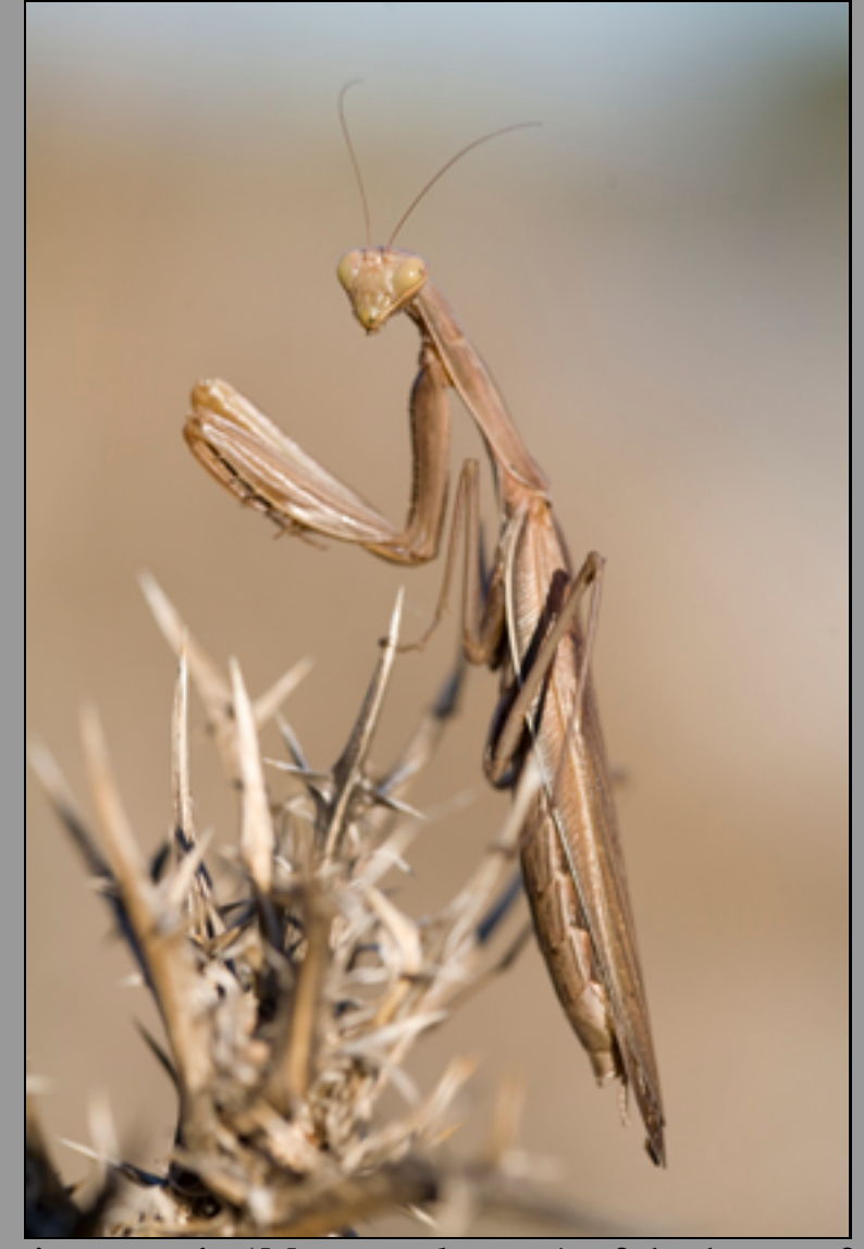
Praying mantis (Mantis religiosa) of the brown form