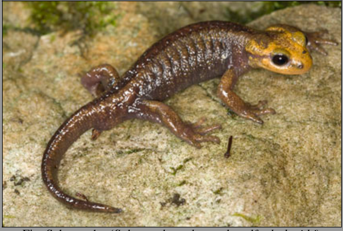
Fire Salamander (Salamandra salamandra alfredschmidti)