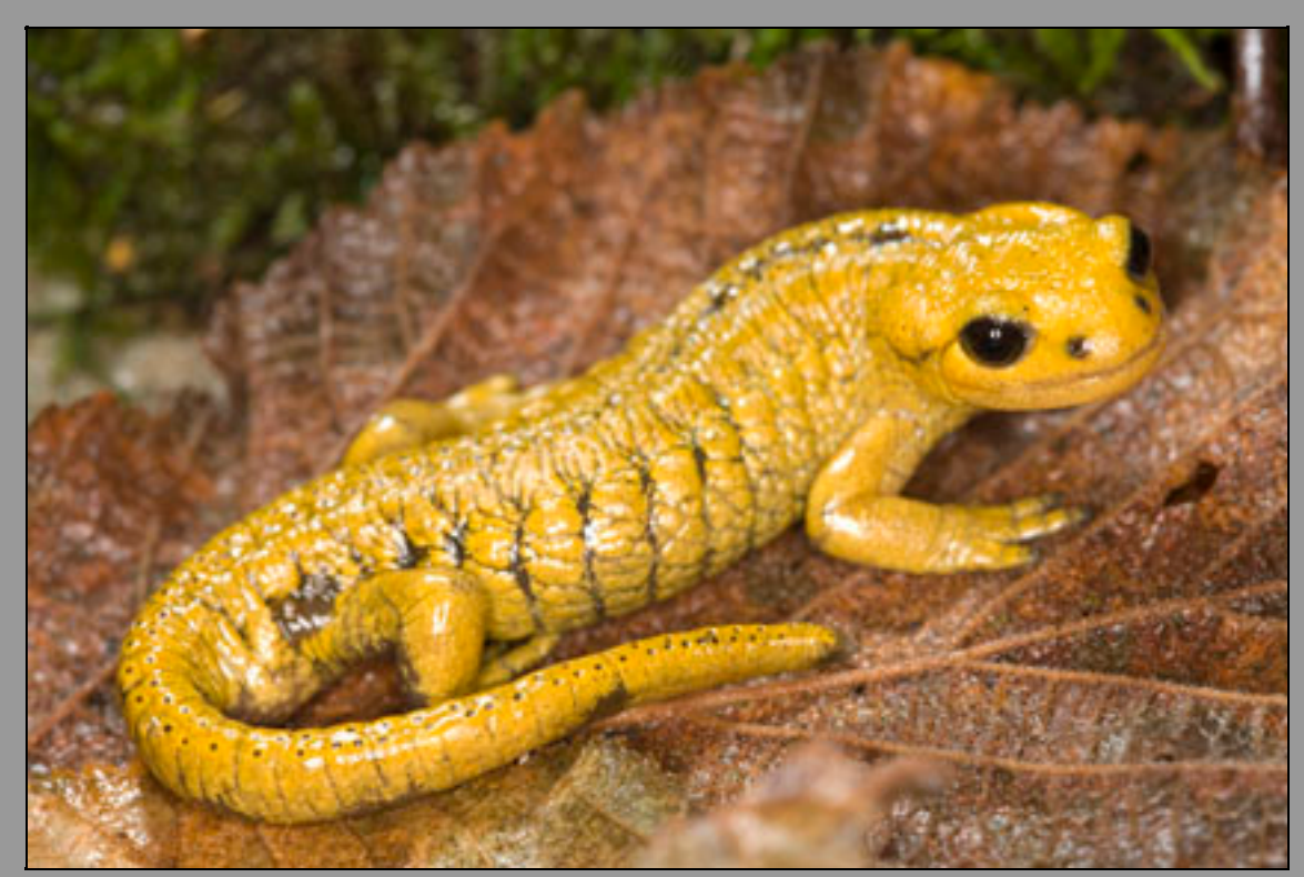
Fire Salamander (Salamandra salamandra alfredschmidti)