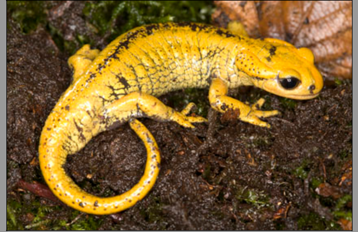
Fire Salamander (Salamandra salamandra alfredschmidti)