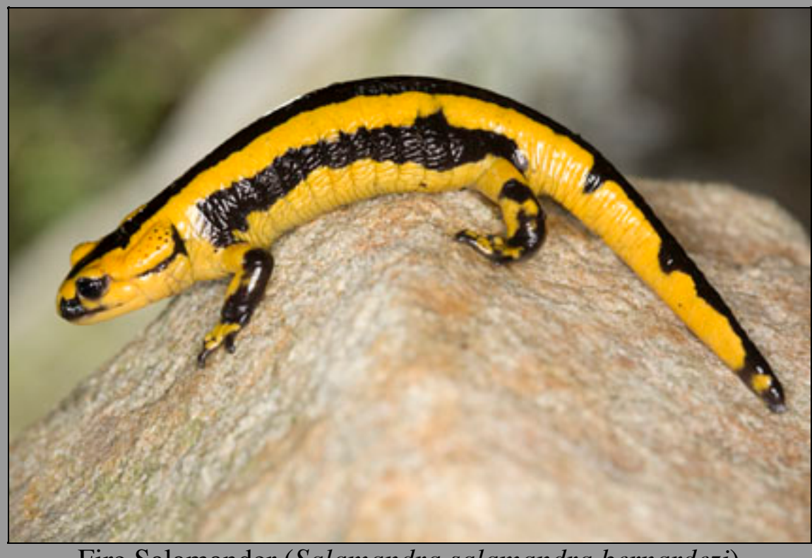
Fire Salamander (Salamandra salamandra bernardezi)