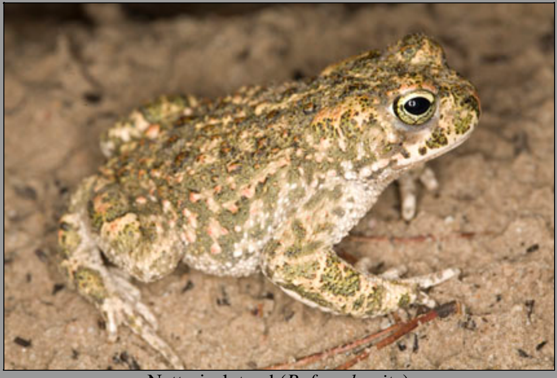
Natterjack toad (Bufo calamita)