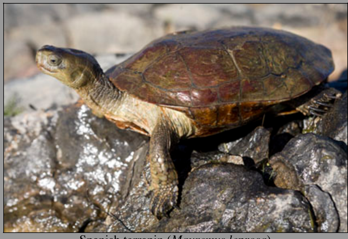
Spanish terrapin (Mauremys leprosa)