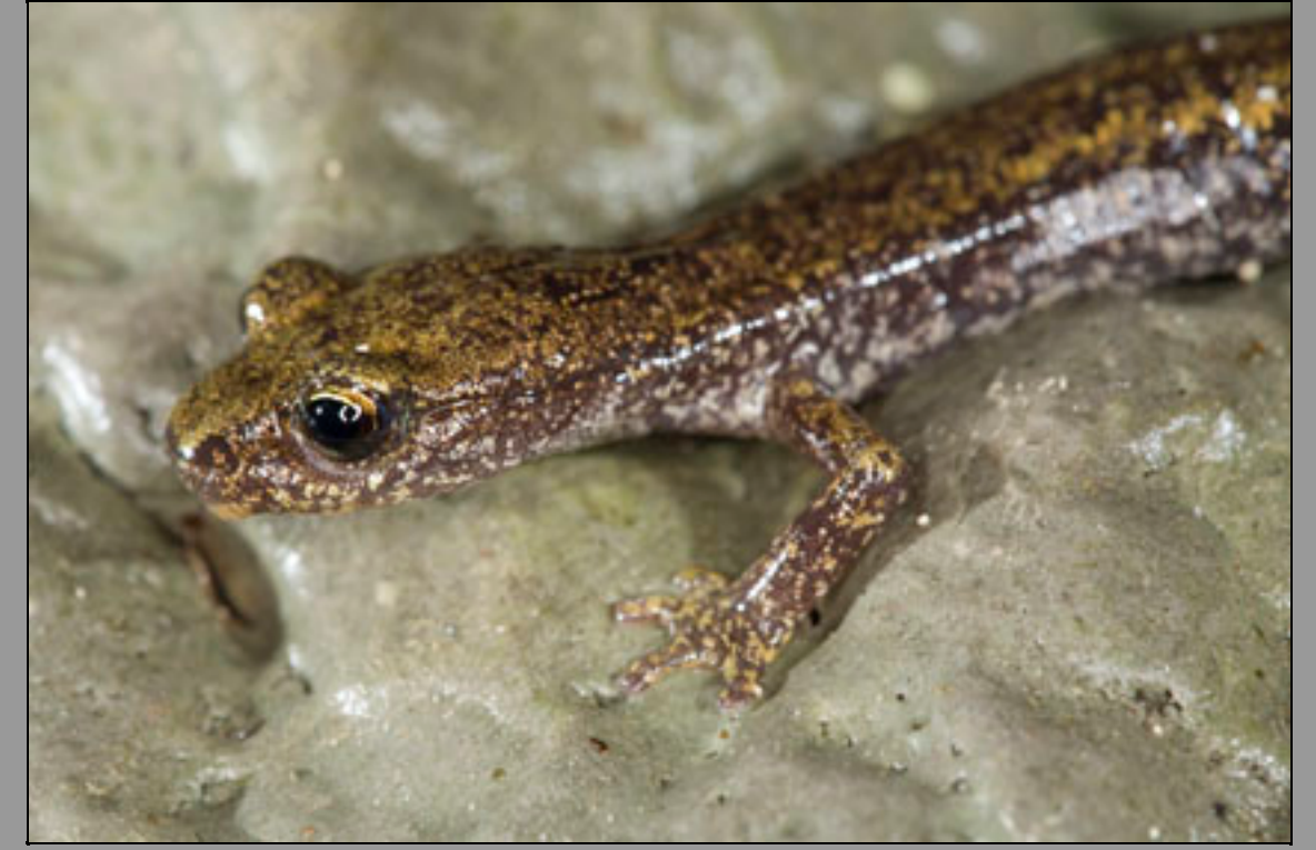
Strinati's Cave Salamander (Speleomantes strinatii strinatii)