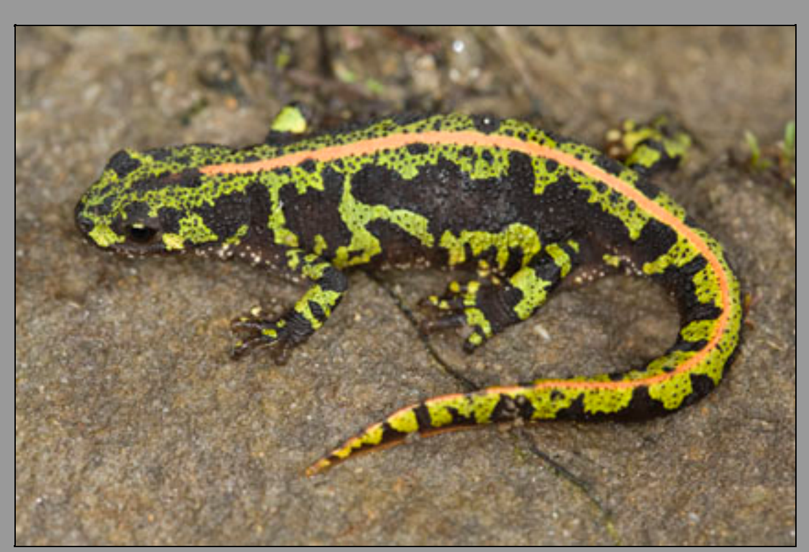
Marbled newt (Triturus marmoratus)