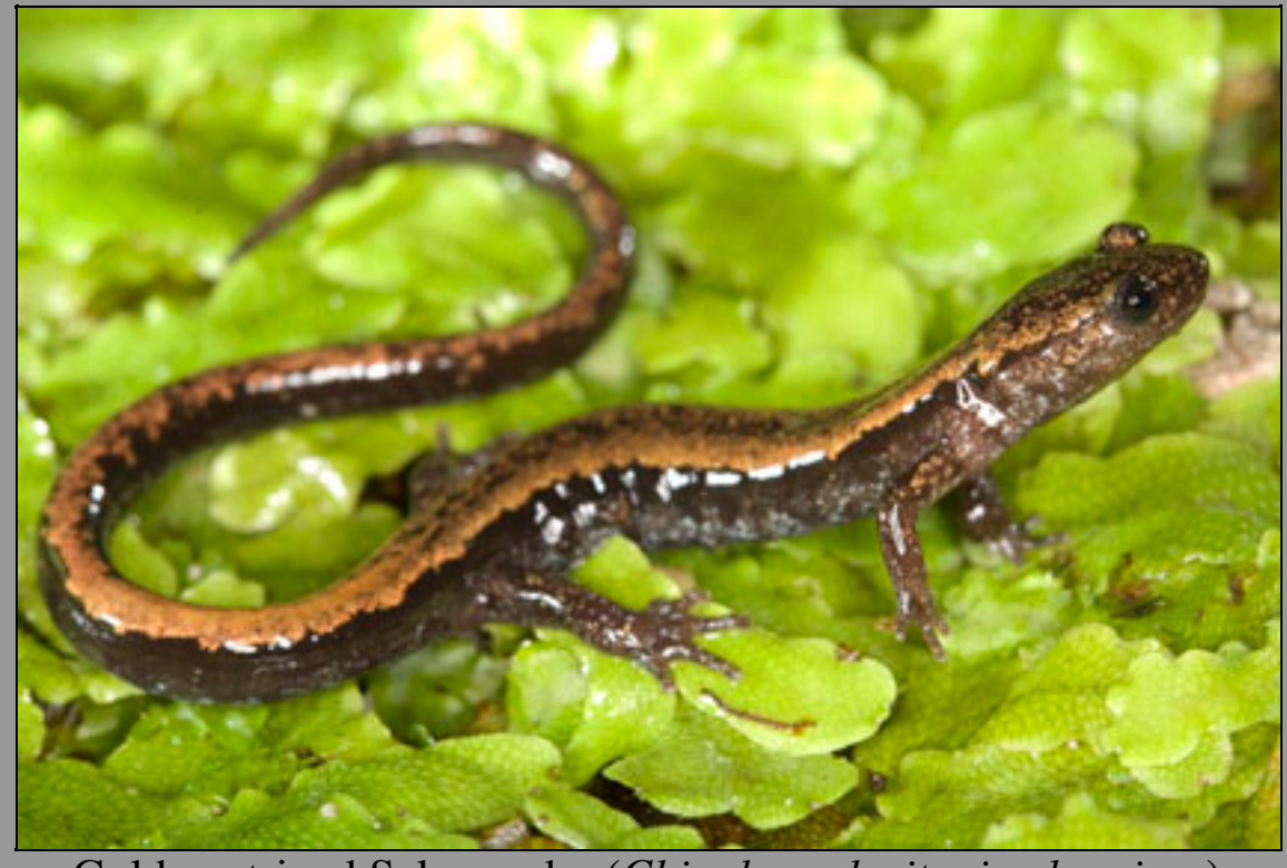
Golden-striped Salamander (Chioglossa lusitanica longipes)