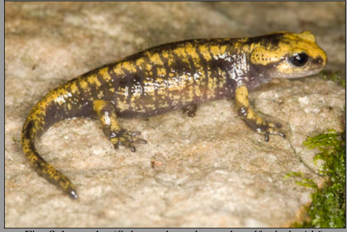
Fire Salamander (Salamandra salamandra alfredschmidti)