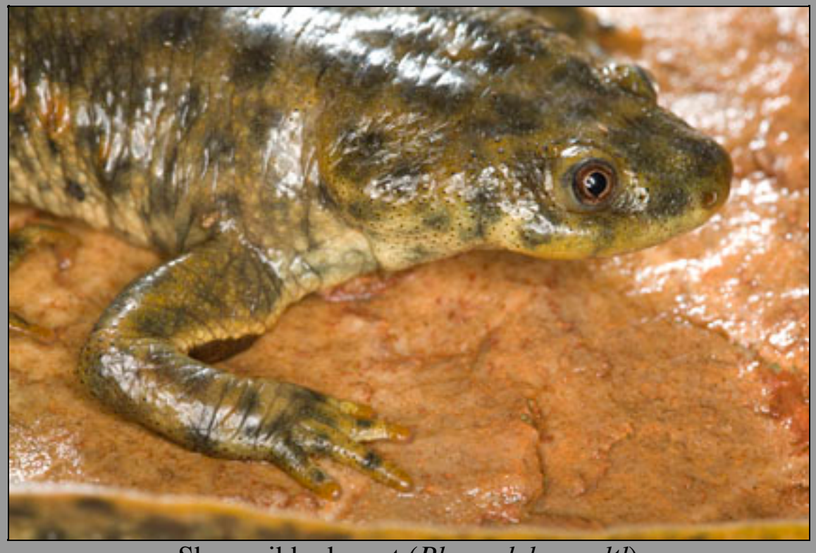
Sharp-ribbed newt (Pleurodeles waltl)