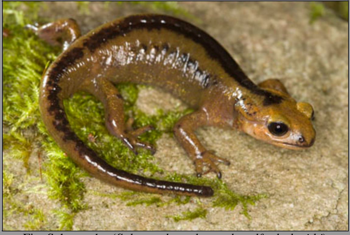
Fire Salamander (Salamandra salamandra alfredschmidti)