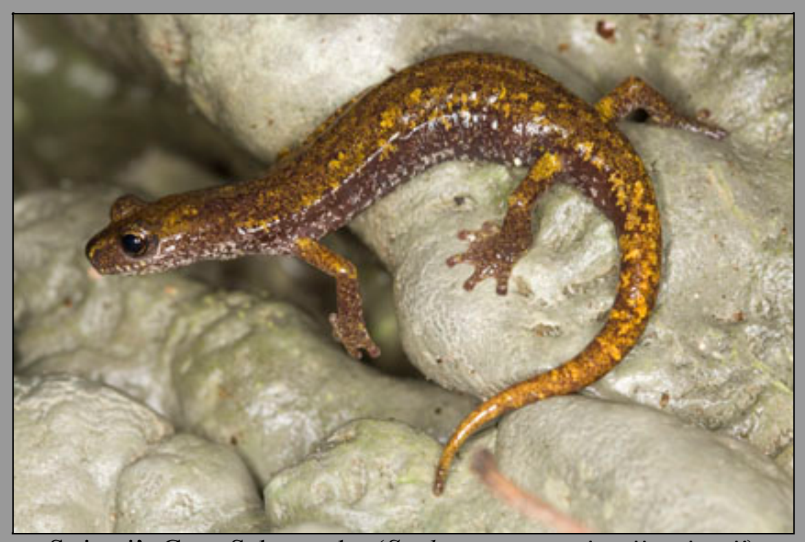
Strinati's Cave Salamander (Speleomantes strinatii strinatii)