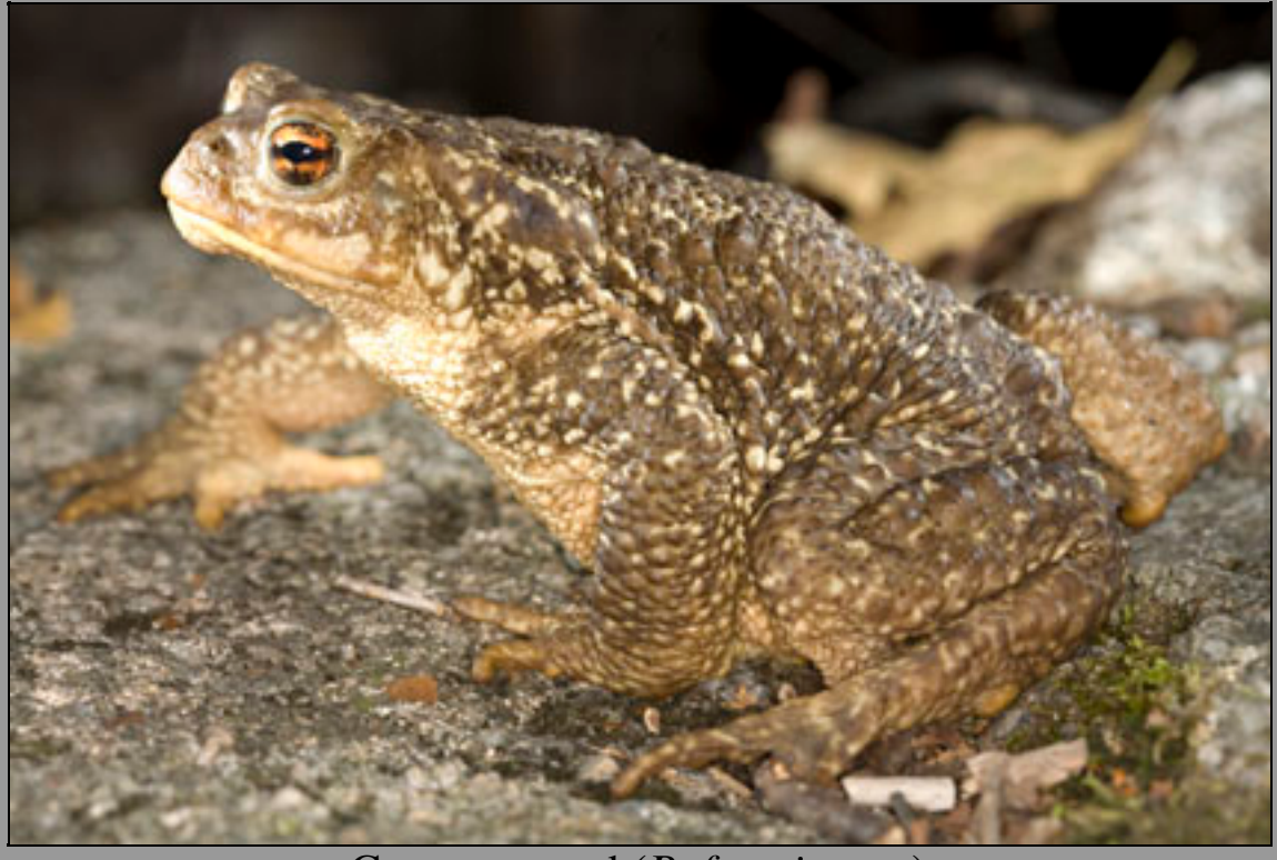
Common toad (Bufo spinosus)