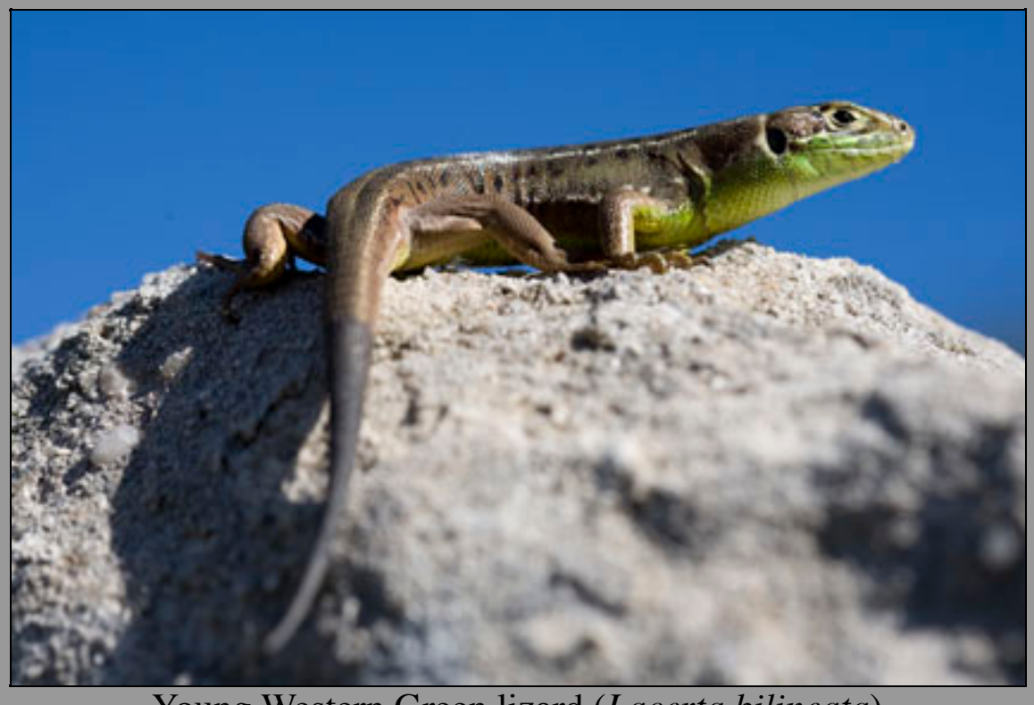
Young Western Green lizard (Lacerta bilineata)