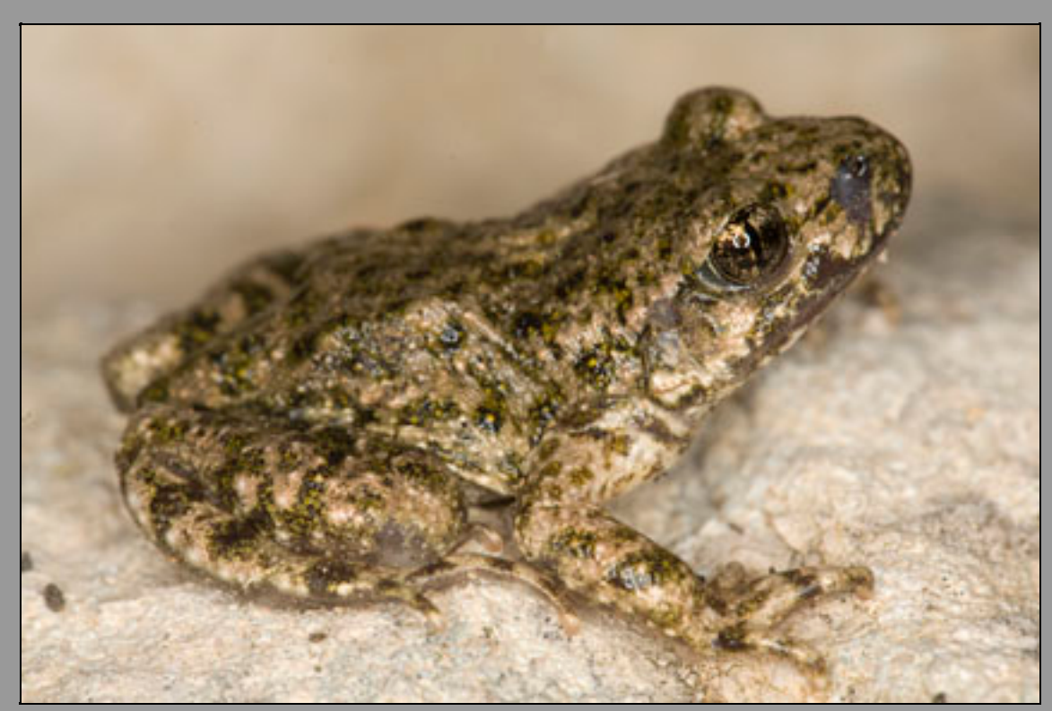
Southern Midwife toad (Alytes dickhilleni), sub-adult