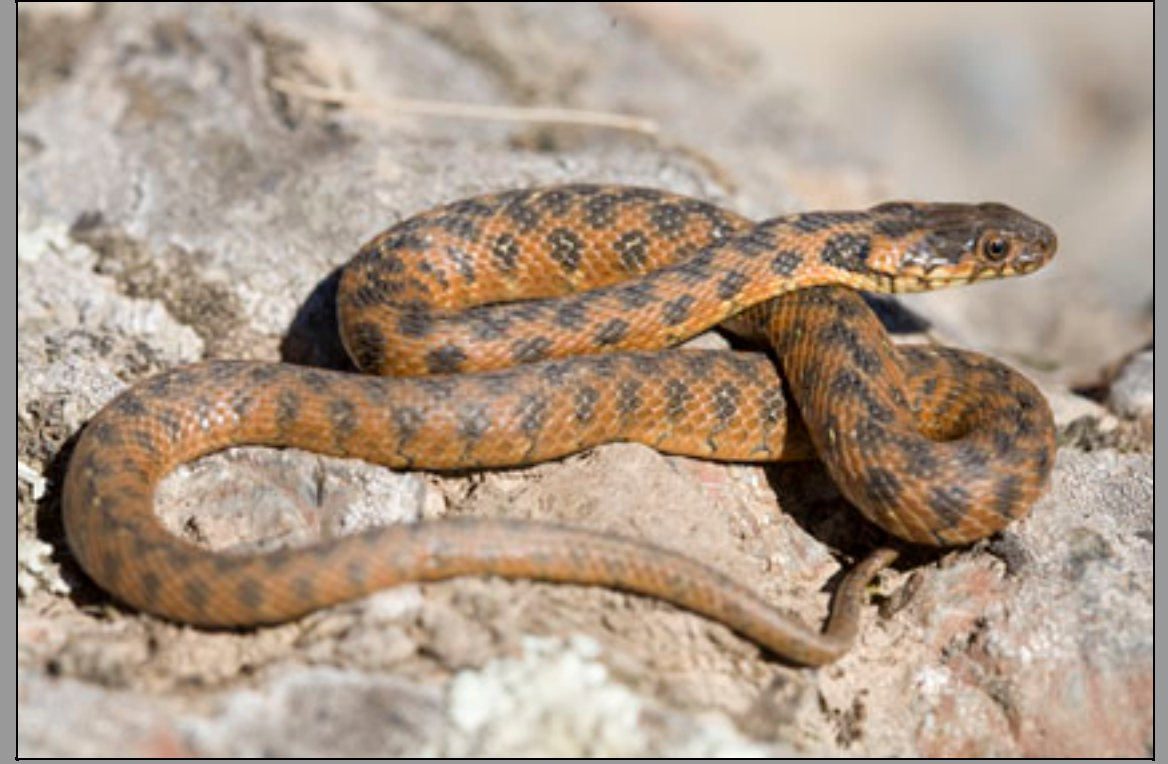
Viperine snake (Natrix maura)