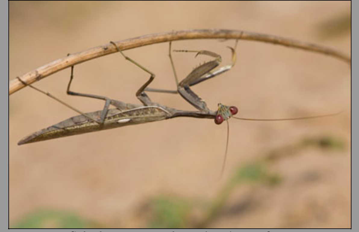
Sphodromantis viridis, male, a brown form