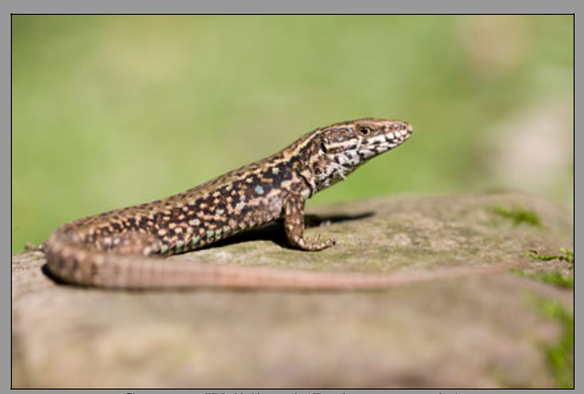
Common Wall lizard ( Podarcis muralis )