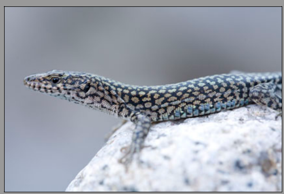
Iberian Wall lizard (Podarcis guadarramae lusitanicus)