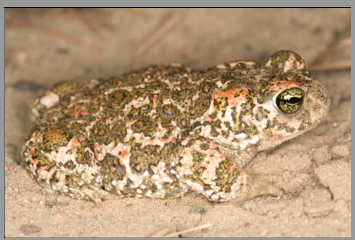
Natterjack toad (Bufo calamita)