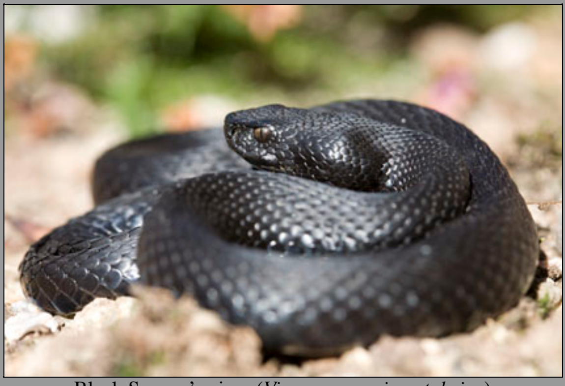
Black Seoane's viper (Vipera seoanei cantabrica)