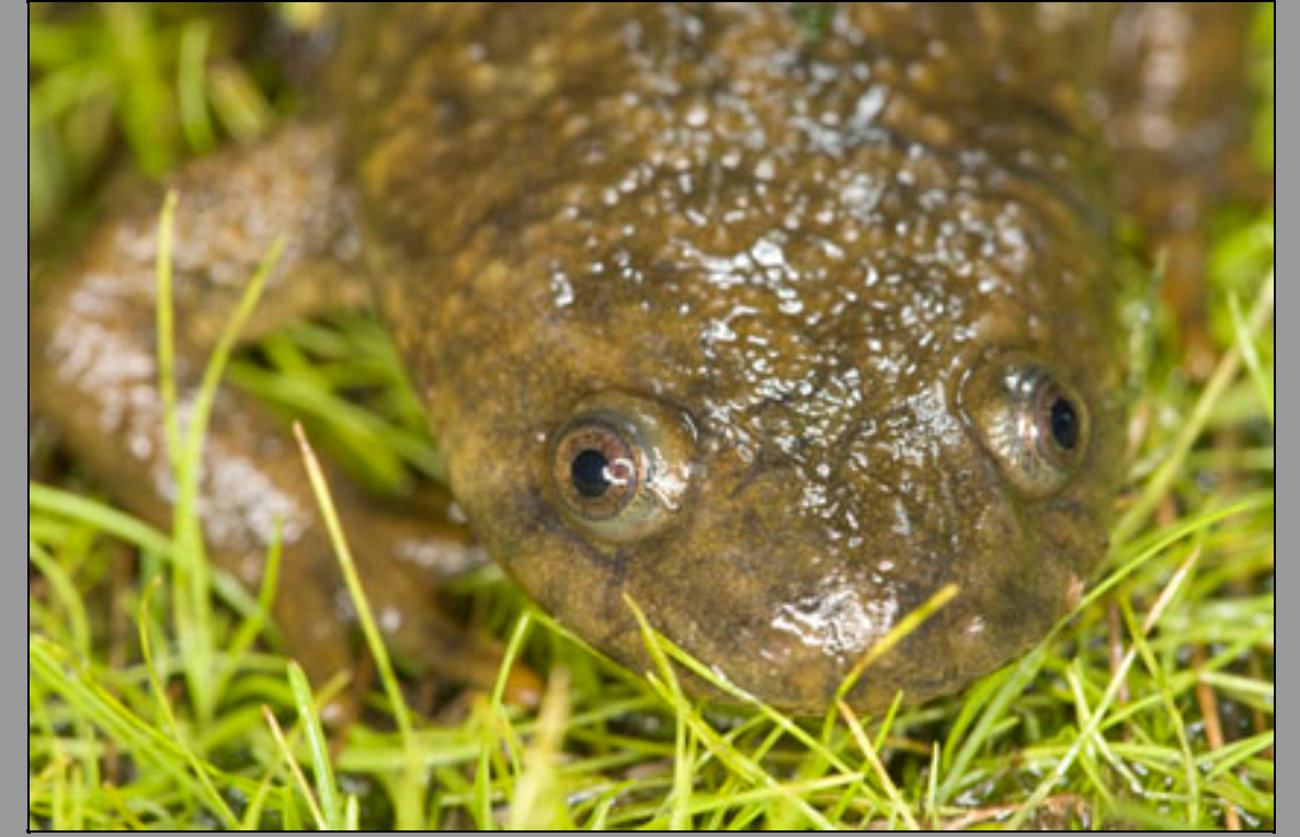
Sharp-ribbed newt (Pleurodeles waltl)