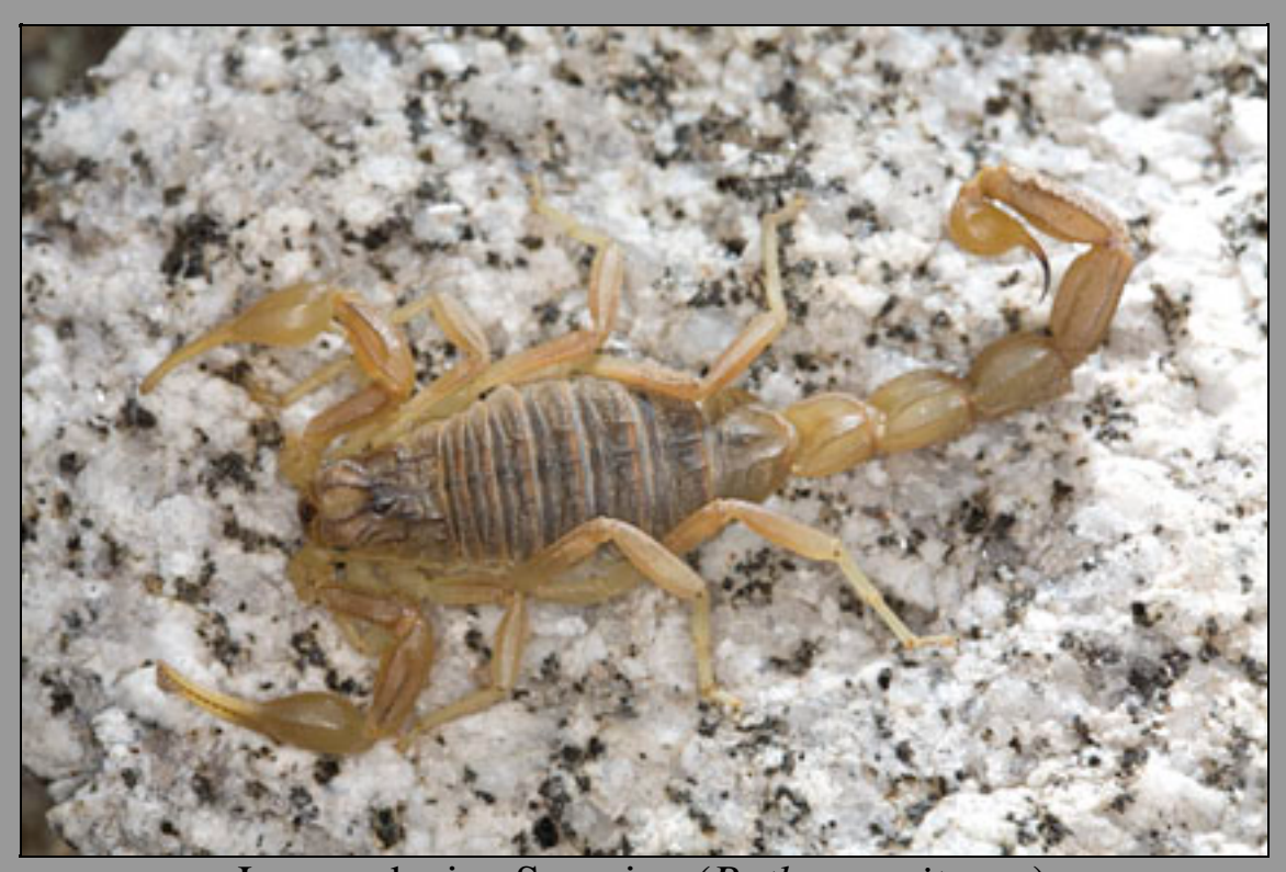
Languedocien Scorpion (Buthus occitanus)

Parc de Monfragüe and surroundings. I would have never thought to have seen such a diverse and dense amount of amphibians at this time of year, some species were hard to locate such as Iberian Midwife toad (Alytes cisternasii). These toads calling in numbers within dense vegetation! Otherwise there were many Spanish terrapins (Mauremys leprosa) like always at Monfragüe, I even hurt my right thumb trying to catch one, which complicated the rest of my trip (especially to turn over stones!).