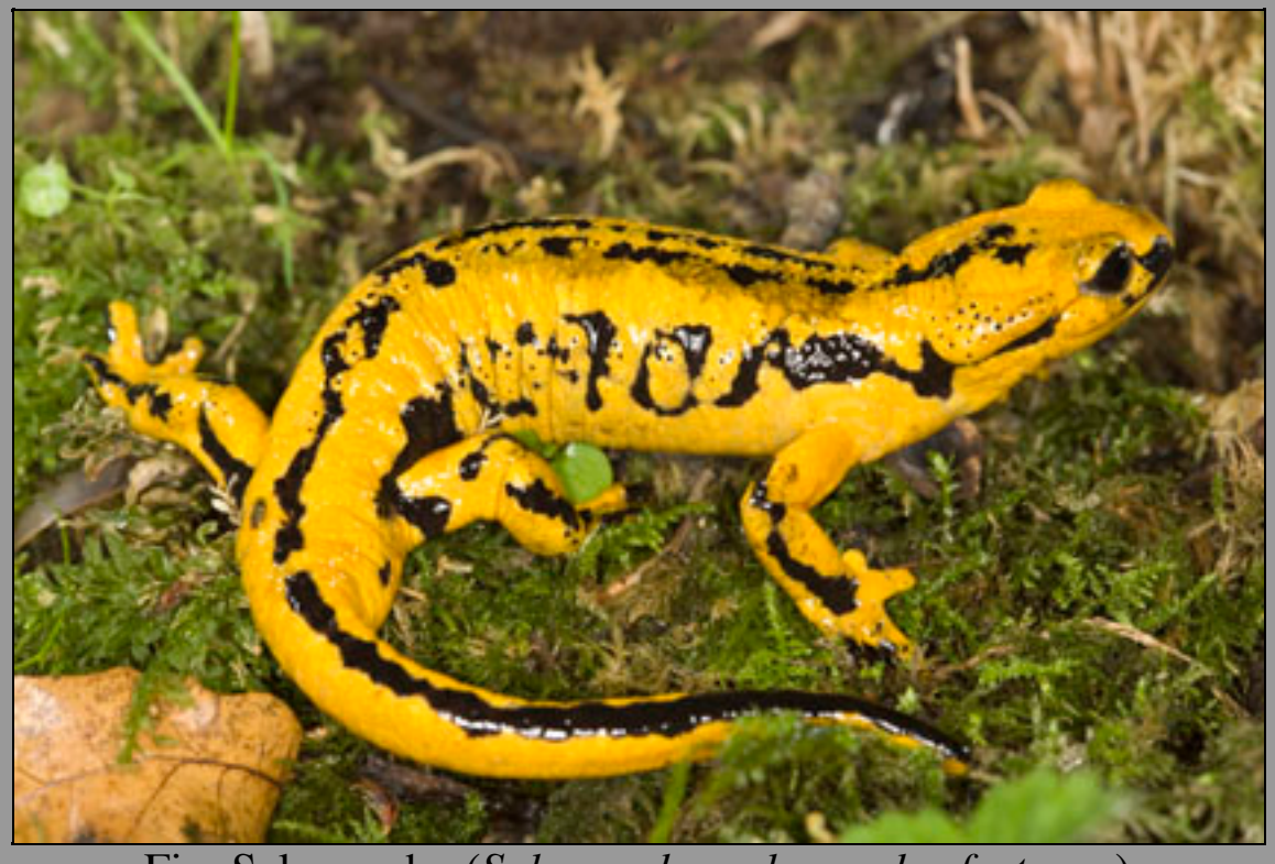
Fire Salamander (Salamandra salamandra fastuosa)