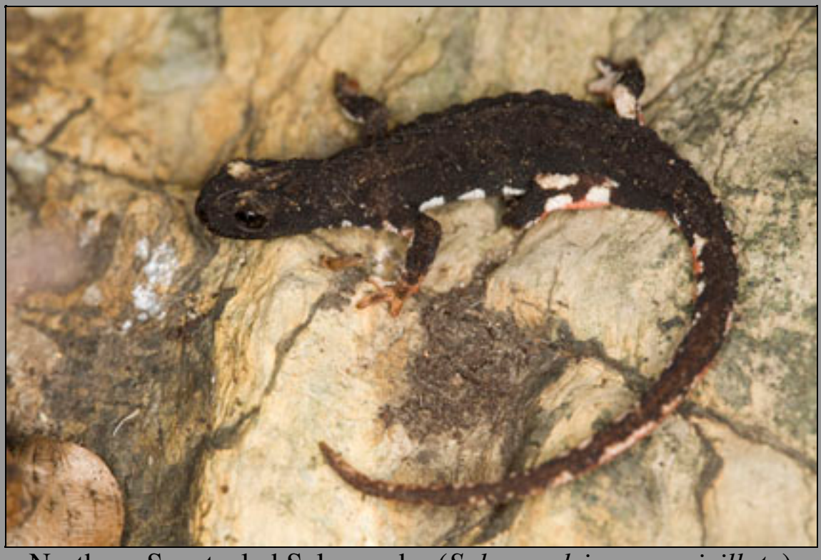
Northern Spectacled Salamander (Salamandrina perspicillata)