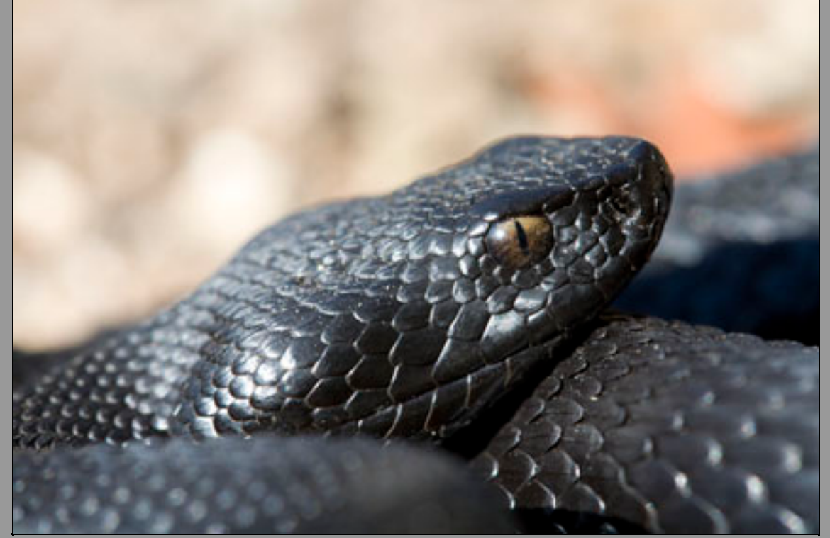
Black Seoane's viper (Vipera seoanei cantabrica)