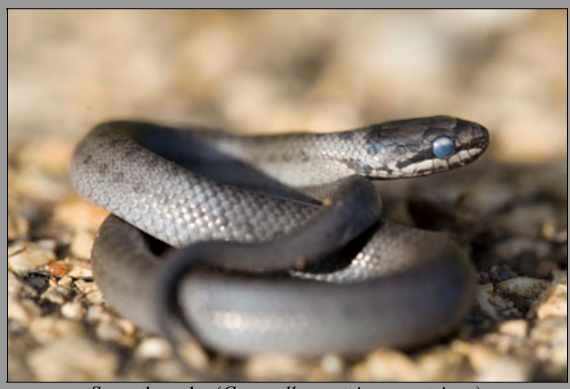
Smooth snake (Coronella austriaca austriaca)

A flying visit in the Doubs region to find black Adders ( Vipera berus ). Not one snake was visible except from this very young Smooth snake ( Coronella austriaca austriaca )... Maybe too late in the season for Adders.