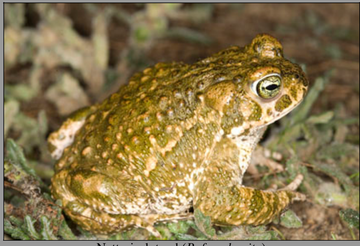
Natterjack toad (Bufo calamita)