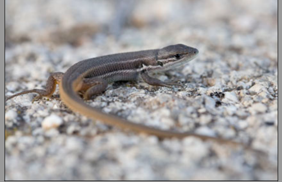
Young Large Psammodromus (Psammodromus algirus)