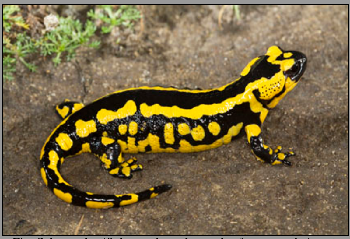
Fire Salamander (Salamandra salamandra fastuosa x bejarae)

We missed Salamandra s. alfredschmidti, the weather was too dry on this day.