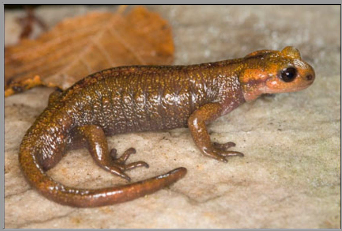
Fire Salamander (Salamandra salamandra alfredschmidti)