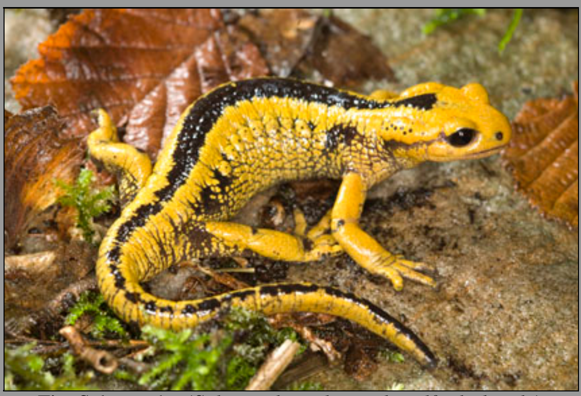
Fire Salamander (Salamandra salamandra alfredschmidti)

Whilst traveling back up from the south, I took the chance to return to the north back to the, Salamandra s. alfredschmidti sites. It turned out to be well worth it as I found tens of specimens in ideal conditions, rain. Here are some shots of the variability or the sub-species: