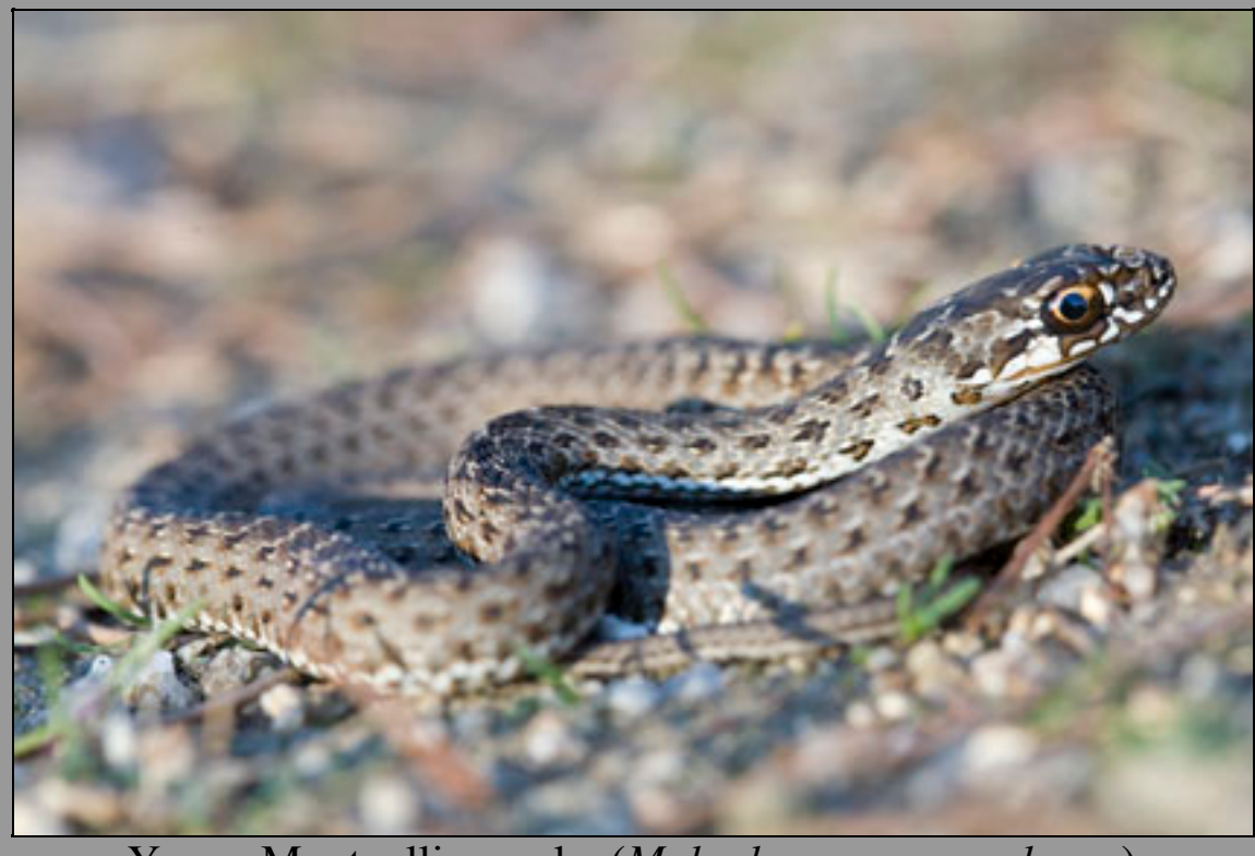
Young Montpellier snake (Malpolon monspessulanus)