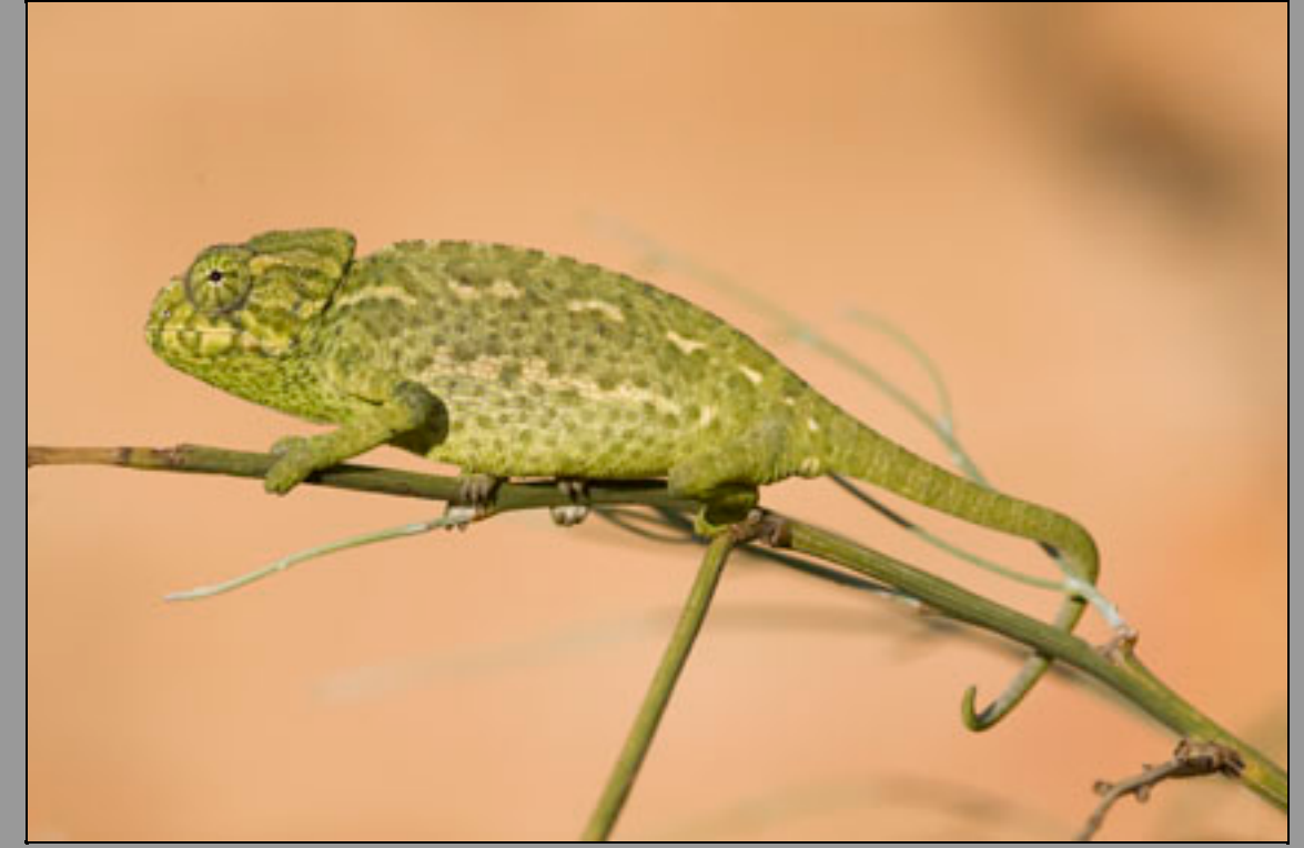
Mediterranean Chameleon (Chamaeleo chamaeleon)