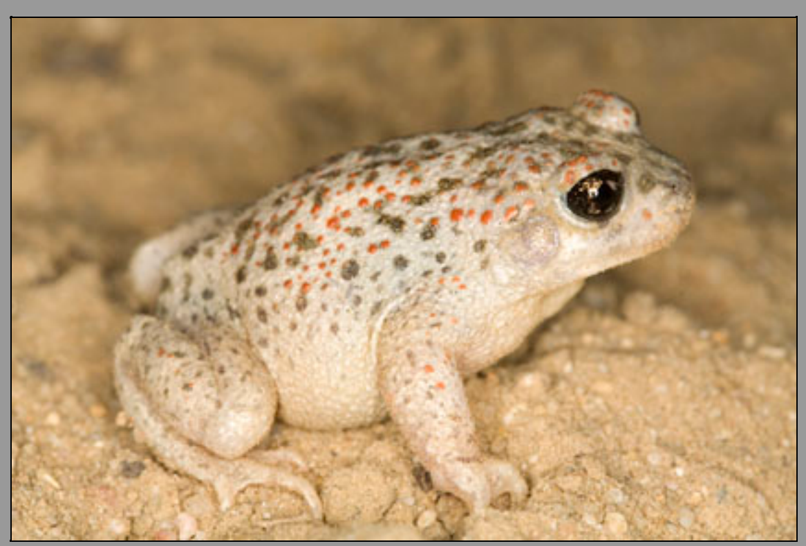
Iberian Midwife toad (Alytes cisternasii), female