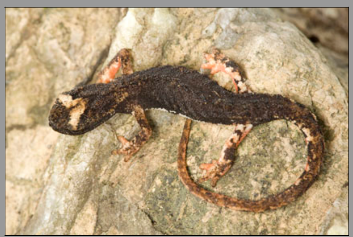
Northern Spectacled Salamander (Salamandrina perspicillata)