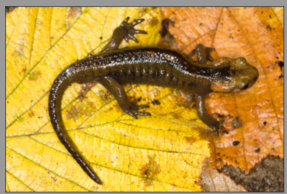
Fire Salamander (Salamandra salamandra alfredschmidti)