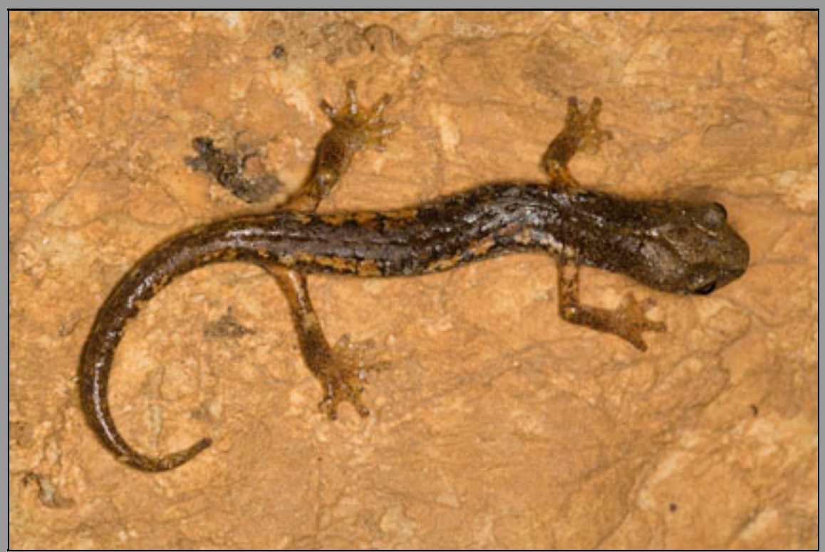
Ambrosi's Cave Salamander (Speleomantes ambrosii)