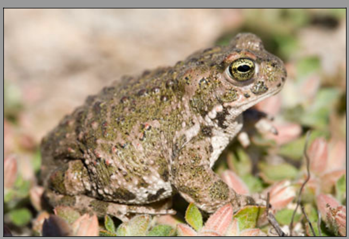
Natterjack toad (Bufo calamita)