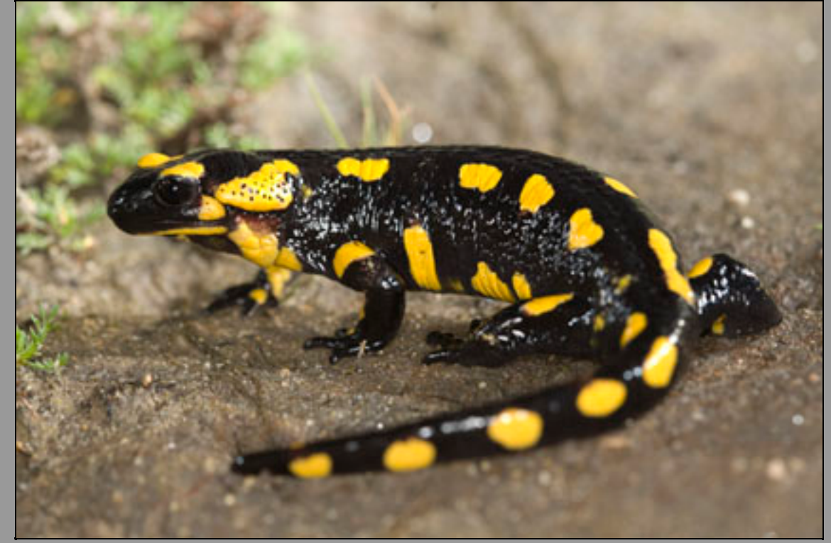
Fire Salamander (Salamandra salamandra fastuosa x bejarae)