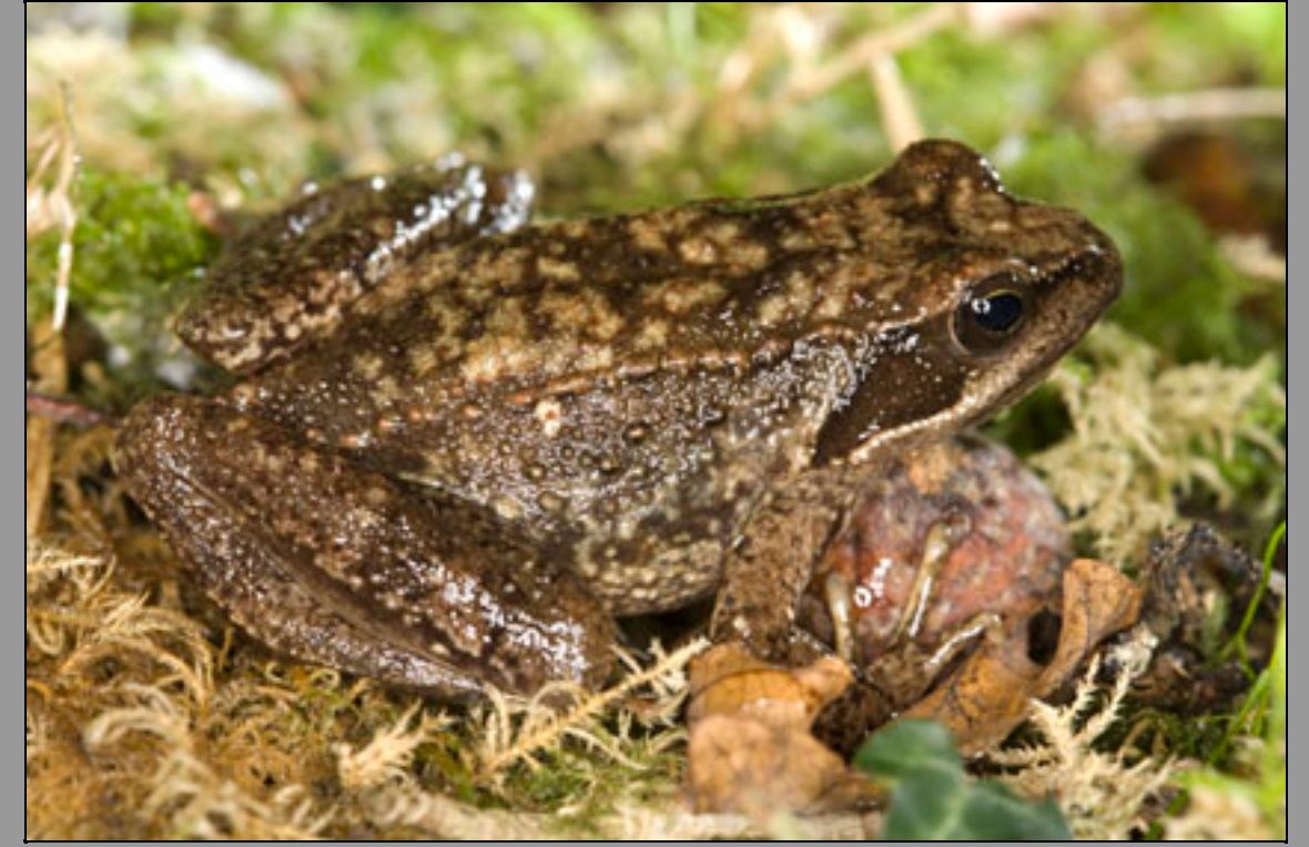
Iberian frog (Rana iberica)