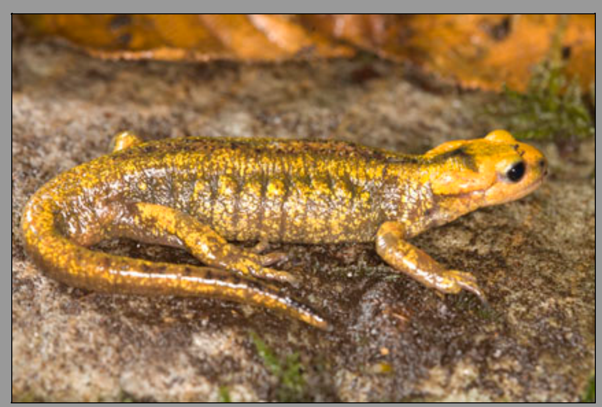
Fire Salamander (Salamandra salamandra alfredschmidti)