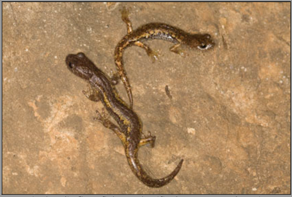
Ambrosi's Cave Salamander (Speleomantes ambrosii)