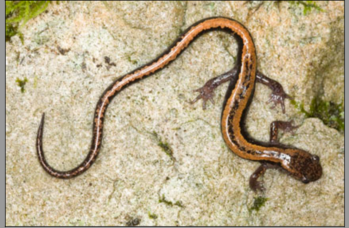
Golden-striped Salamander (Chioglossa lusitanica longipes)