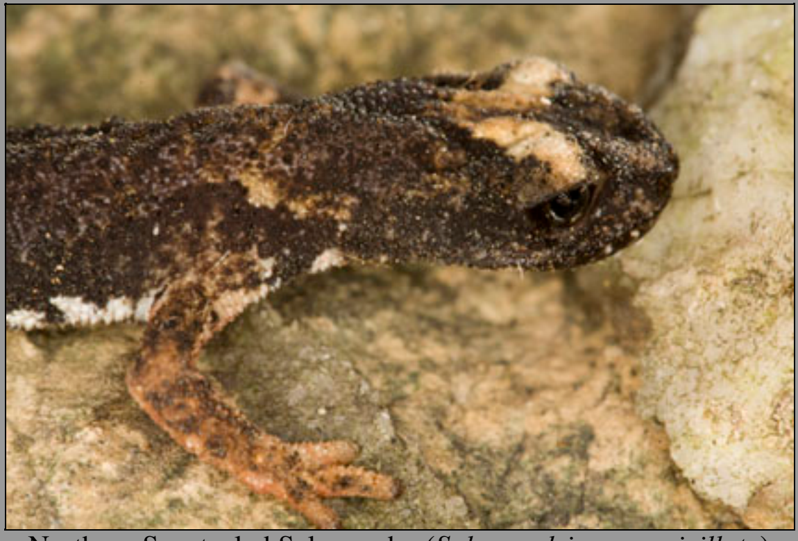
Northern Spectacled Salamander (Salamandrina perspicillata)