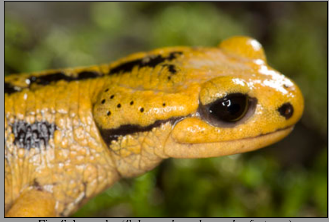
Fire Salamander (Salamandra salamandra fastuosa)