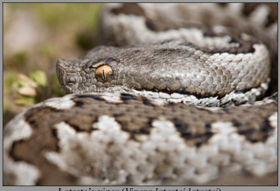
Lataste's viper (Vipera latastei latastei)