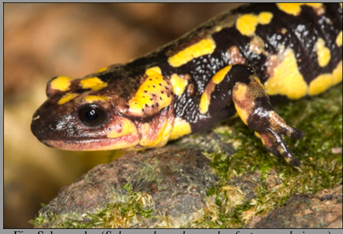
Fire Salamander (Salamandra salamandra fastuosa x bejarae)