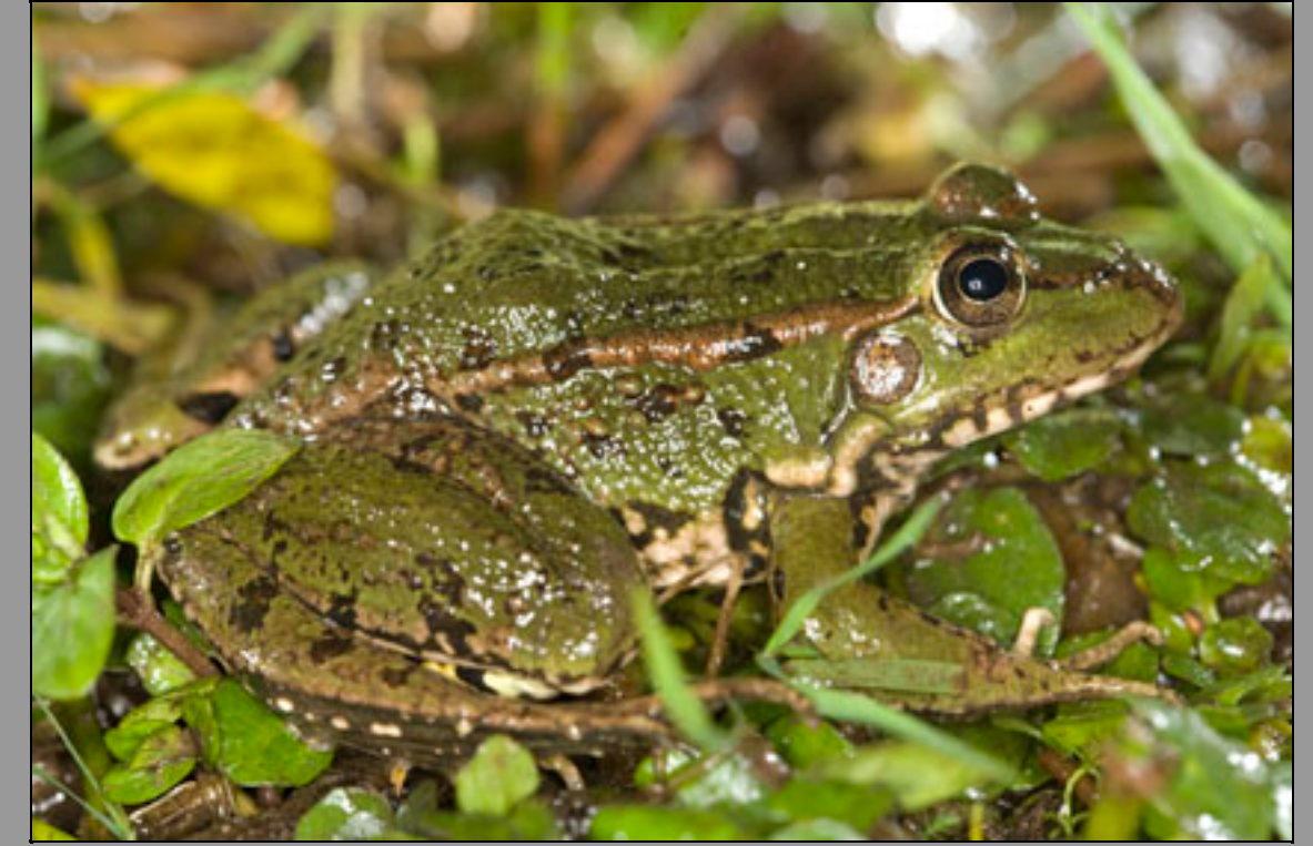
Iberian Water frog (Pelophylax perezi)