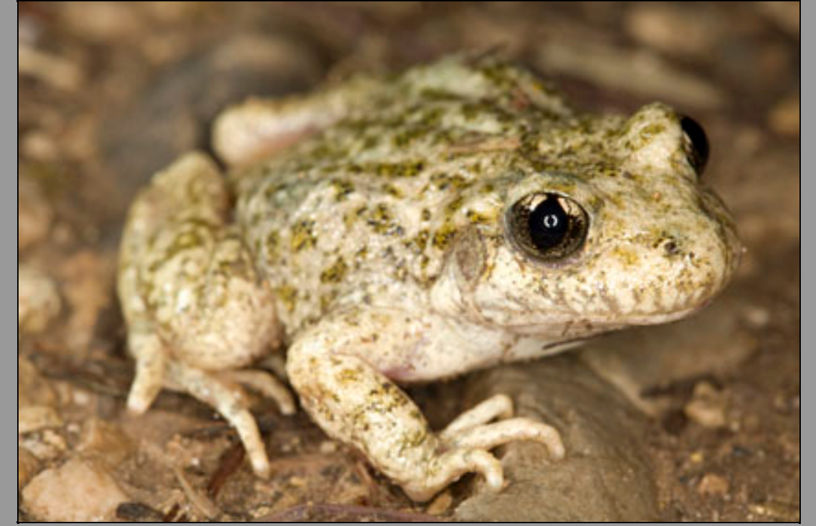
Southern Midwife toad (Alytes dickhilleni), adult