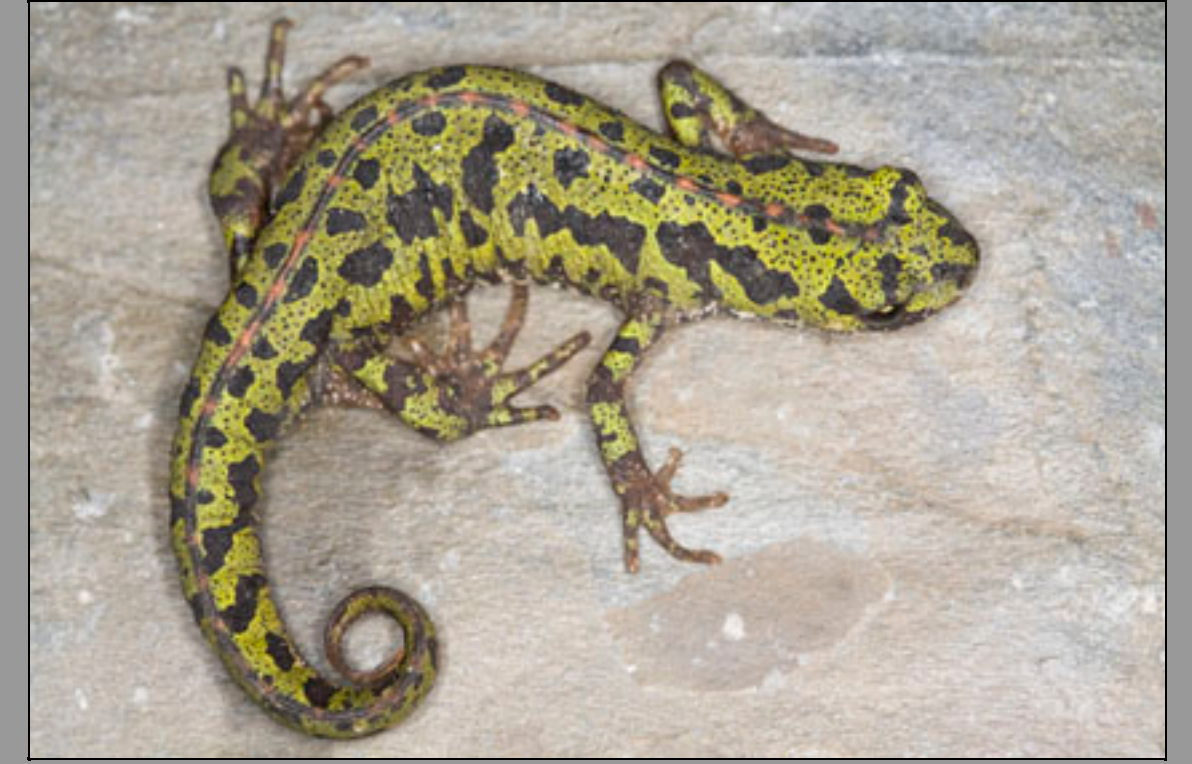
Southern Marbled newt (Triturus pygmaeus)