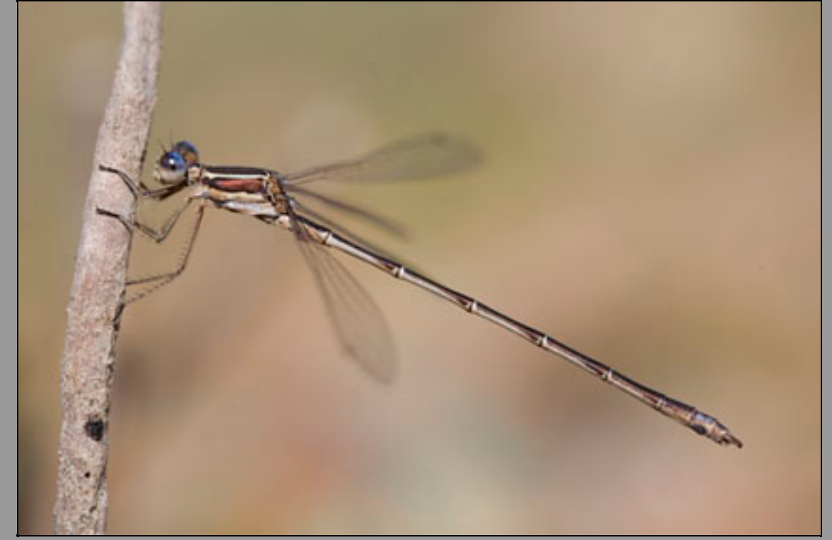
Lestes virens, male