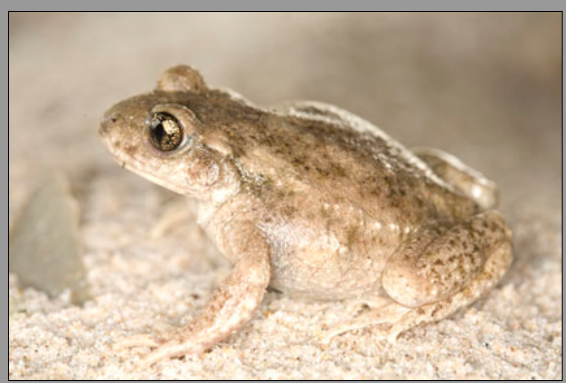
Common Midwife toad (Alytes obstetricans pertinax)