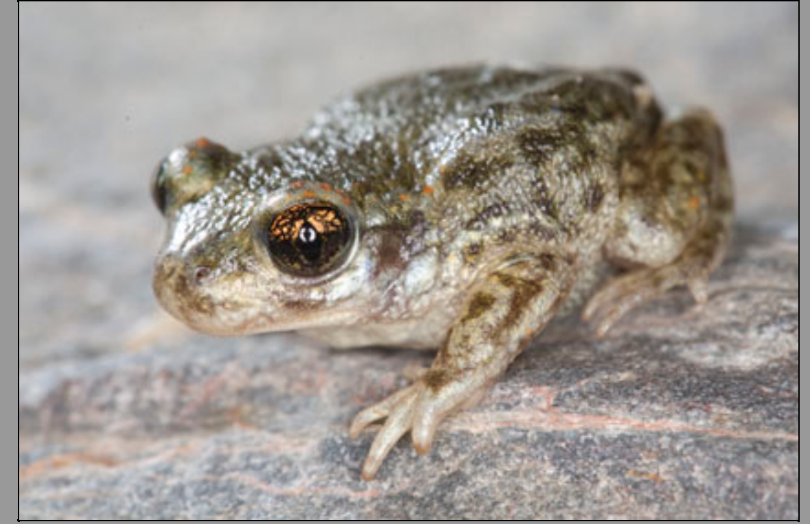
Iberian Midwife toad (Alytes cisternasii)