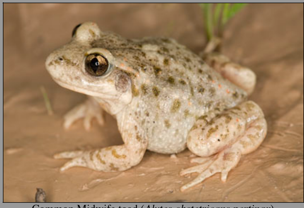
Common Midwife toad (Alytes obstetricans pertinax)