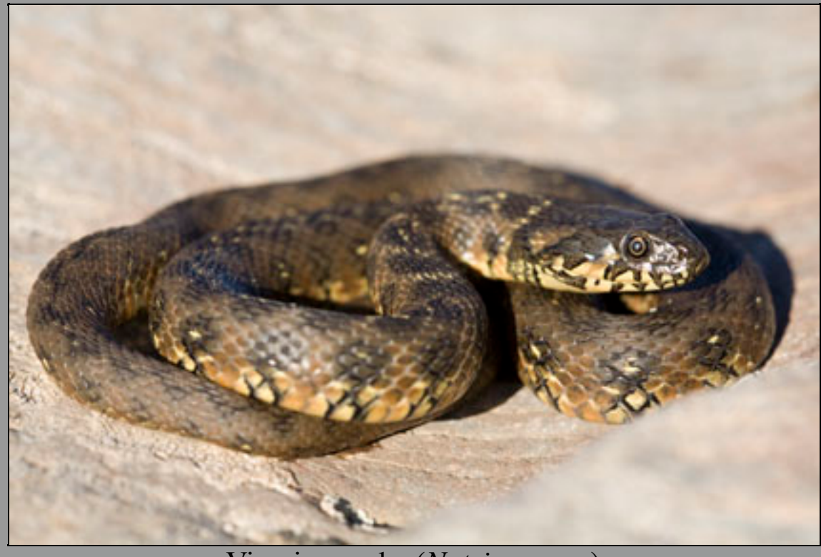
Viperine snake (Natrix maura)