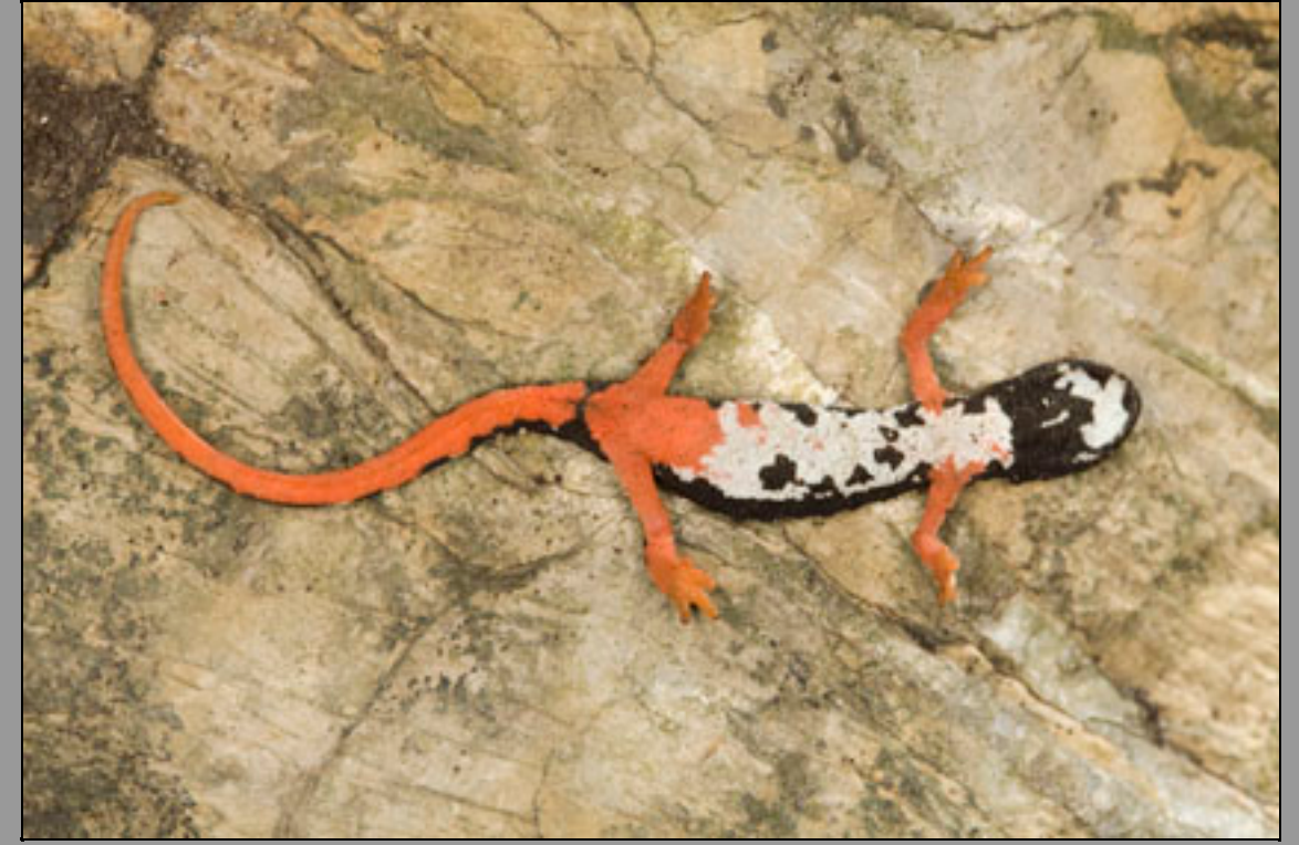
Northern Spectacled Salamander (Salamandrina perspicillata)