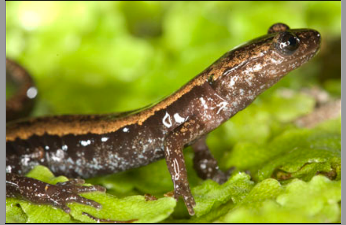
Golden-striped Salamander (Chioglossa lusitanica longipes)