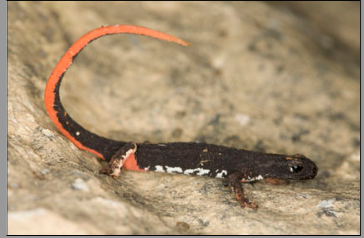
Northern Spectacled Salamander (Salamandrina perspicillata)