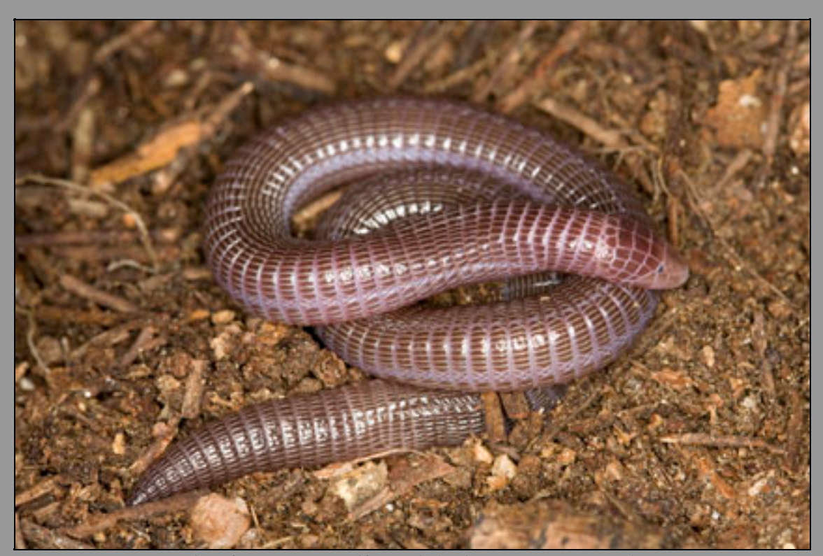
Iberian Worm lizard (Blanus cinereus)