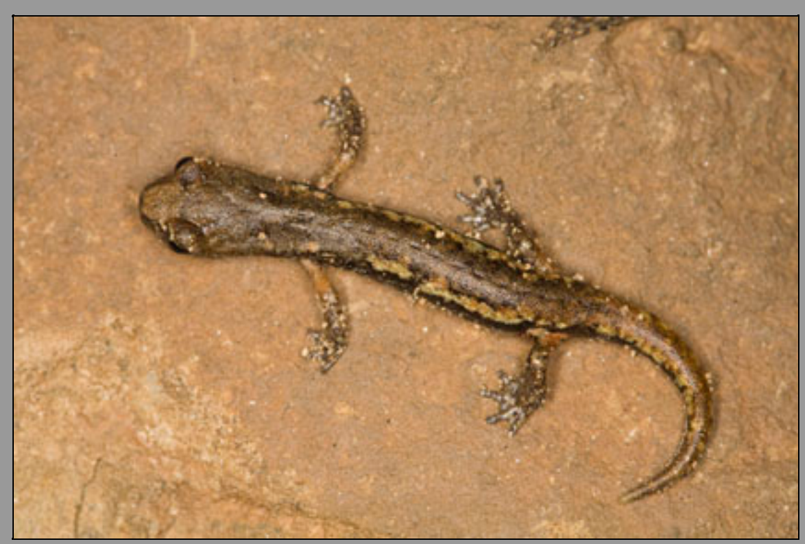
Ambrosi's Cave Salamander (Speleomantes ambrosii)