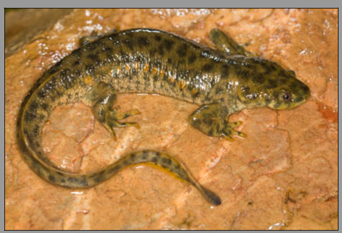
Sharp-ribbed newt ( Pleurodeles waltl )