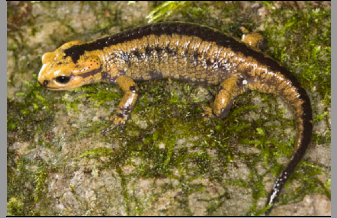
Fire Salamander (Salamandra salamandra alfredschmidti)