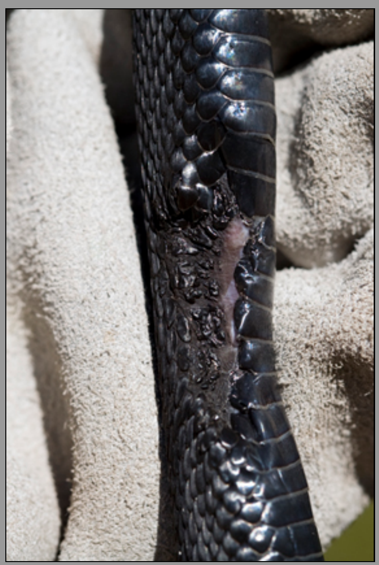
Wounds of the Seoane's viper...