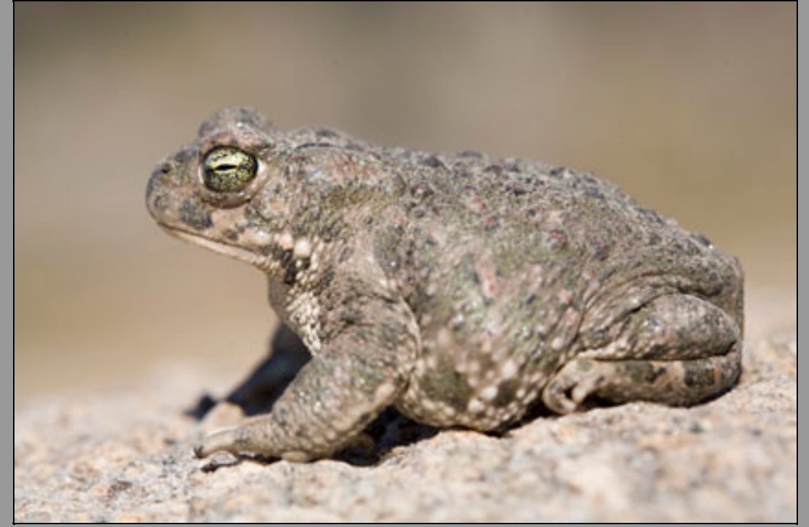
Natterjack toad (Bufo calamita)