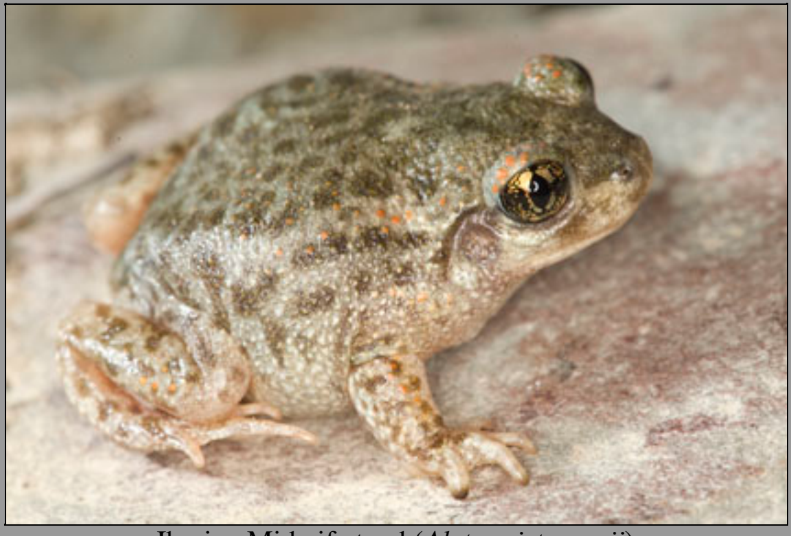
Iberian Midwife toad (Alytes cisternasii)