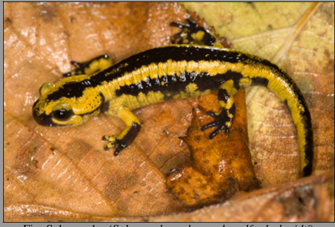
Fire Salamander (Salamandra salamandra alfredschmidti)