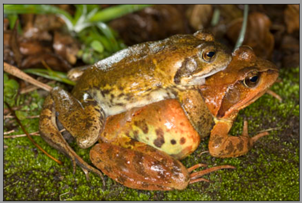
Amplexus of Common frog (Rana temporaria parvipalmata)