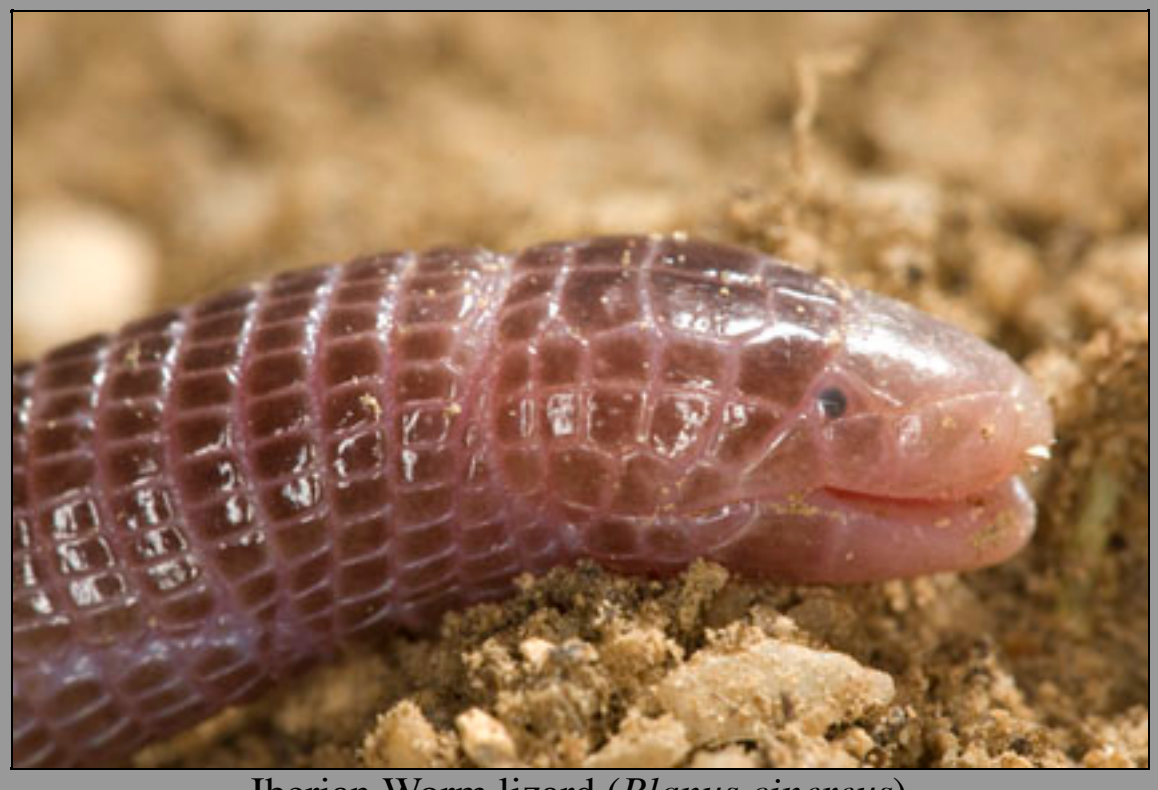
Iberian Worm lizard (Blanus cinereus)