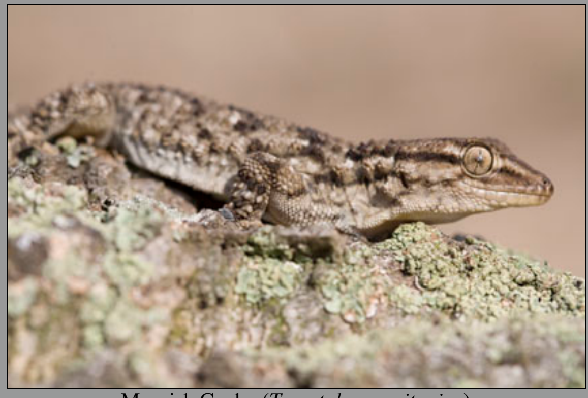
Moorish Gecko (Tarentola mauritanica)