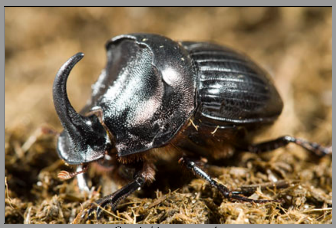
Copris hispanus, male

The weather was too dry to hope to find the southern sub-species of Fire Salamanders ( longirostris , morenica , crespoi ...), so I headed off to the Sierra de Segura to the East to try and find Southern Midwife toads ( Alytes dickhilleni ).