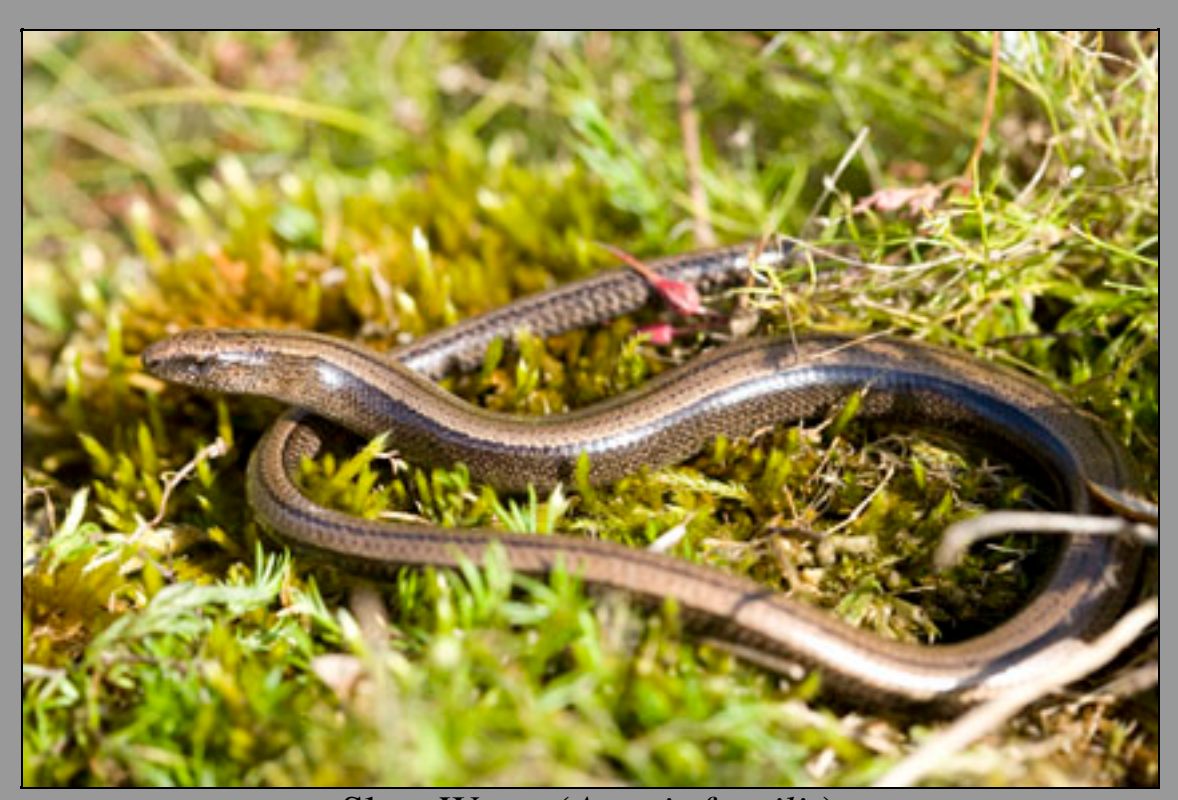
Slow Worm (Anguis fragilis)