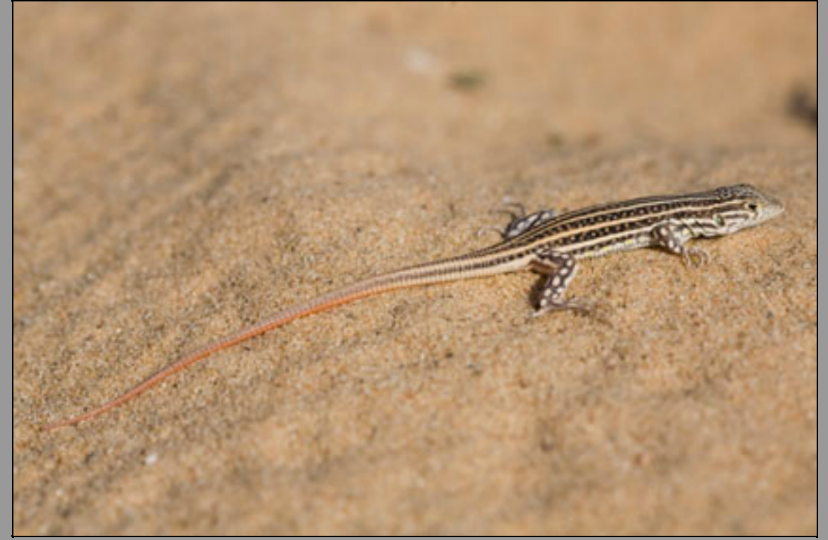
Young Spiny-footed lizard (Acanthodactylus erythrurus)