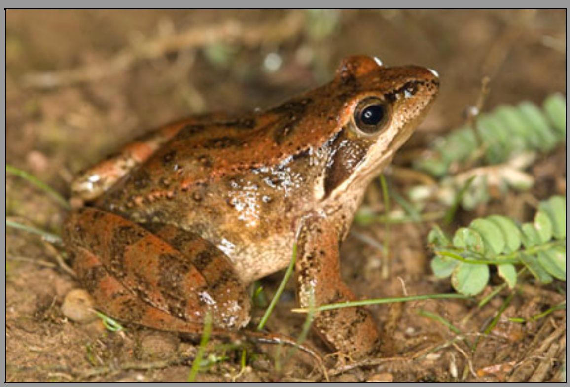
Iberian frog (Rana iberica)